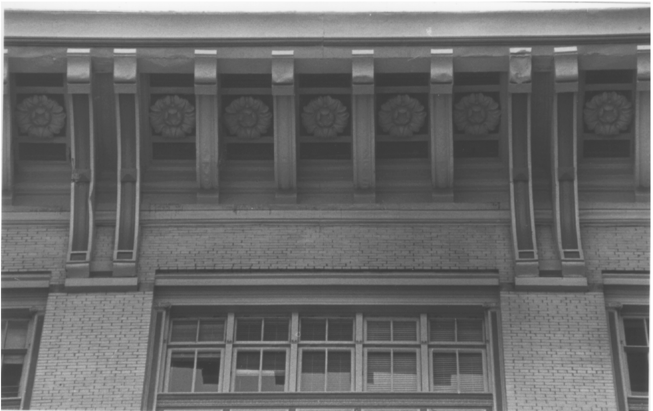
No. 130 West 57 th Street Studio Building Cornice detail