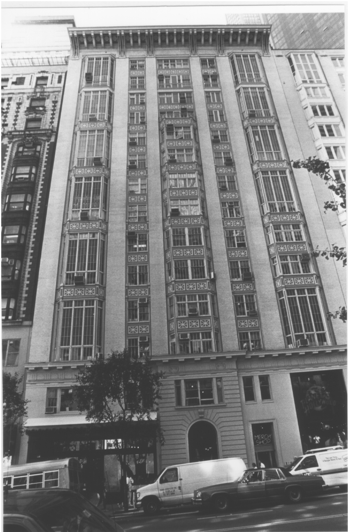
No. 130 West 57 th Street Studio Building 130 West 57 th Street, Manhattan