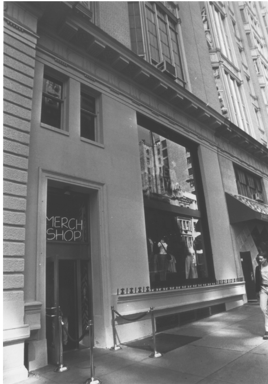
No. 130 West 57 th Street Ground story entrance and storefront