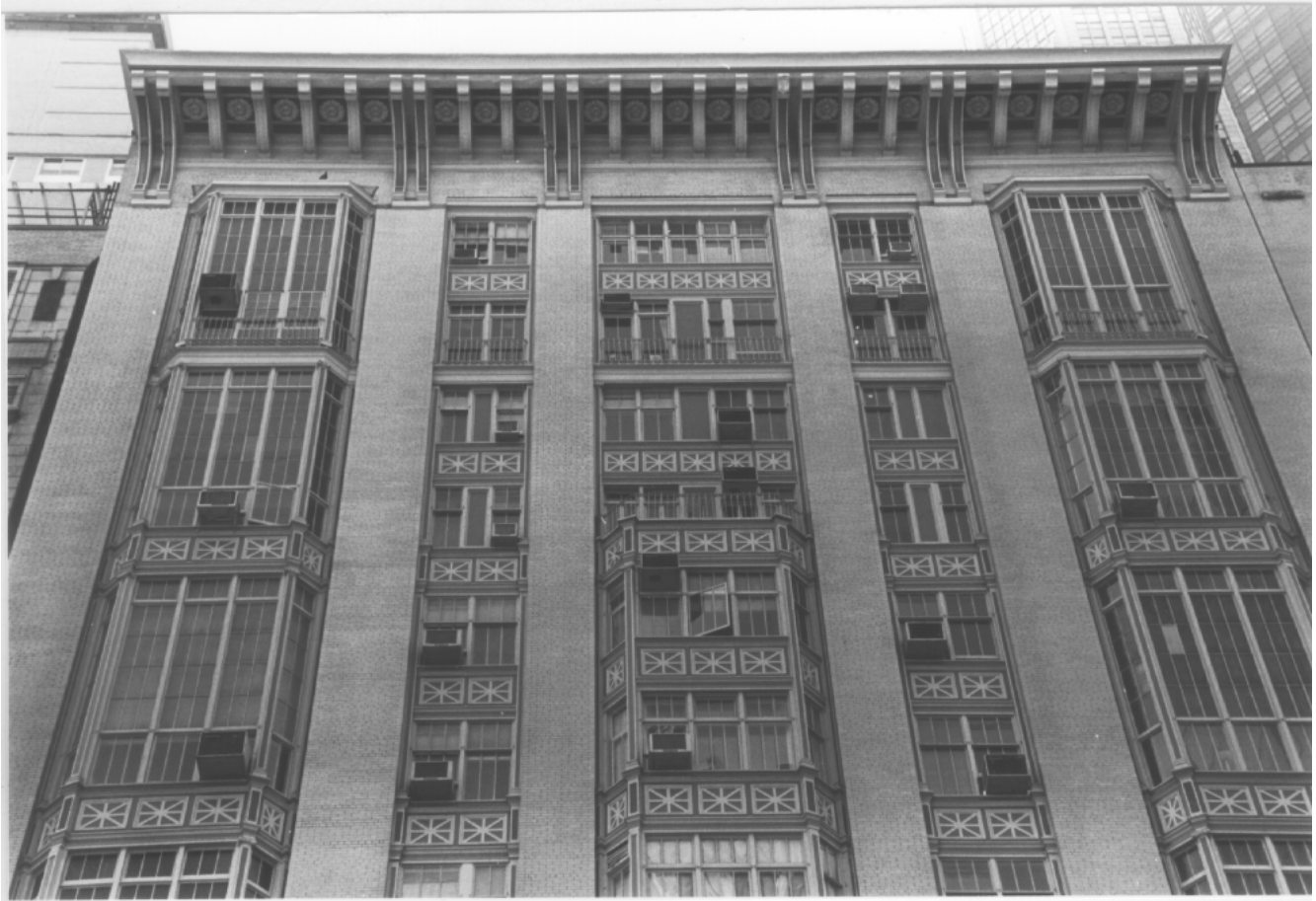
No. 130 West 57 th Street Studio Building Windows and cornice detail