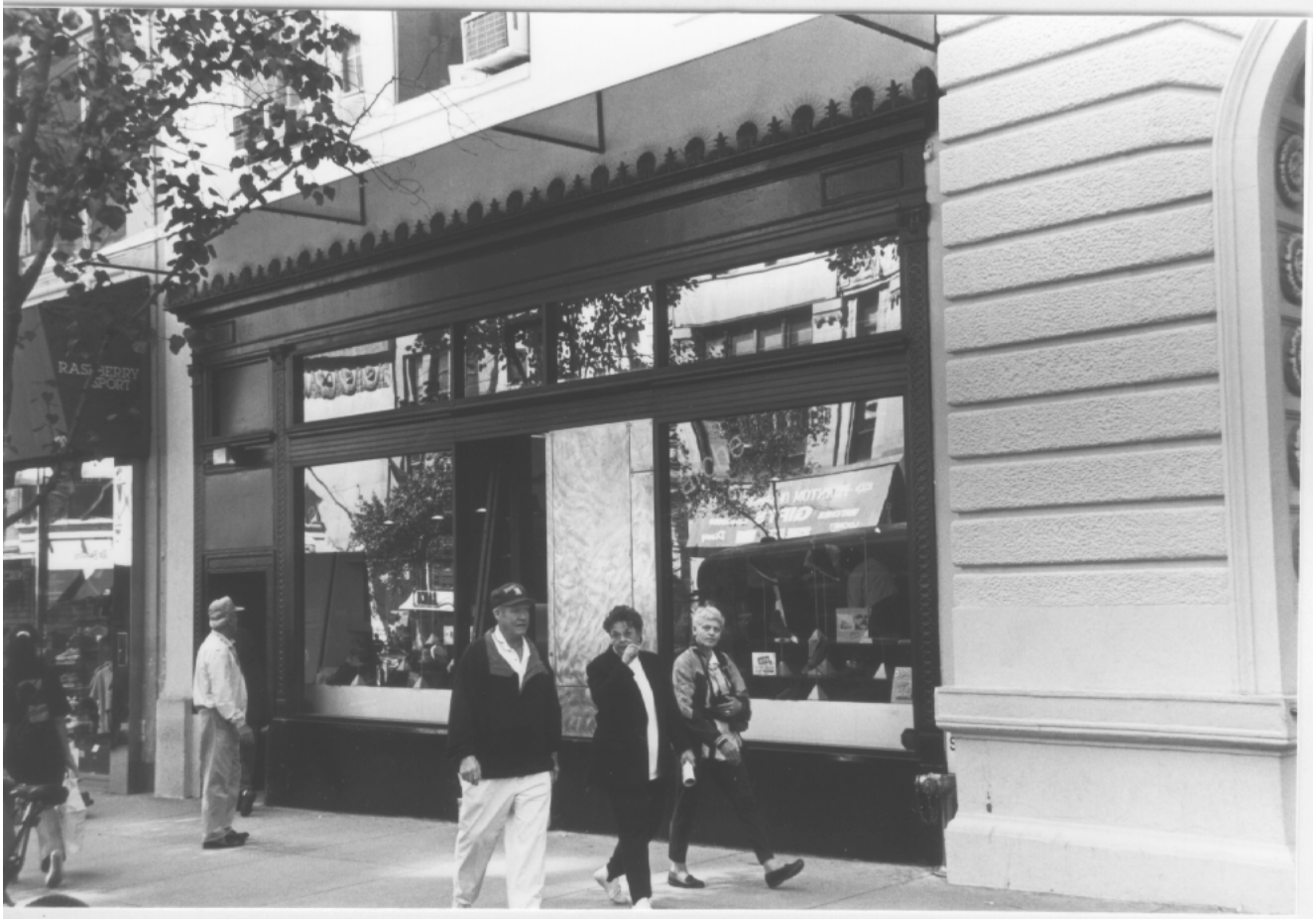
No. 130 West 57 th Street Studio Building Storefront detail