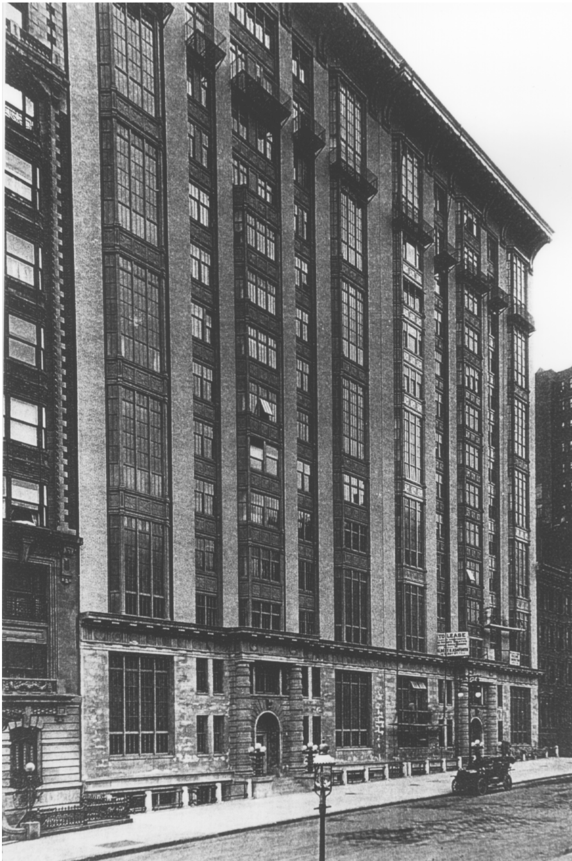
Nos. 130 and 140 West 57 th Street Buildings Borough of Manhattan Photo: c. 1909 Courtesy of Museum of the City of New York