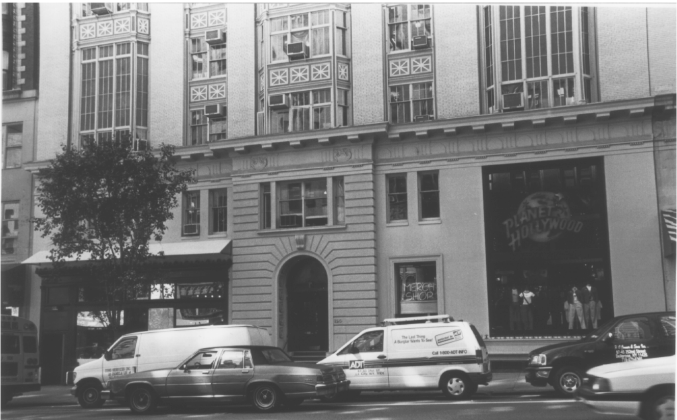
No. 130 West 57 th Street Studio Building Ground Story Detail