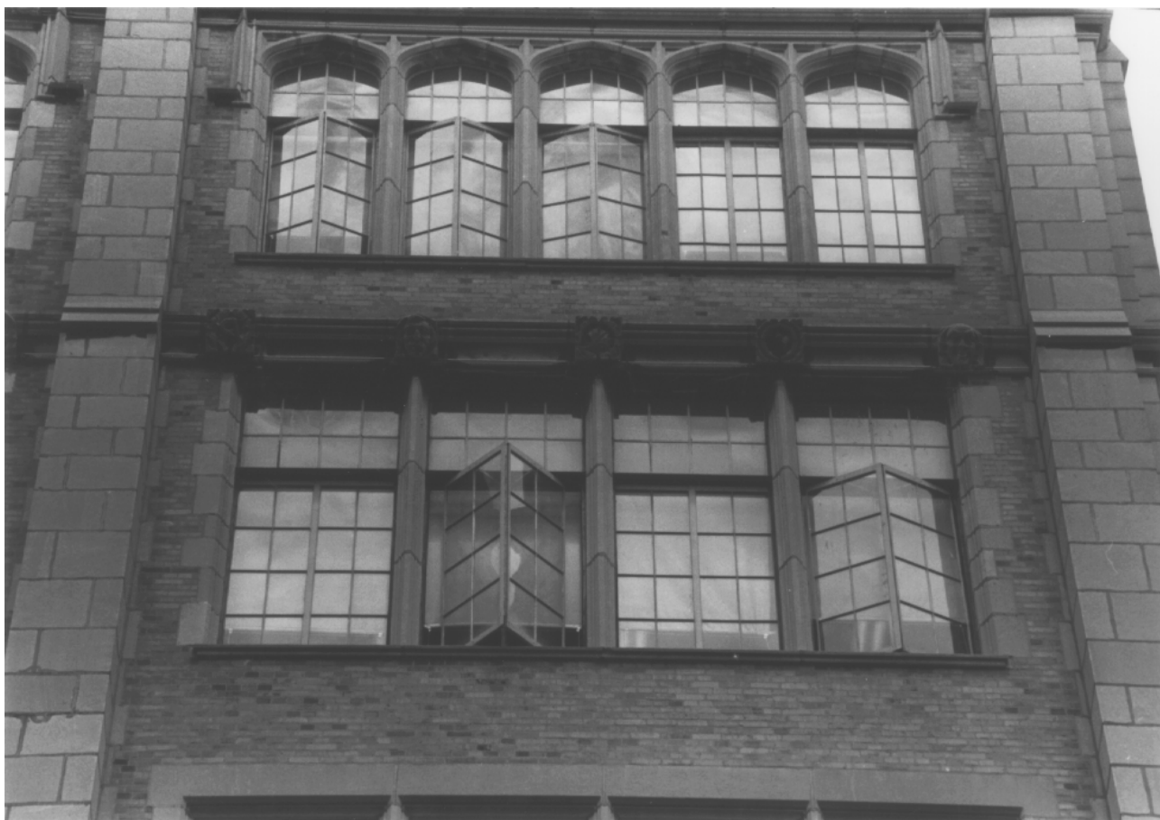
New York Training School for Teachers/New York Model School, window details