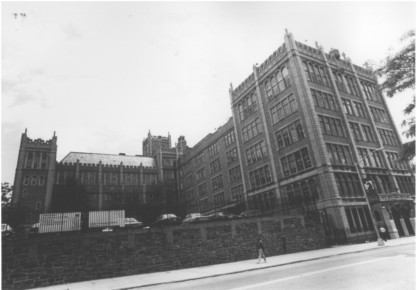
New York Training School for Teachers/New York Model School Courtyard facades