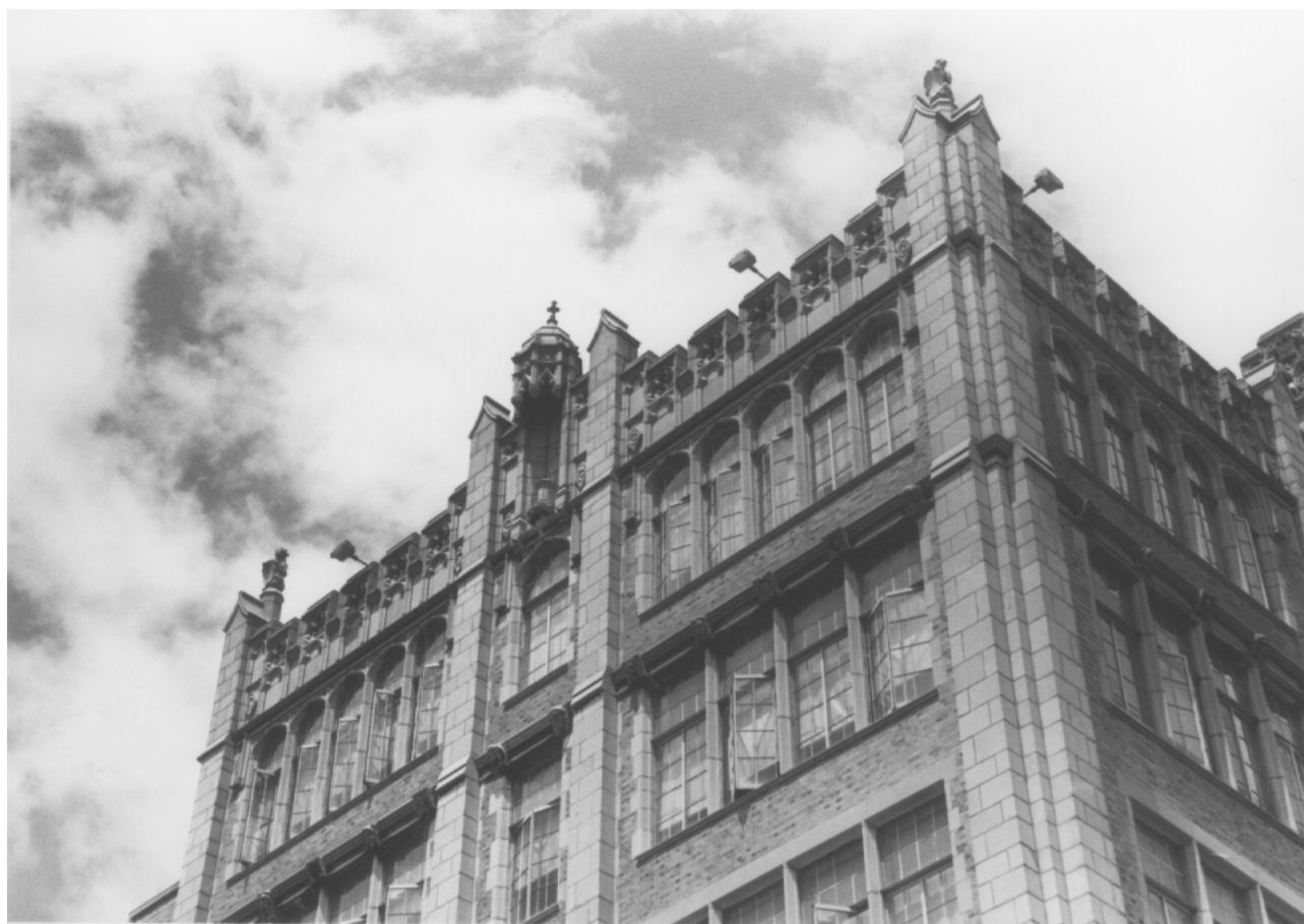
New York Training School for Teachers/New York Model School, details of upper portion of building