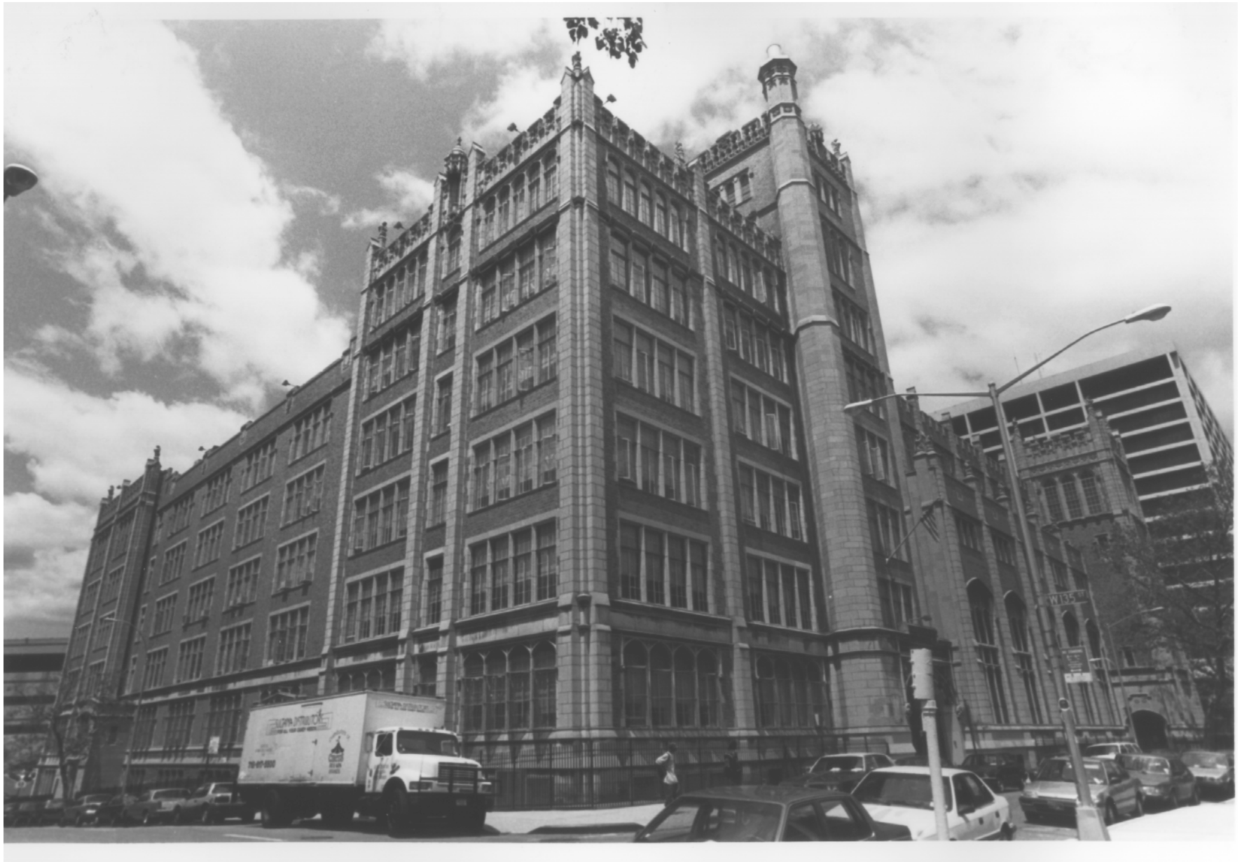
New York Training School for Teachers/New York Model School West 135th Street and St. Nicholas Terrace facades