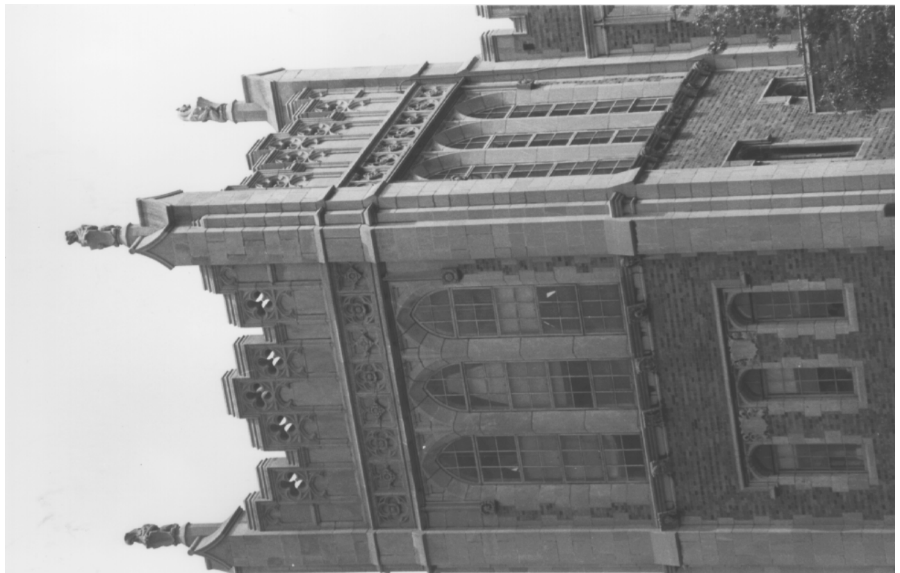
New York Training School for Teachers/New York Model School, tower details