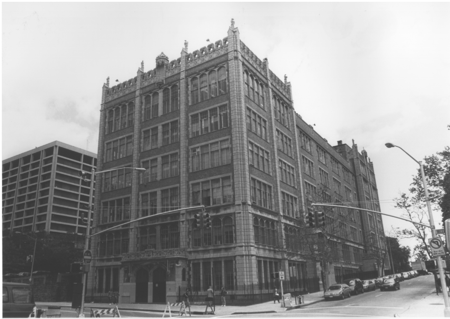
New York Training School for Teachers/New York Model School Convent Avenue and West 135th Street facades