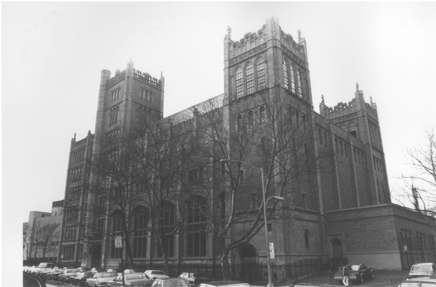
New York Training School for Teachers/New York Model School St. Nicholas Terrace and north end facades