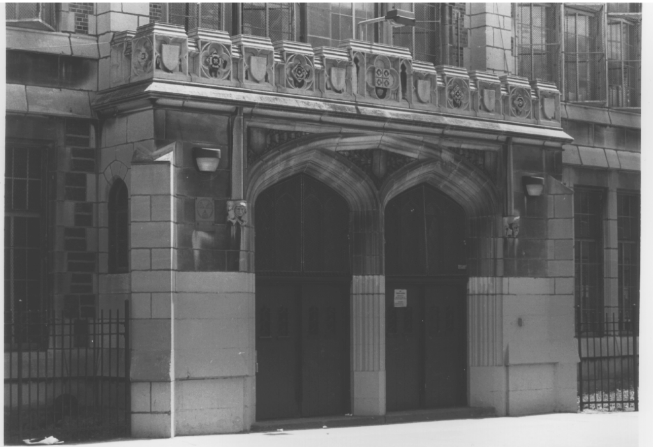
New York Training School for Teachers/New York Model School St. Nicholas Terrace (upper) and Convent Avenue (lower) entrances