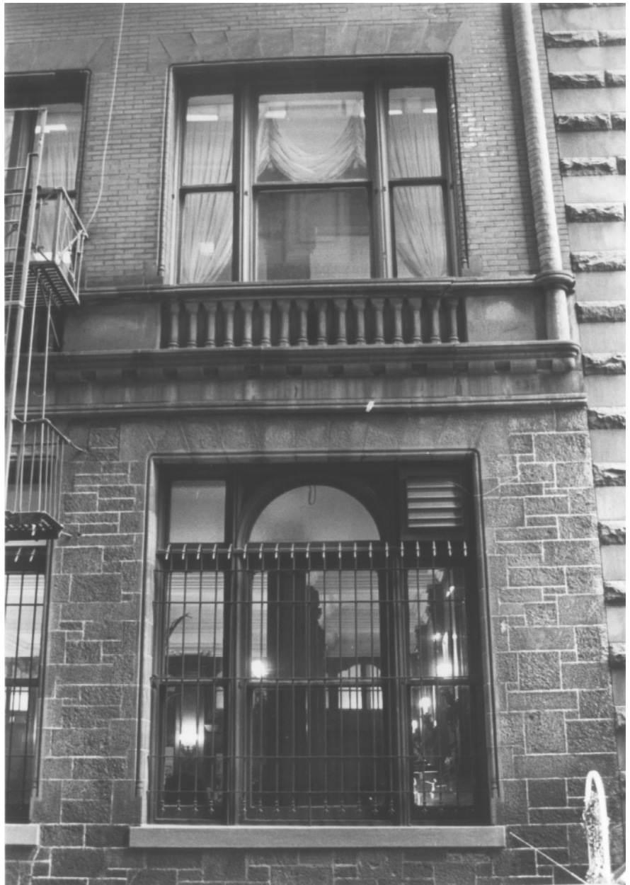
The Down Town Association Building, window details, Cedar Street facade