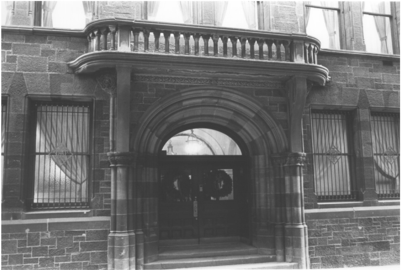
The Down Town Association Building, main entrance, Pine Street facade