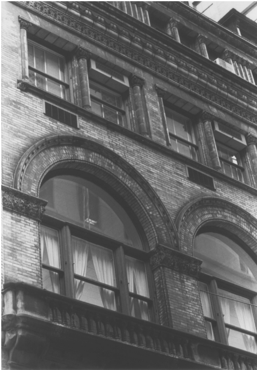
The Down Town Association Building, window details, Pine Street facade