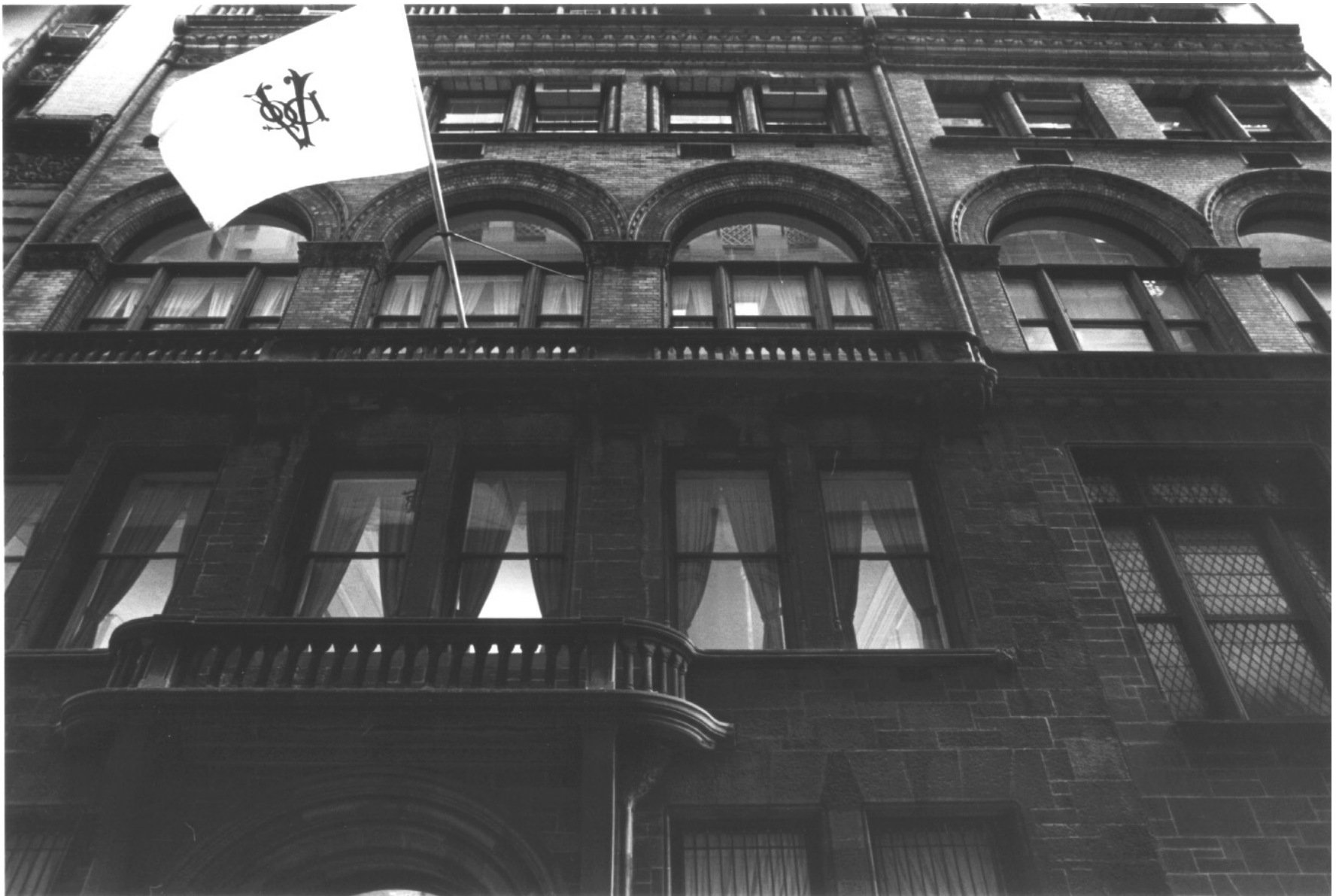
The Down Town Association Building, Pine Street facade