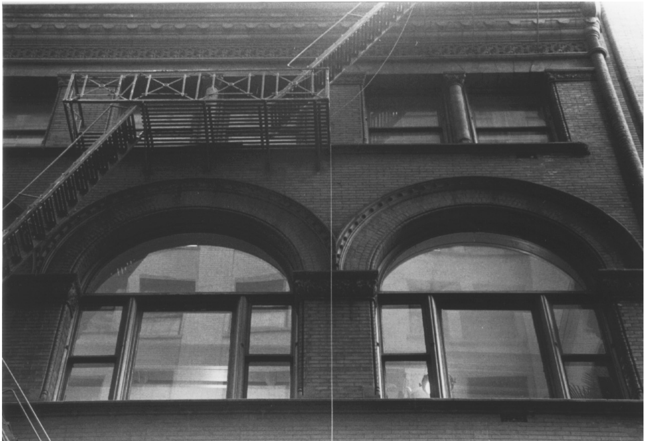
The Down Town Association Building, window detail, Cedar Street facade