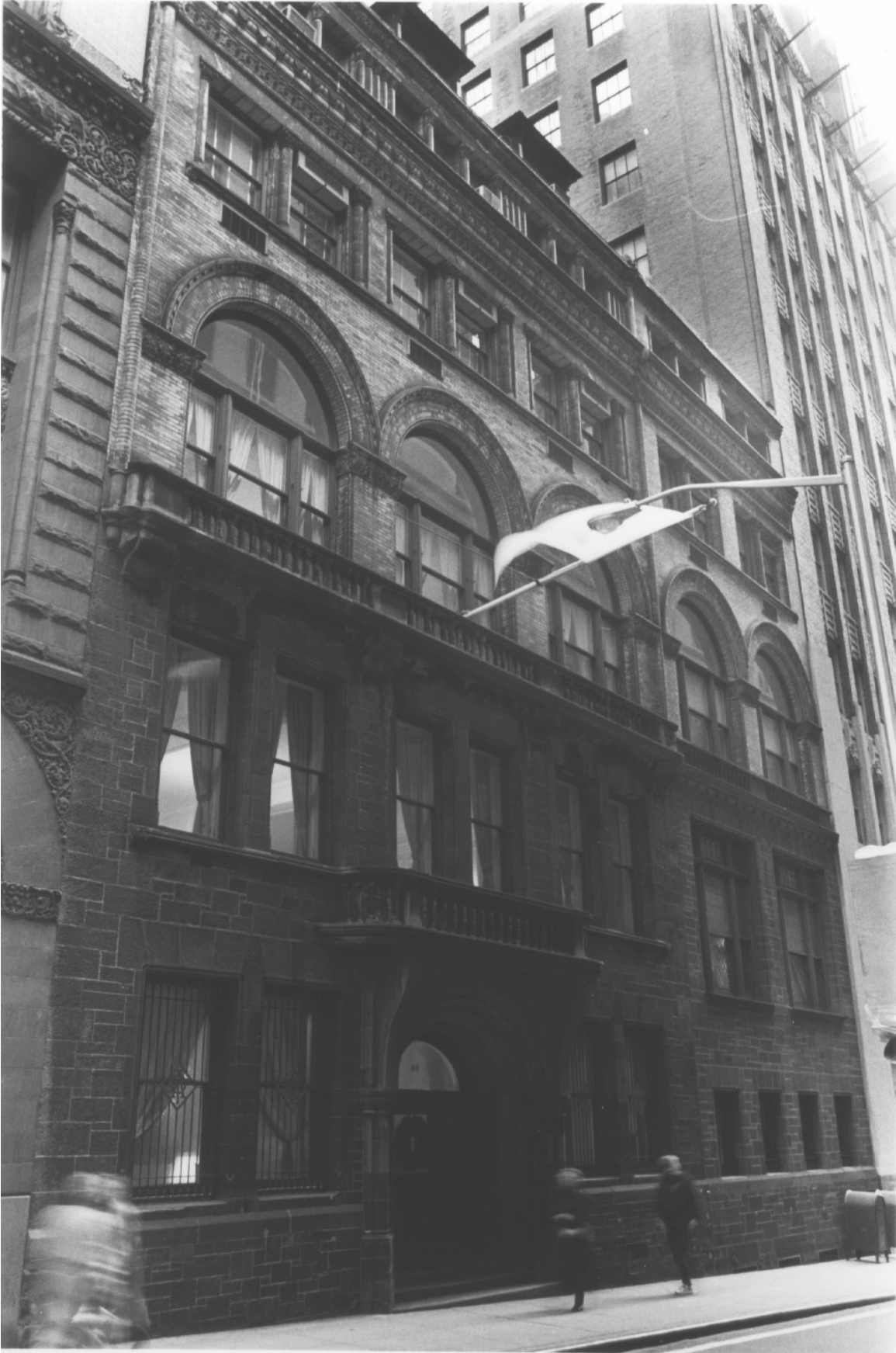
The Down Town Association Building, Pine Street facade