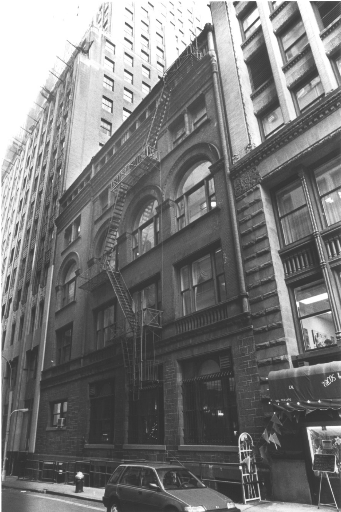
The Downtown Association Building, Cedar Street facade