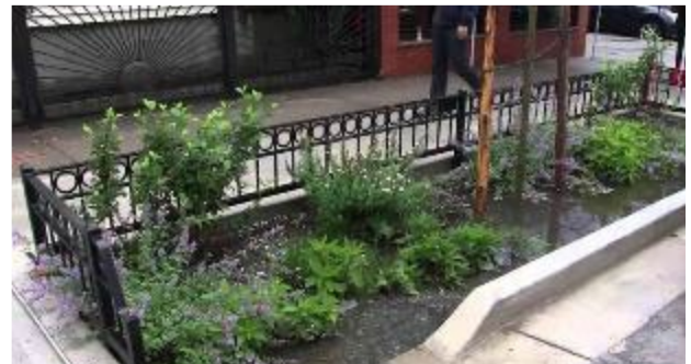
Curbside Rain Garden (Bioswale)

DEP has initially focused primarily on the Area-wide right-of-way contracts building curbside rain gardens, infiltration basins, Stormwater Greenstreets, and porous paving. DEP's standardized designs and procedures have been critical to supporting the systematic implementation of green infrastructure at a wide scale. DEP expects to continue green infrastructure implementation using an expanded array of tools. While right-of-way implementation has been the greatest focus of the first decade of the Program, DEP is making significant advancements into other implementation areas as well,