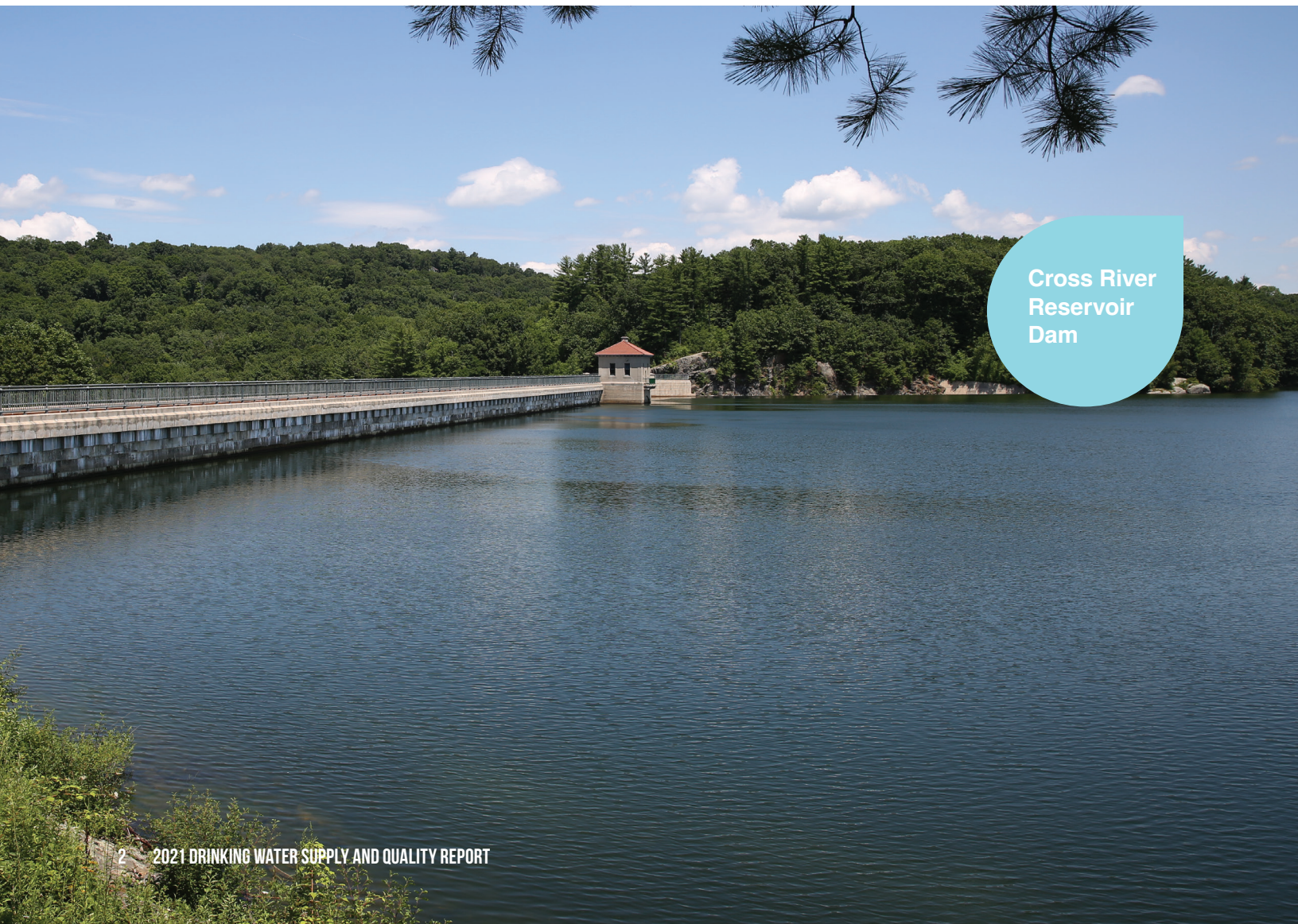
Cross River Reservoir Dam

In 2021, New York City received a blend of drinking water from the Catskill/Delaware and Croton supplies. The Catskill/Delaware provided approximately 88 percent of the water, and approximately 12 percent was supplied by Croton. An estimated 5 percent of the water supply was lost, used for firefighting, at hydrants, from leaks, main breaks and unauthorized uses.