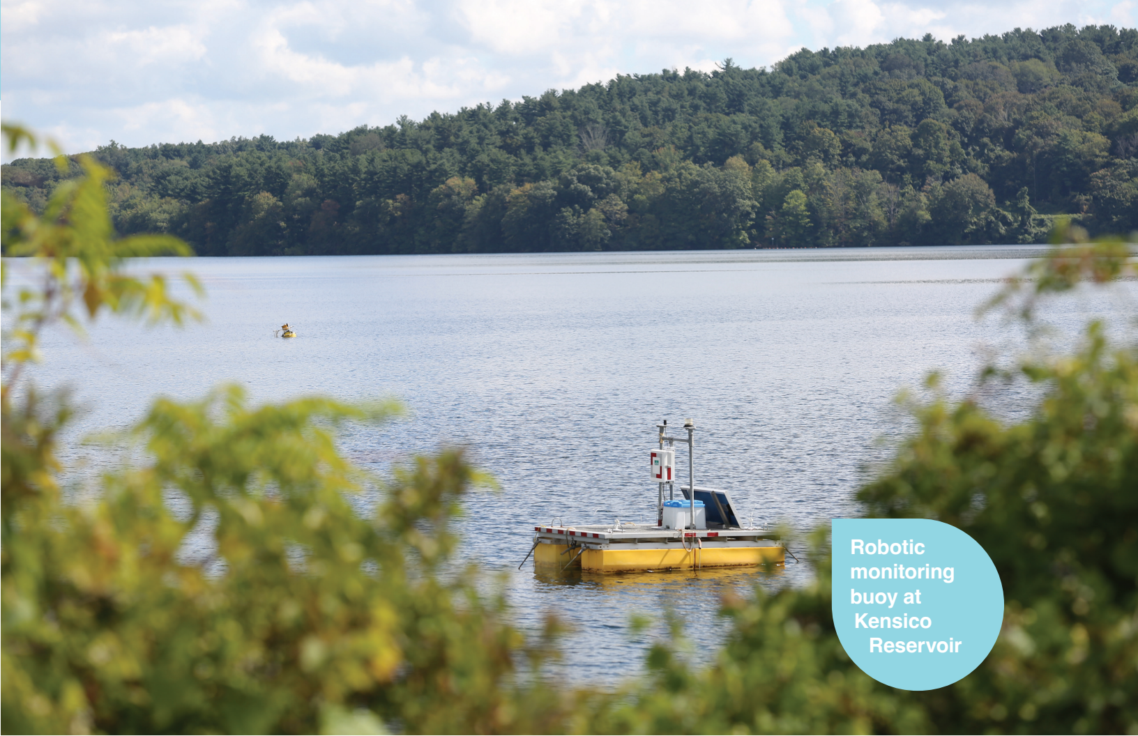
Robotic monitoring buoy at Kensico Reservoir