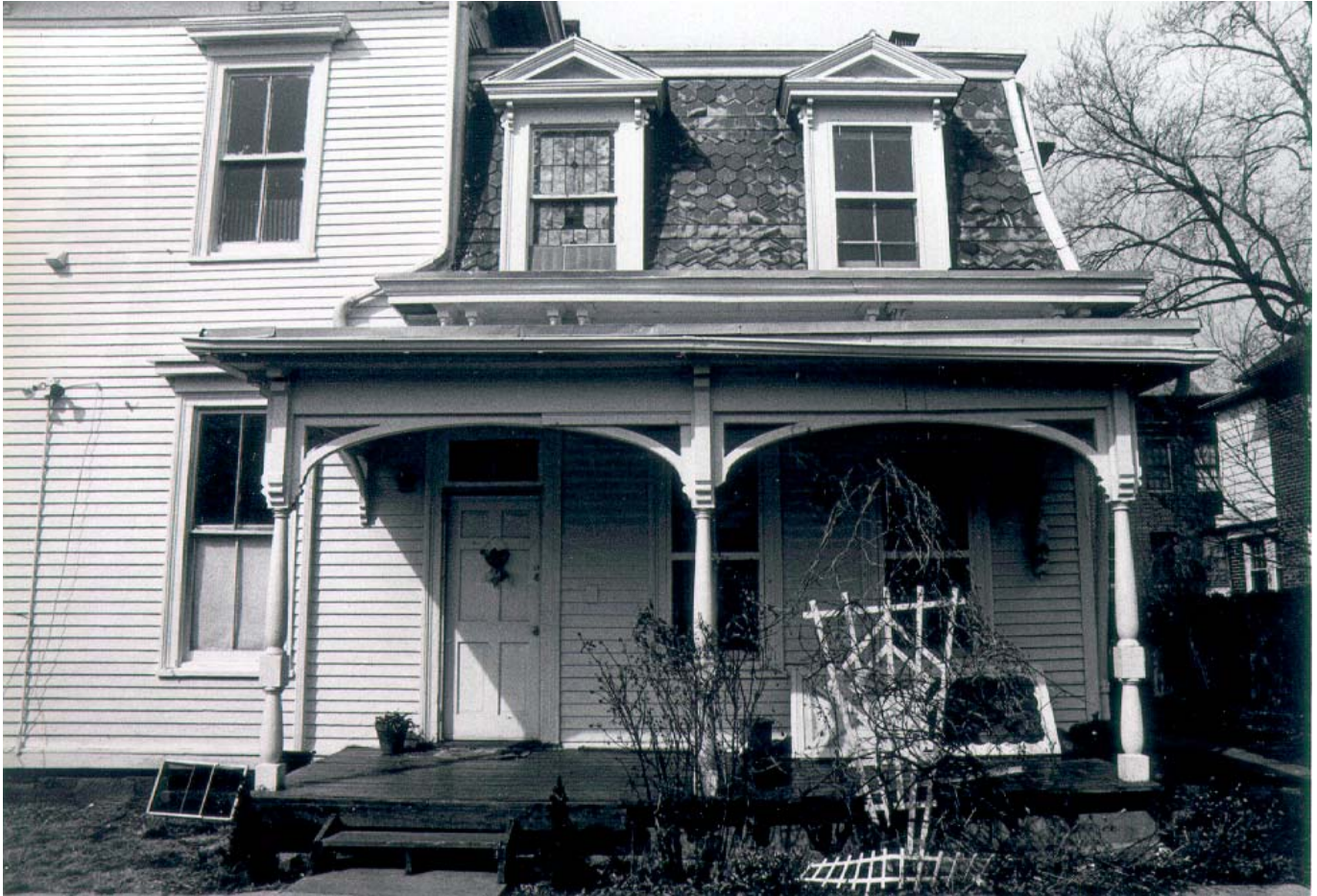
Kitchen wing, south façade