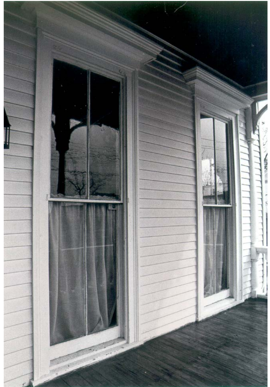
Details of the front porch and first story windows