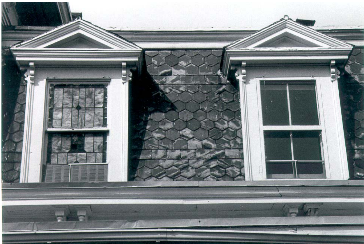
Top: Detail of the second story windows and mansard roof on the primary façade Bottom: Detail of the dormer windows on the south façade of the kitchen wing