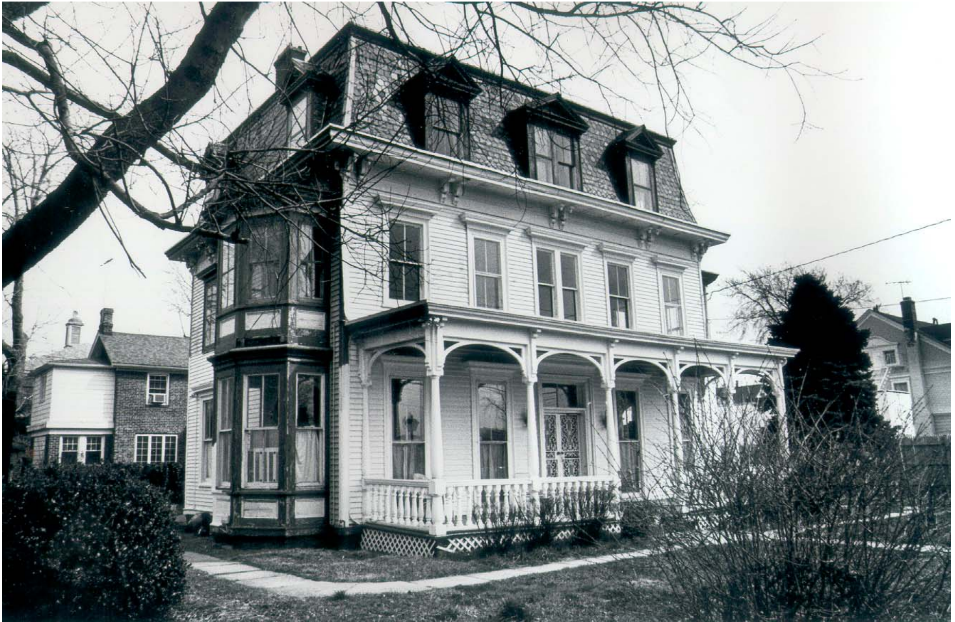
Samuel Pell House, 586 City Island Avenue, Bronx View from the northwest