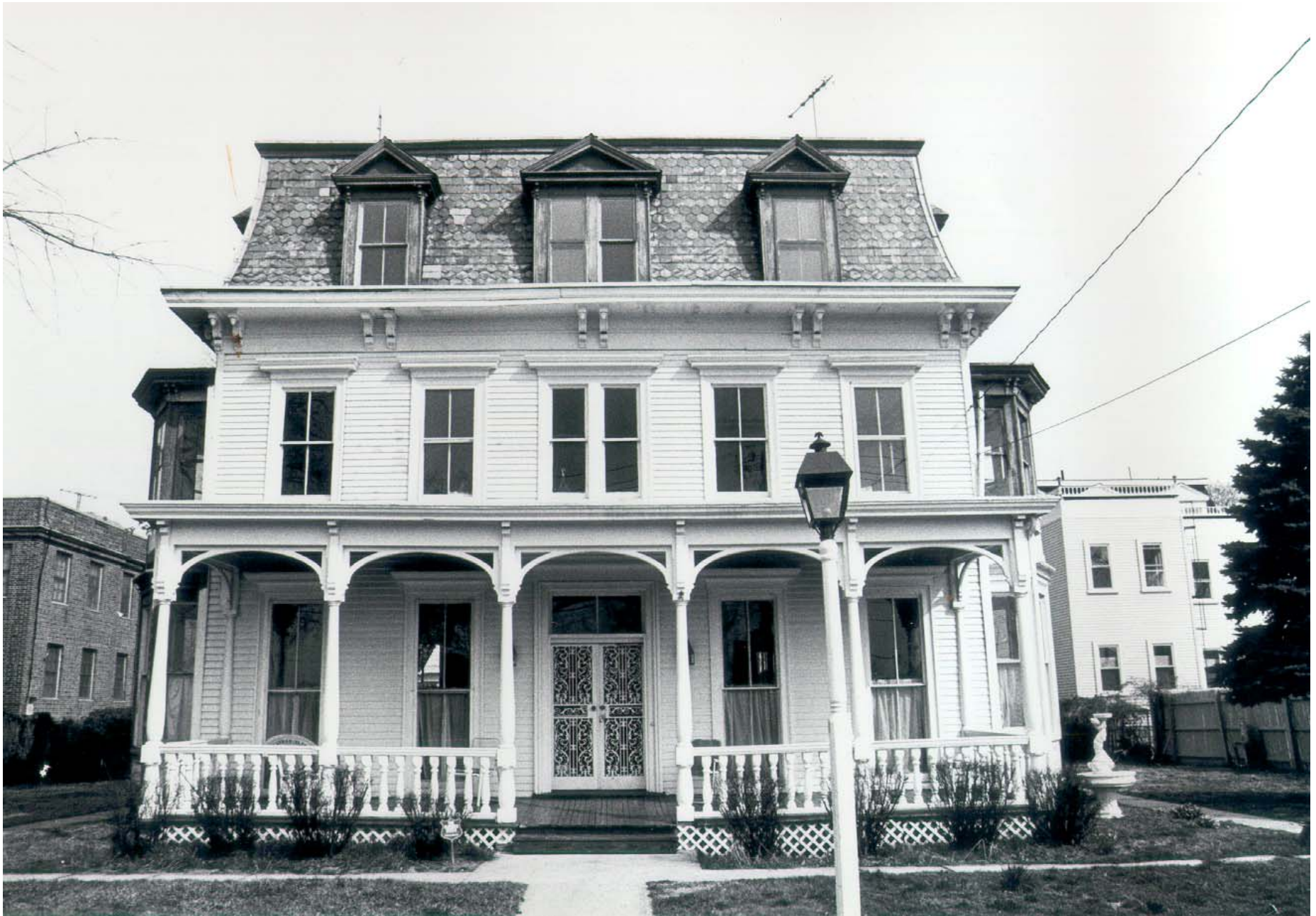
Samuel Pell House, 586 City Island Avenue, Bronx