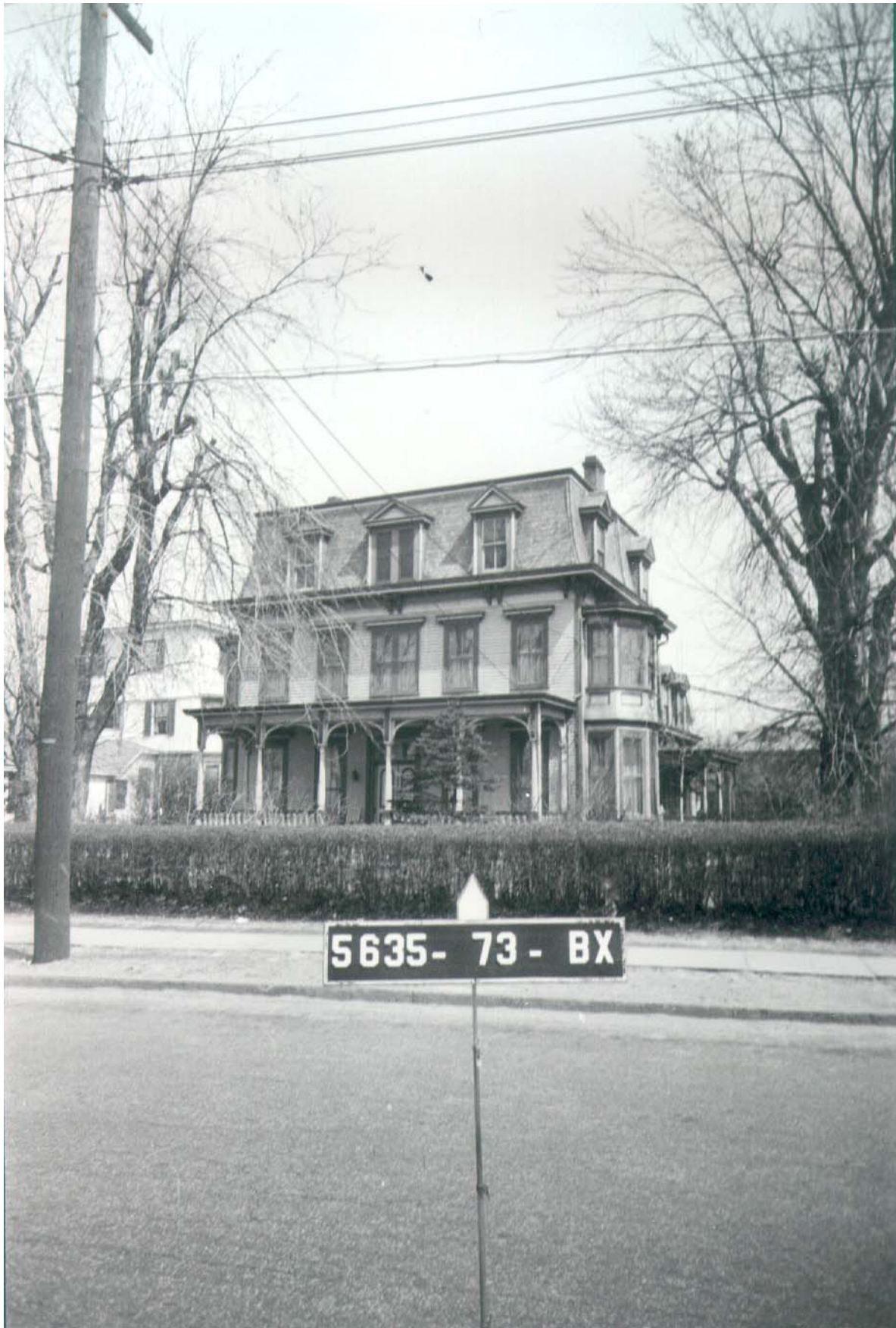
"Tax" Department Photograph, c. 1940