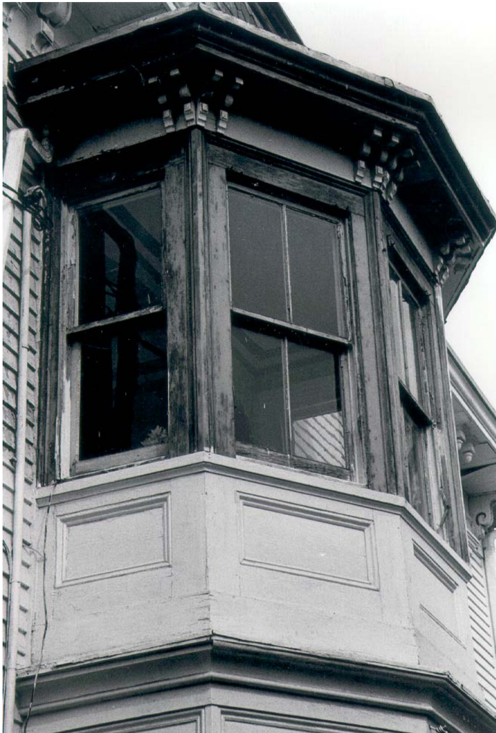
Detail of the second story bay window on the north façade