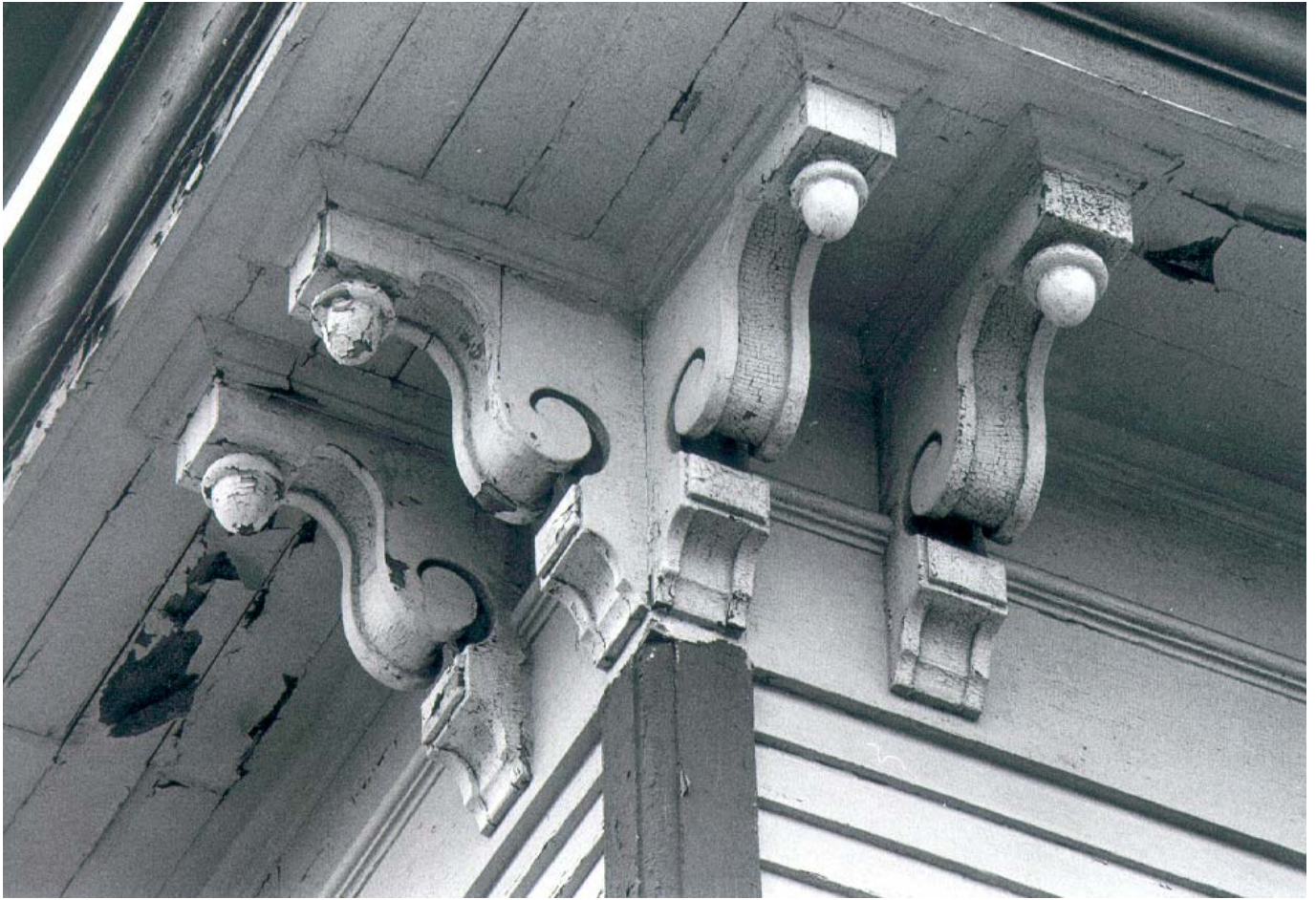
Detail of the bracketed eaves on the main portion of the house