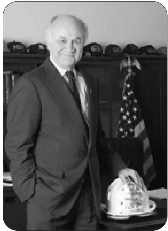
Nicholas Scoppetta Commissioner