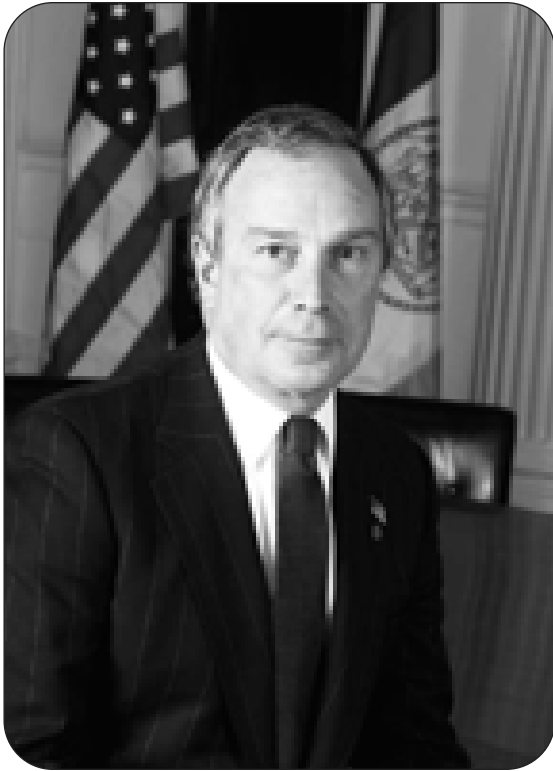
Michael R. Bloomberg Mayor

The annual EMS Medal Day is an occasion to recognize the EMTs and Paramedics of the FDNY's Emergency Medical Service who have distinguished themselves in a demanding job. The honorees and their families should be proud of the superb patient care they delivered and heroic actions they embodied.