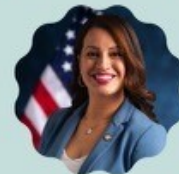
ASAMBLEÍSTA CATALINA CRUZ