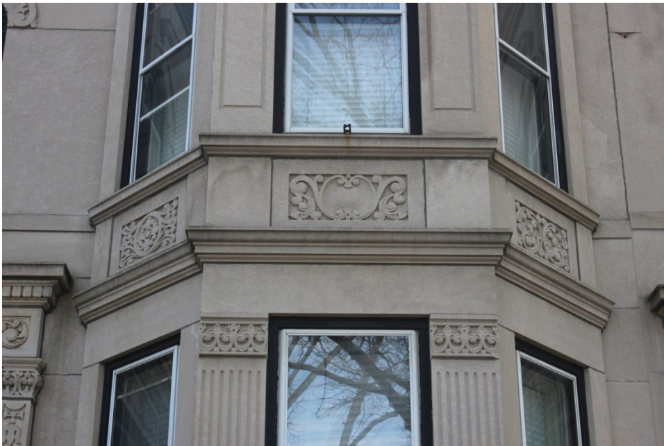
Figures 9 (top) and 10 (bottom): Elaborate stone entrance enframement and projecting bay details, 434 Bay Ridge Parkway