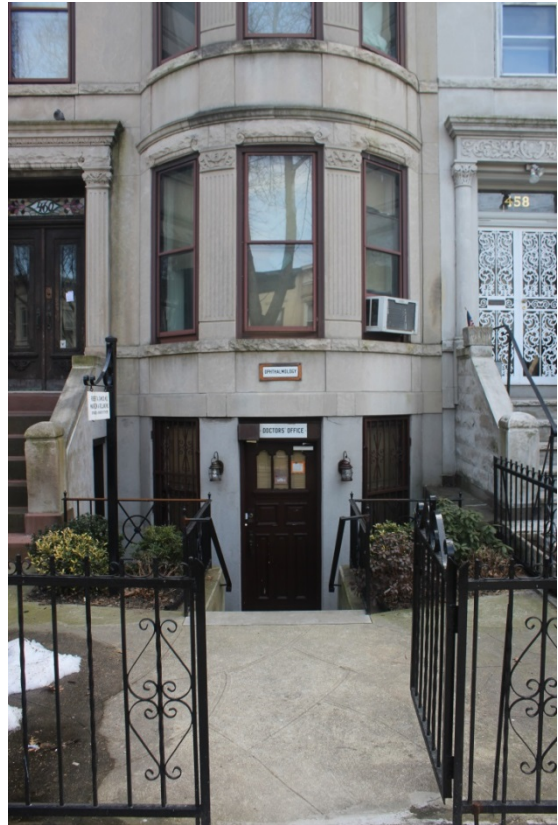
Figure 3 (right): Doctor's office basement entrance at 460 Bay Ridge Parkway MaryNell Nolan-Wheatley, March 2019