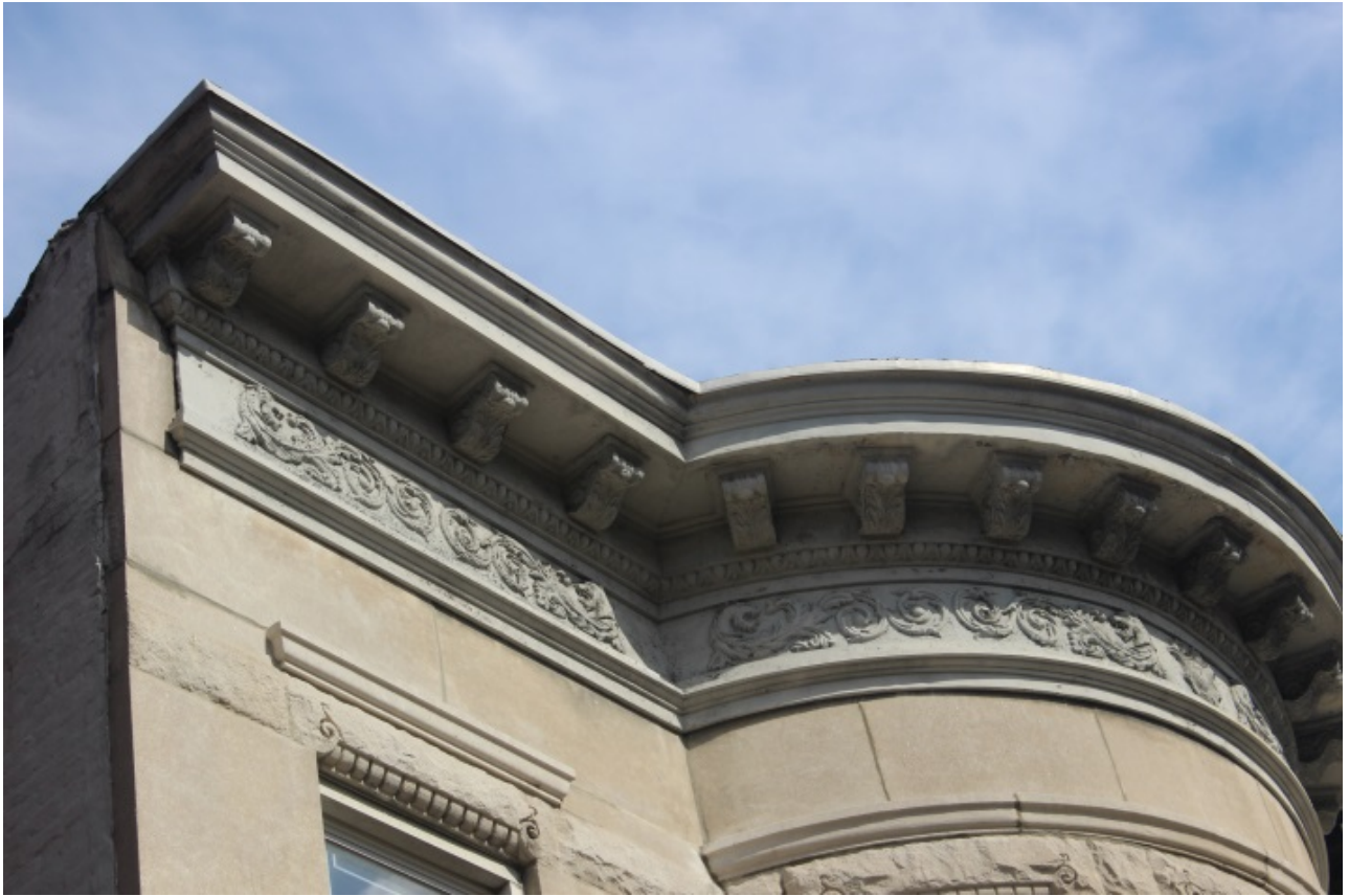
Figure 7: Renaissance Revival cornice at 415 Bay Ridge Parkway MaryNell Nolan-Wheatley, March 2019