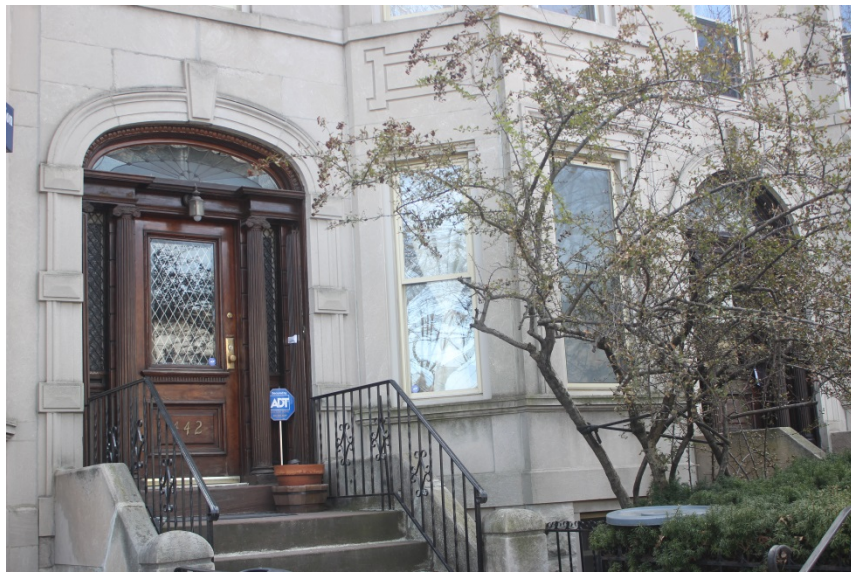
Figure 12: "House Colonial" entrance at 442 Bay Ridge Parkway MaryNell Nolan-Wheatley, March 2019