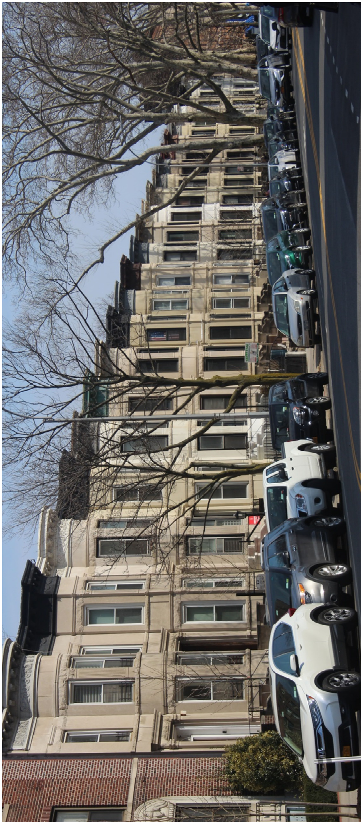
Figure 8: North side of Bay Ridge Parkway MaryNeil Nolan-Wheatley, March 2019