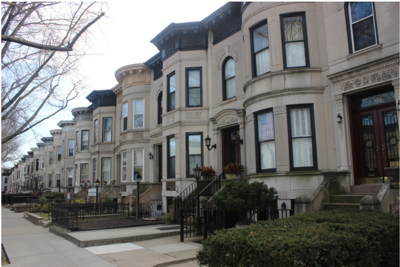
Figure 6 (bottom): South side of Bay Ridge Parkway MaryNell Nolan-Wheatley, March 2019