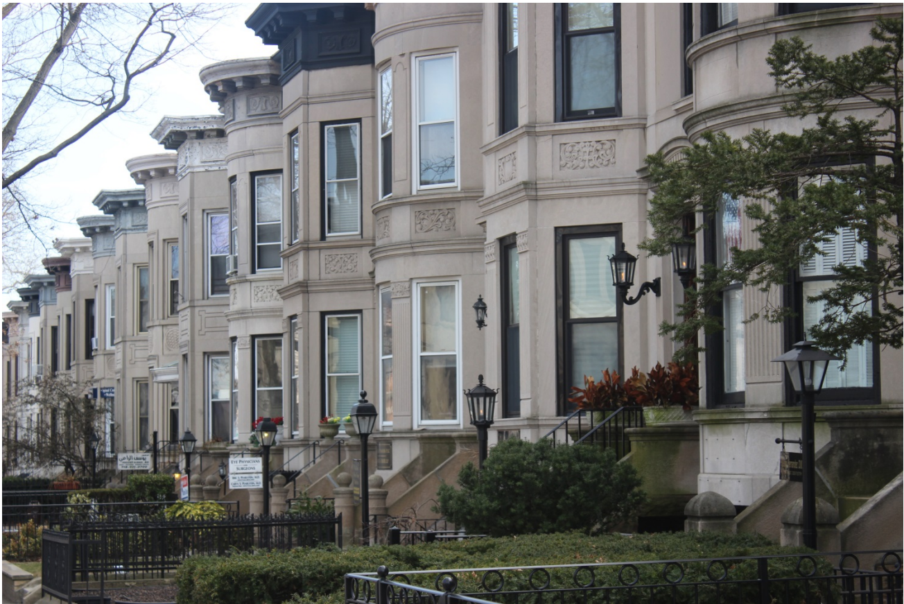
Figure 1: South side of Bay Ridge Parkway (previous page, north side of Bay Ridge Parkway)