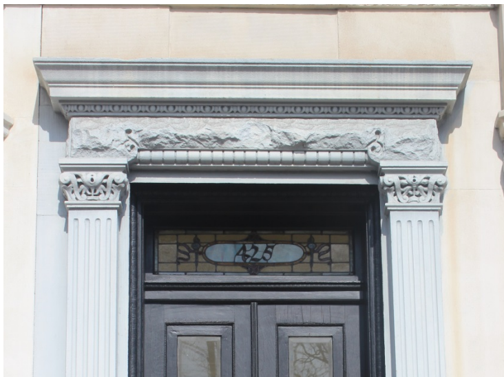
Figure 2: Stained glass transom, 425 Bay Ridge Parkway