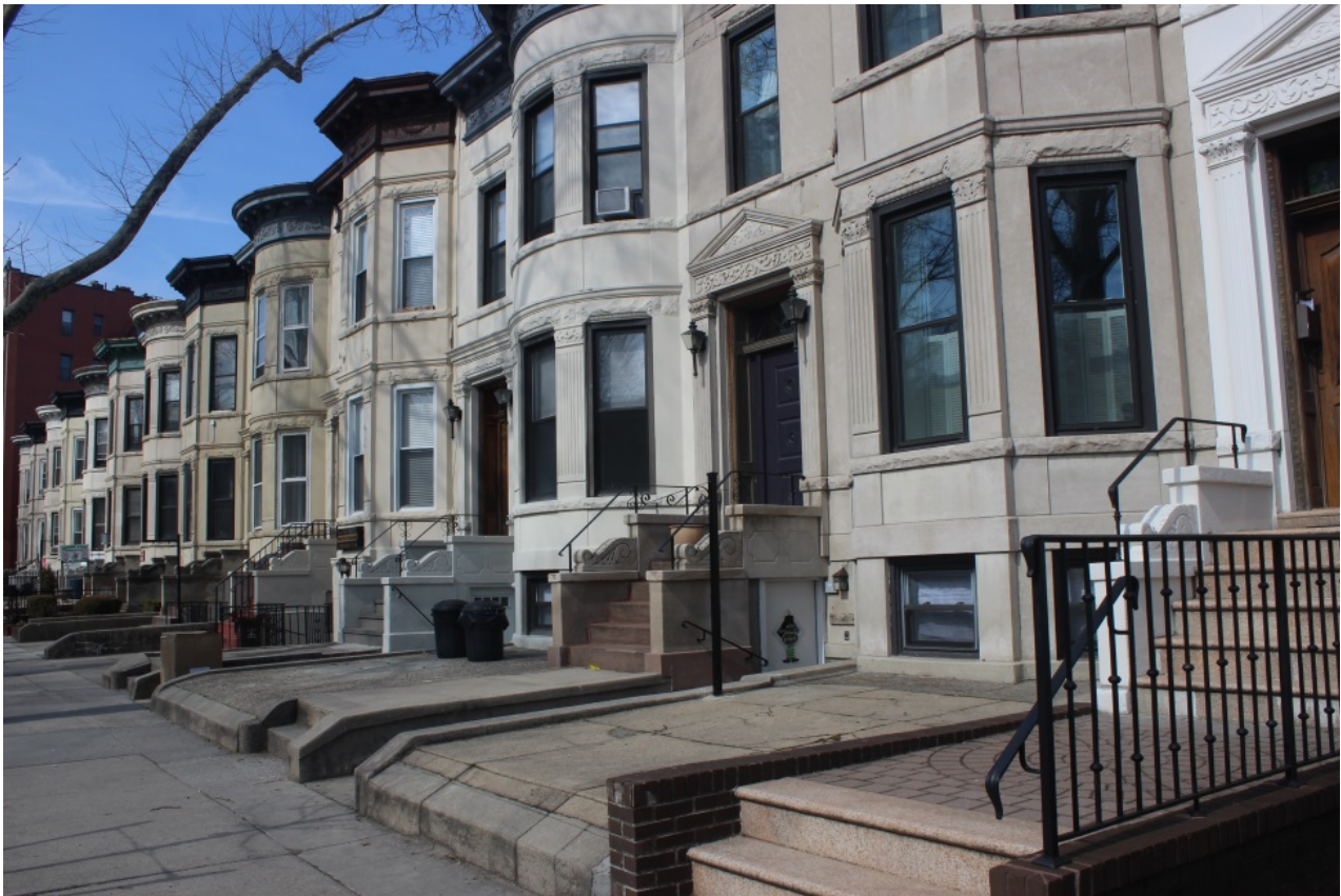
Figure 4 (bottom): North side of Bay Ridge Parkway MaryNell Nolan-Wheatley, March 2019