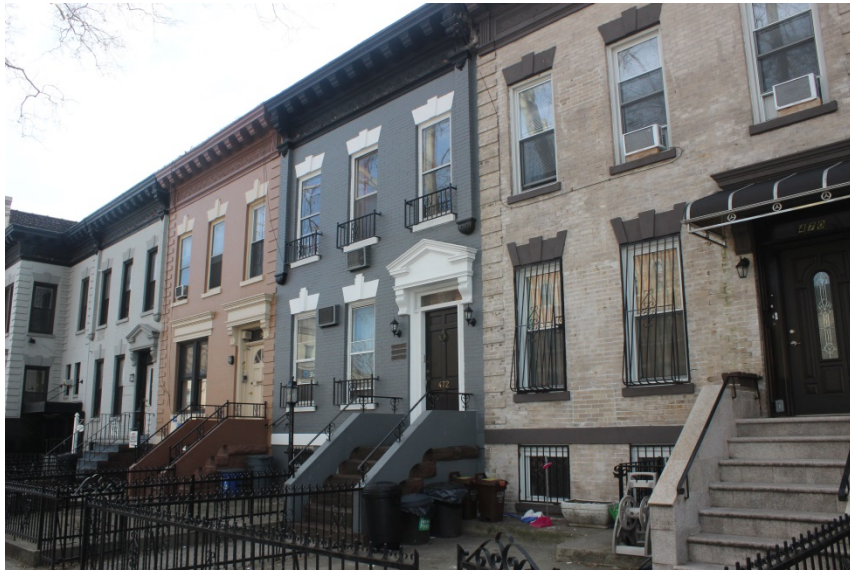
Figure 11: Brick houses developed by Malcolm C. Ludlam, 470-478 Bay Ridge Parkway MaryNell Nolan-Wheatley, March 2019