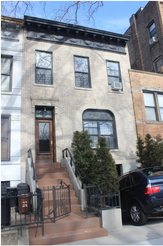
Figure 5 (left): Purpose-built doctor's office at 475 Bay Ridge Parkway MaryNell Nolan-Wheatley, March 2019