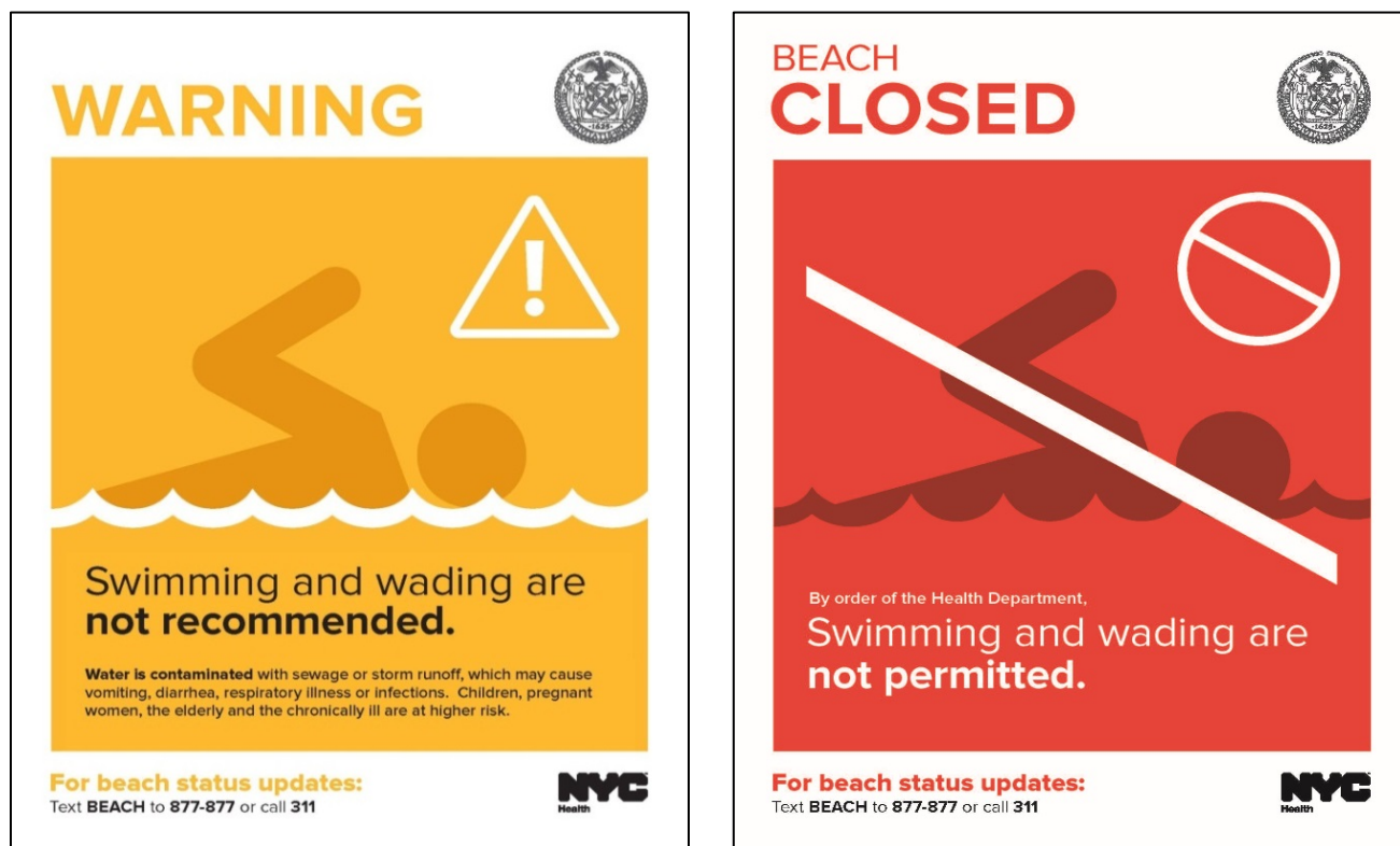
FIGURE 2: BEACH WARNING AND CLOSED SIGNS

The Department continued public notification and risk communication during the beach season, using easy-to-interpret signs shown in Figure 2 for beach closures and warnings in 2021.