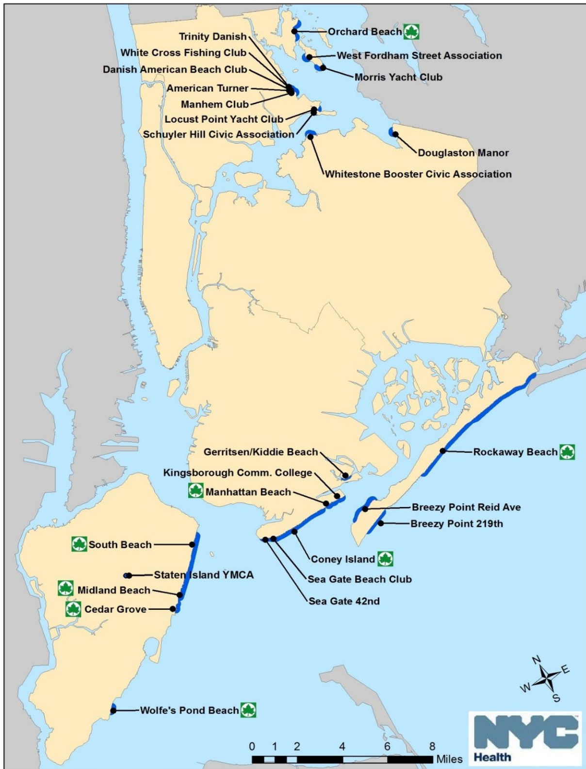
FIGURE 1: NEW YORK CITY PERMITTED BEACHES