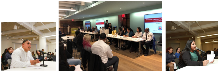
Members listen to a presentation and the public provides testimony at annual ICC public hearing

More than 100 individuals attended, many of whom were young people who offered testimony on issues ranging from transportation concerns and disparity of resources among school districts to standardized testing issues and LGBTQ and disconnected youth in NYC.