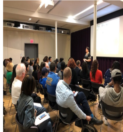
ICC members participate in the annual ICC LGBTQ Competency training at The Center

In conjunction with The LGBT Center, the ICC offered its members and City employees a comprehensive LGBTQ Cultural Competency Training entitled “ Trauma Among Lesbian, Gay, Bisexual, Transgender, and Questioning Youth ” during Pride Month (June) 2018. Representatives of the New York Police Department, Department of Health and Mental Hygiene, Mayor’s Office to End Domestic and Gender-Based Violence, and a host of DYCD-funded Runaway and Homeless Youth providers participated. The training is designed to familiarize City employees with the trauma experiences of the LGBTQ community.