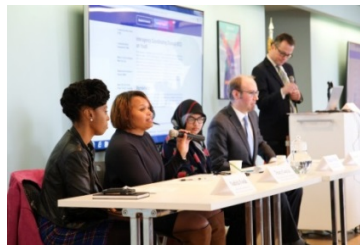
Panel members highlight the topic of mentoring at ICC membership meeting

The ICC held a membership meeting at DYCD on April 24, 2018. Attendees were on hand to hear a panel discussion on mentoring, and walked away with a better understanding of opportunities for mentoring, its impact on youth development, and the need to expose youth to these types of resources.