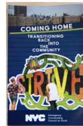
“Coming Home: Transitioning Back into the Community”