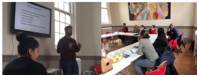
ICC members receive a training facilitated by the AVP and learn about the LGBT Center