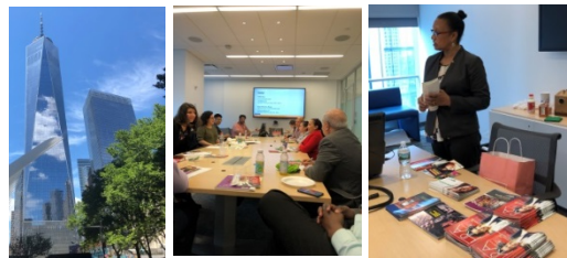
HRA hosted the Court-Involved Youth Work Group at World Trade Center 4