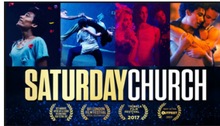
“Saturday Church” film screening