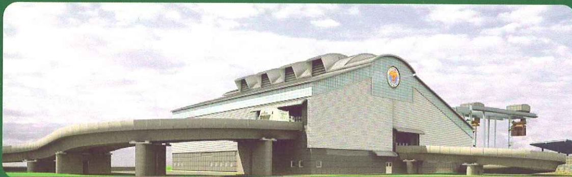
Water Side View