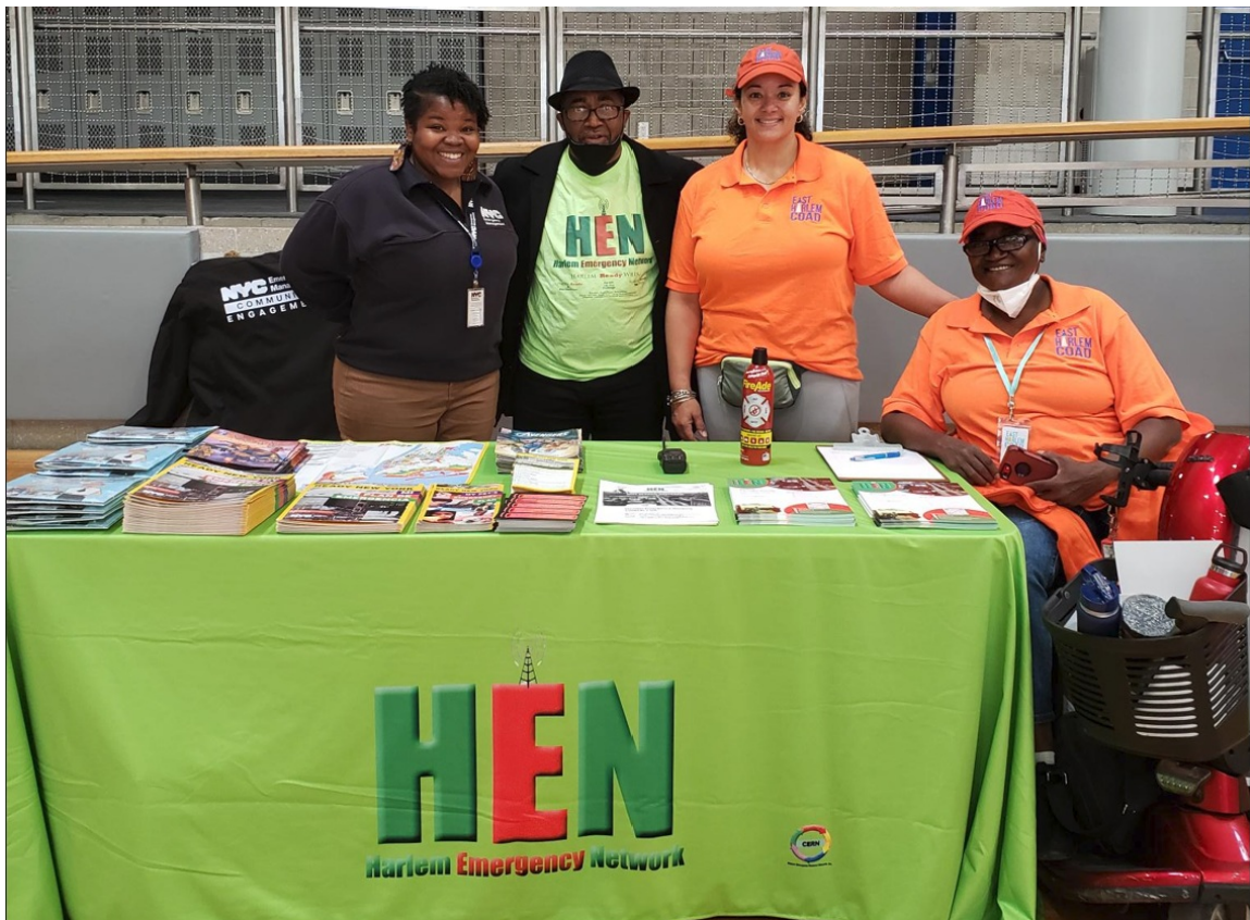
Emergency preparedness tabling event with one of our community networks, Harlem Emergency Network.