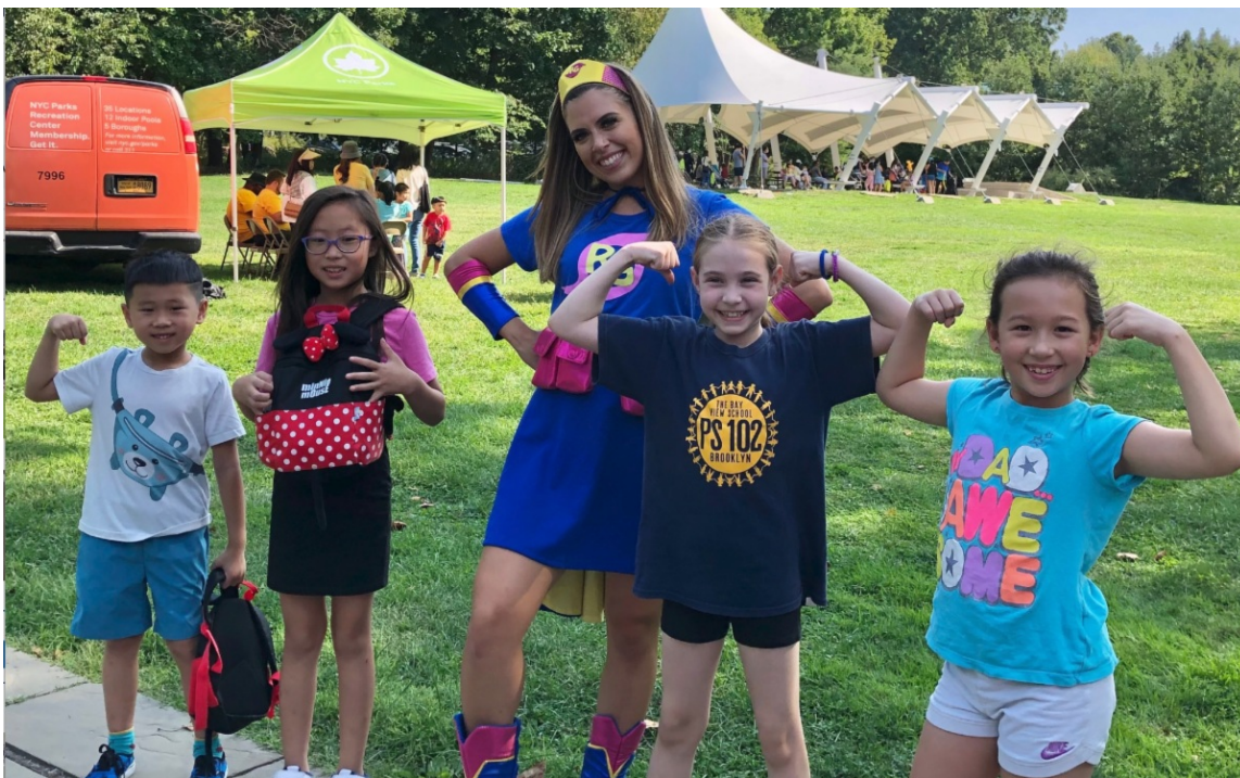
Emergency Preparedness Day at the Staten Island Children's Museum with Ready Girl.