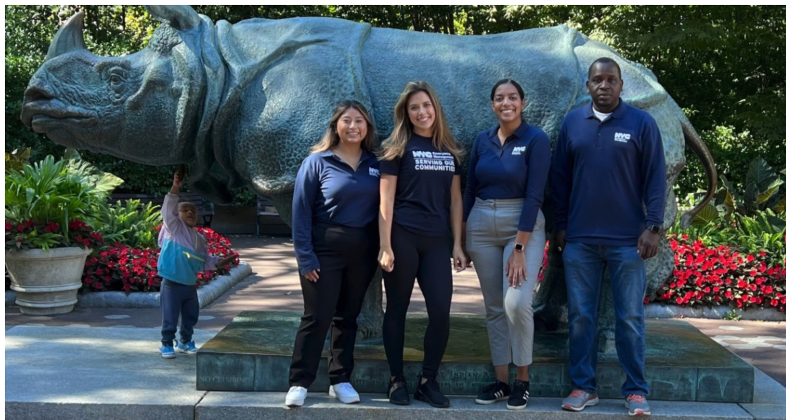
Family Day at the Bronx Zoo