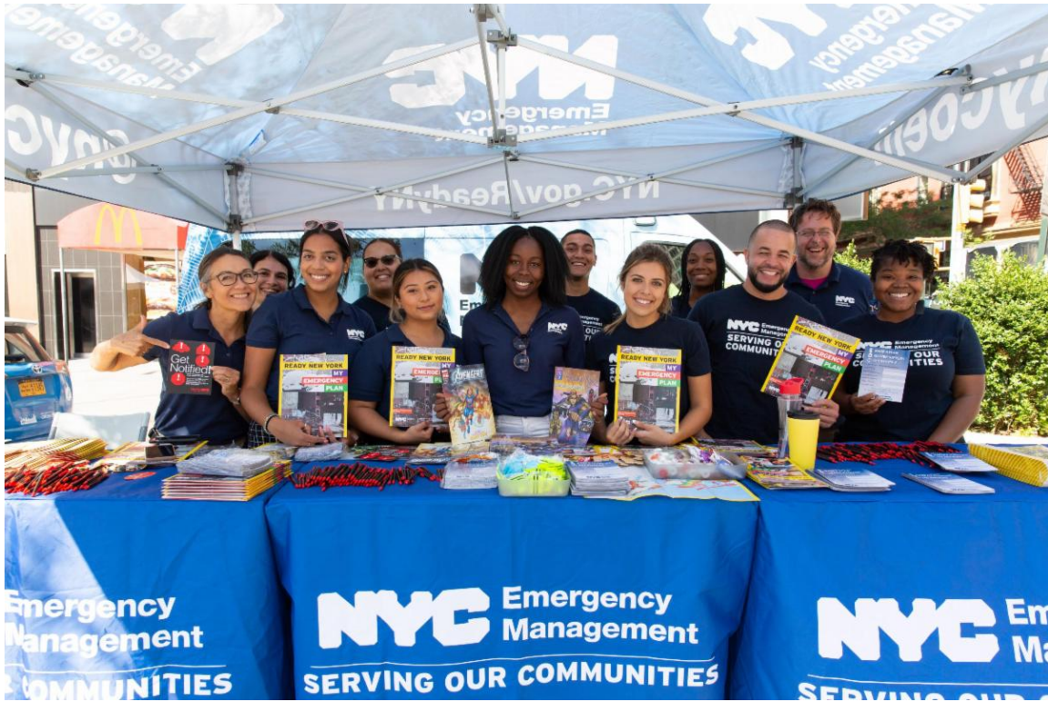
Pets and Service Animal Preparedness Fair at Union Square Park.