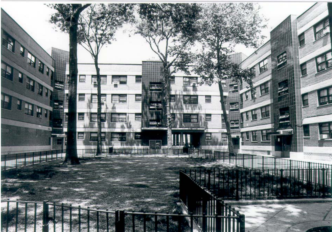
Williamsburg Houses Interior court: Ten Eyck Walk, near Leonard Street (Building No. 1)