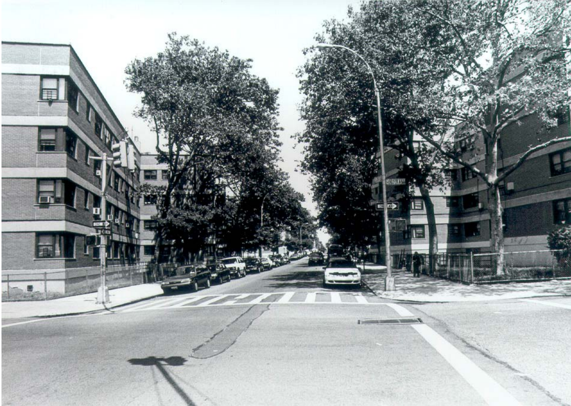
Williamsburg Houses Intersection of Humboldt Street and Scholes Street, looking north