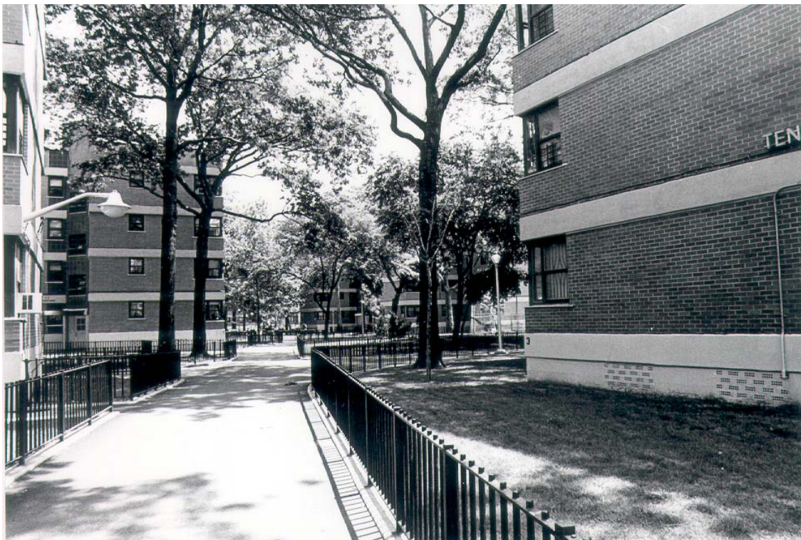
Williamsburg Houses Ten Eyck Walk, looking east