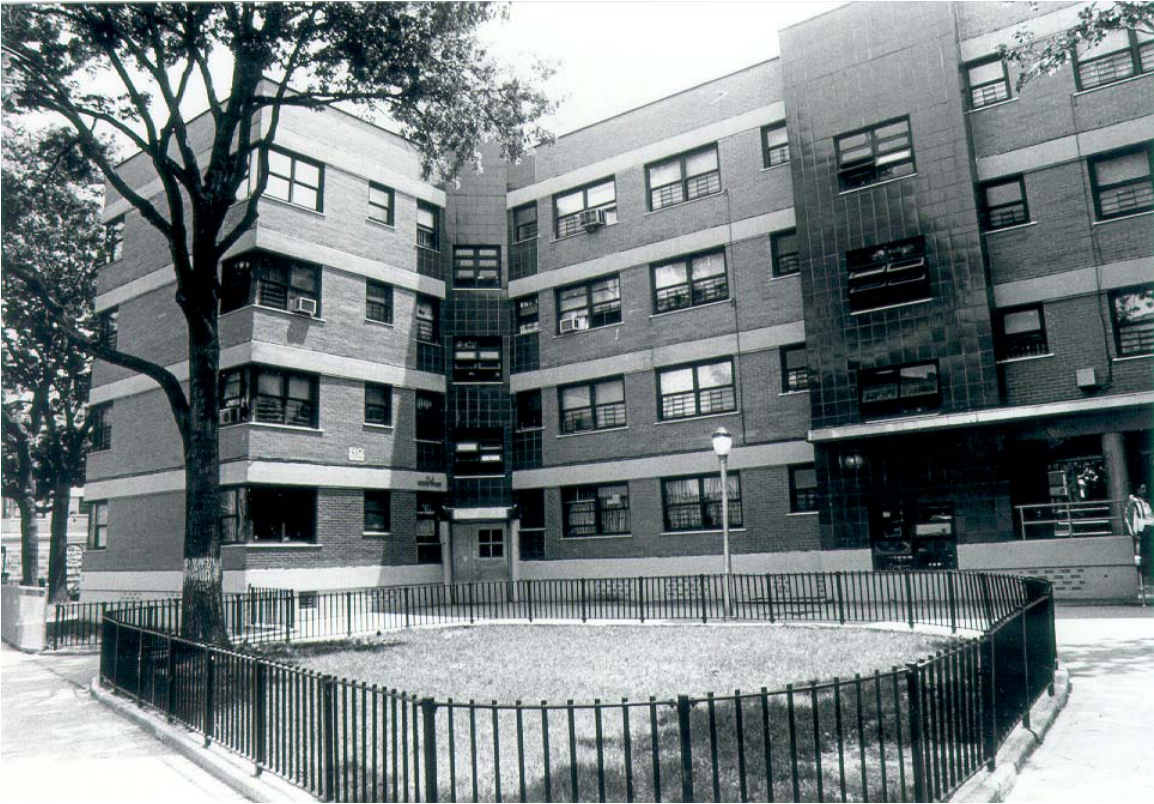
Willamsburg Houses Maujer Street, near Manhattan Avenue (Building No. 2)