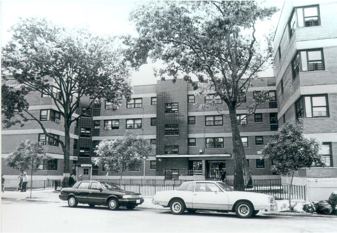
Williamsburg Houses Maujer Street, near Manhattan Avenue (Building No. 2)