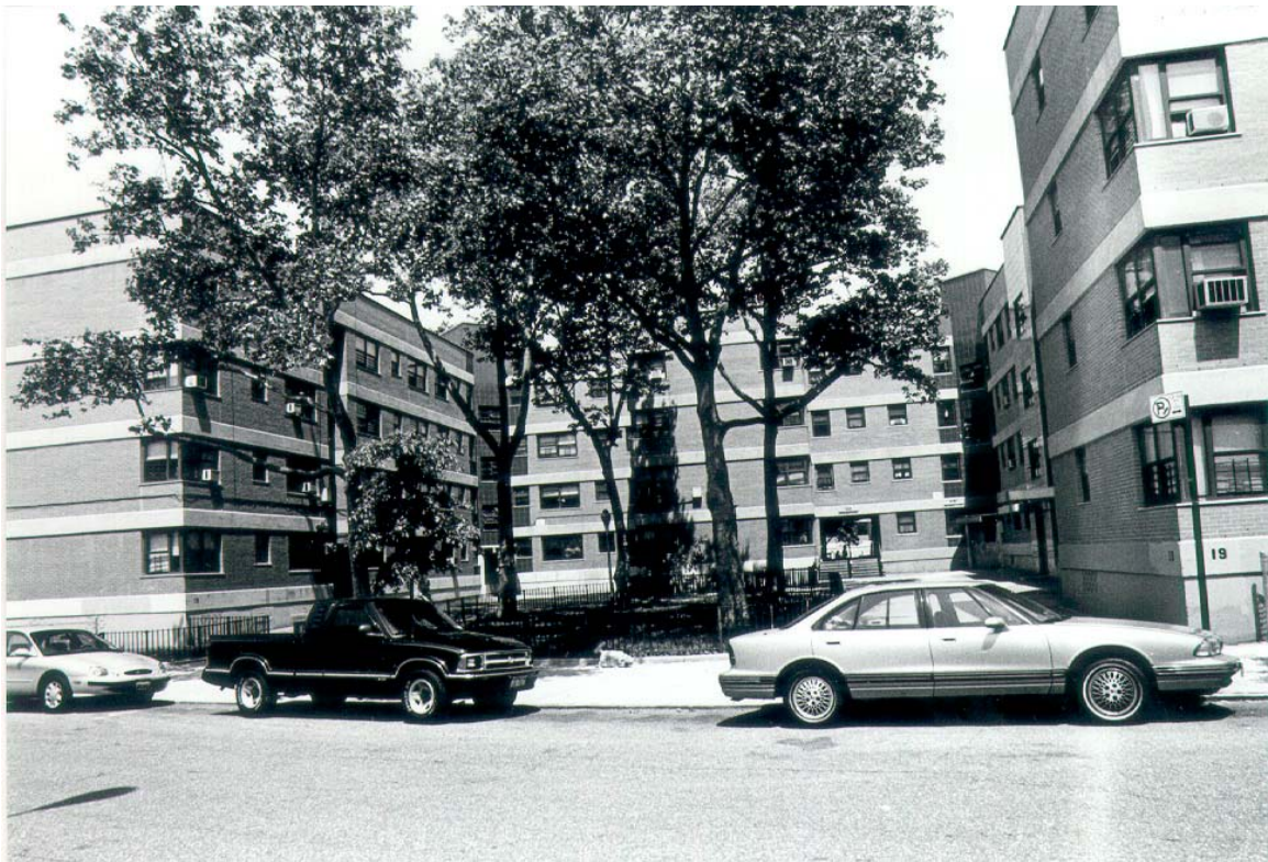
Williamsburg Houses Scholes Street, near Humbolt Street (Building No. 19)