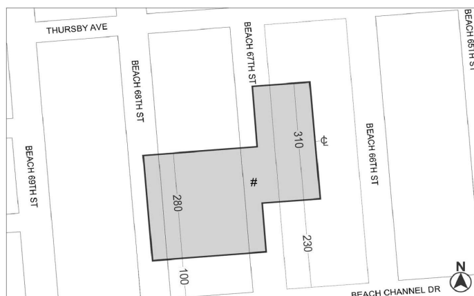
Mandatory Inclusionary Housing Area see Section 23-154(d)(3) Area # — [date of adoption] — MIH Program Option 1 and Option 2

Portion of Community District 14, Queens