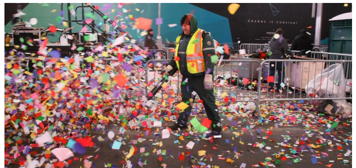
Times Square cleanup; Welcome 2015!

Congratulations to Brooklyn North , Brooklyn South and the Bronx for surpassing the goal of 10 percent reduction in chargeable accidents for the second quarter of 2014. Overall, the department saw chargeable accidents drop 8.6 percent from the same period last year.