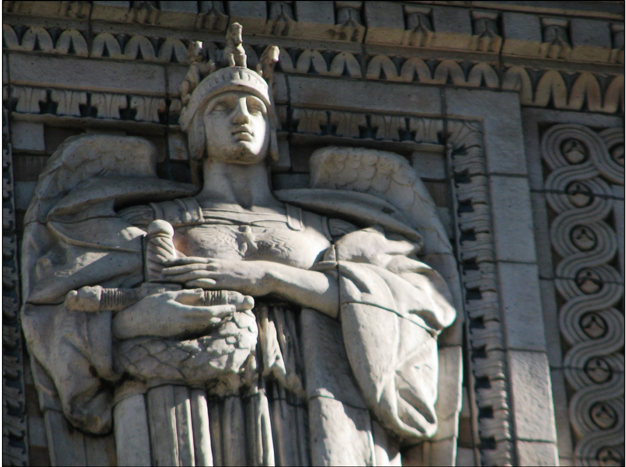
Allegorical figure, Park Avenue facade Photo: Gale Harris, April 2015