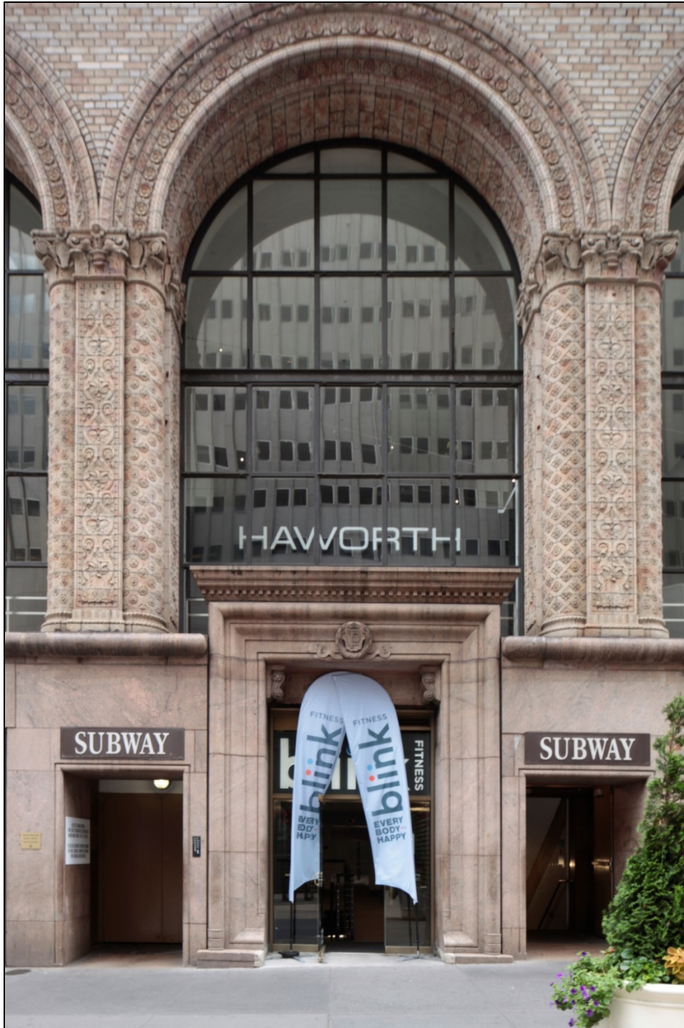
Former Park Avenue entry and subway entrances