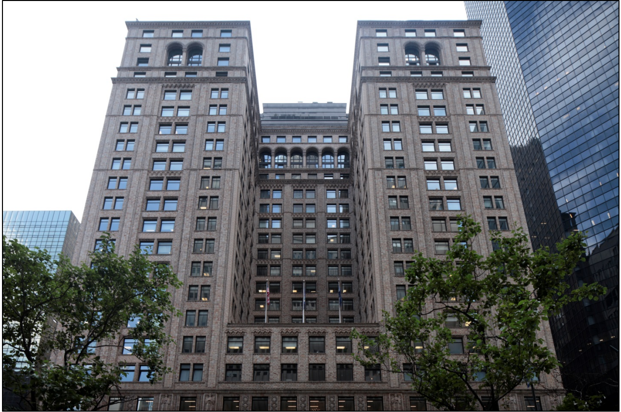
Park Avenue light court Photo: Sarah Moses, June 2016