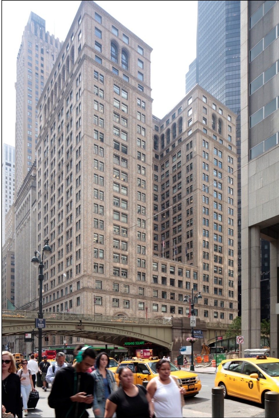
Pershing Square Building 125 Park Avenue (aka 101-105 East 41 st Street, 100-108 East 42 nd Street, 117-123 Park Avenue, 127-131 Park Avenue), Manhattan June 2016