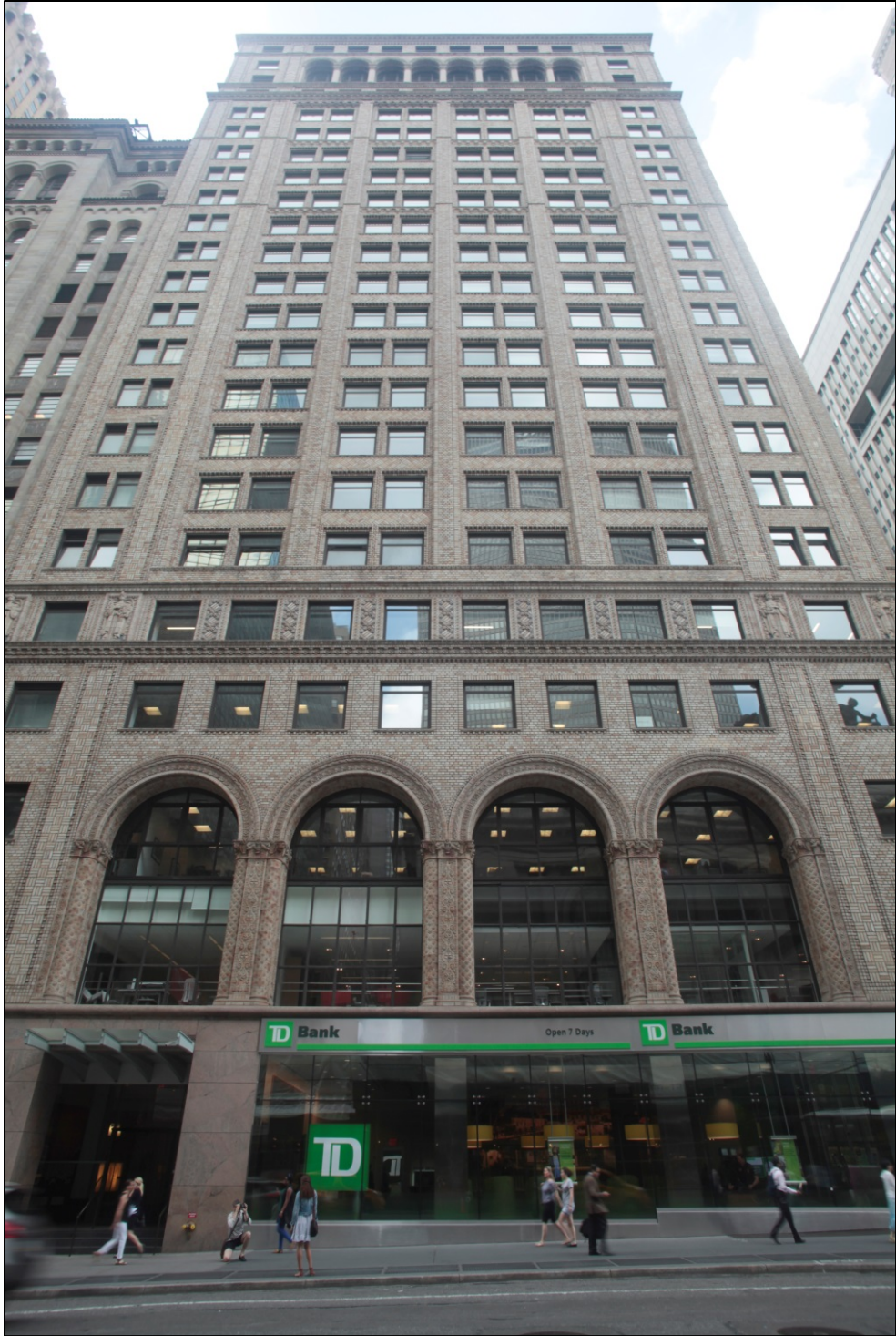
East 42 nd Street façade Photo: Sarah Moses, June 2016