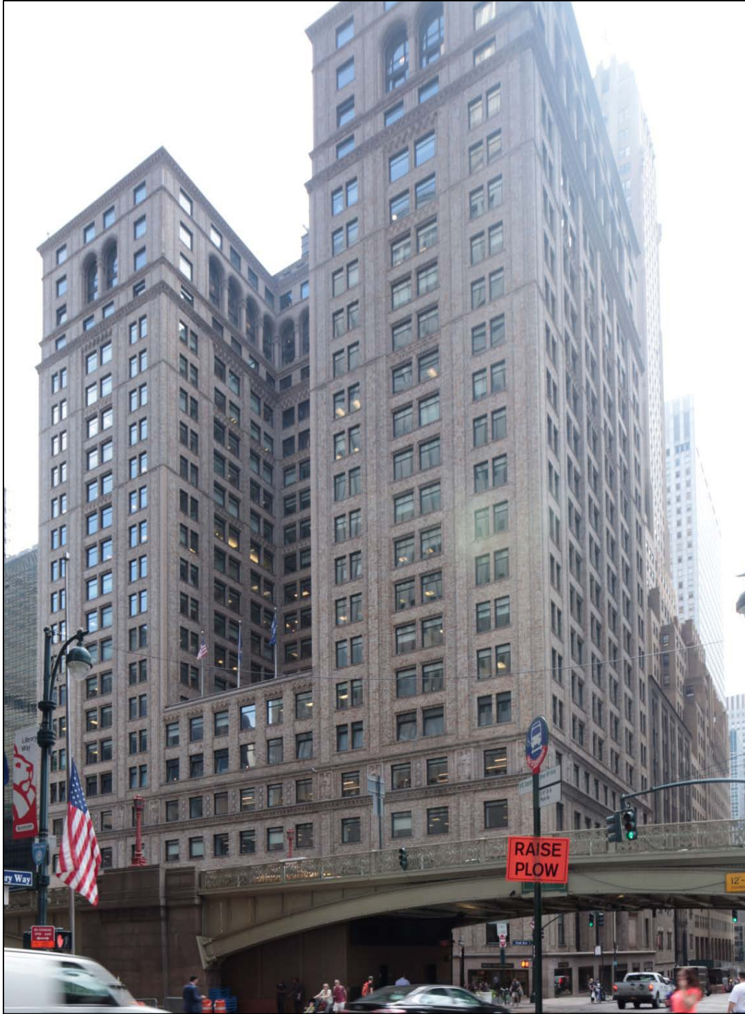
Park Avenue and East 41 st Street façades Photo: Sarah Moses, June 2016