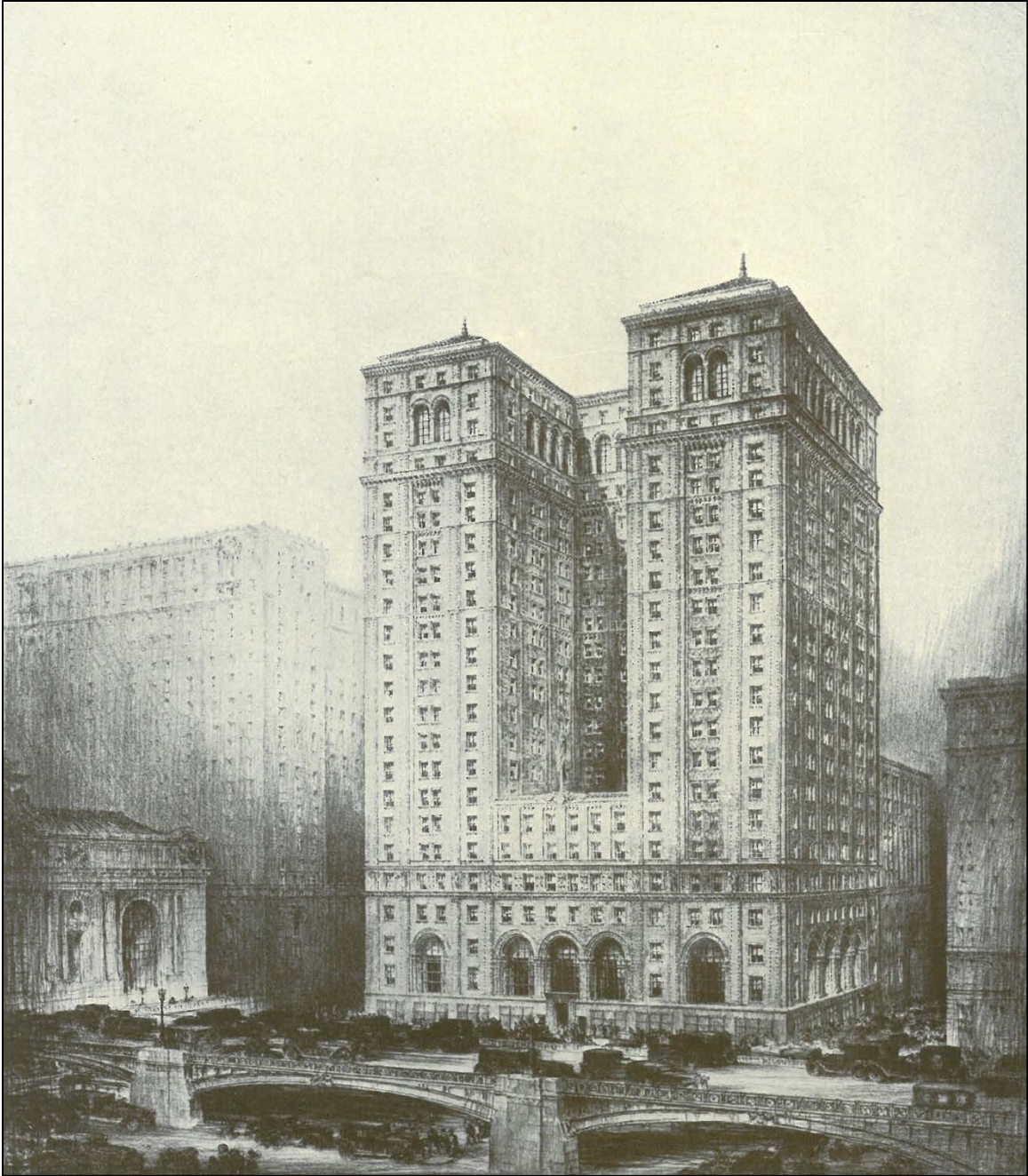
“Pershing Square Building, Forty-Second Street and Park Avenue, New York”