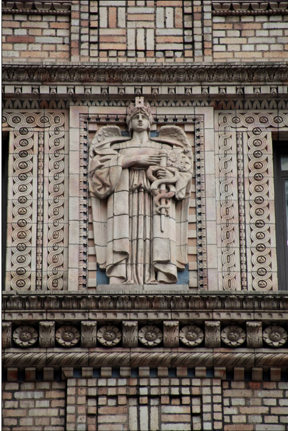
Allegorical figure, Park Avenue facade Photo: Sarah Moses, June 2016