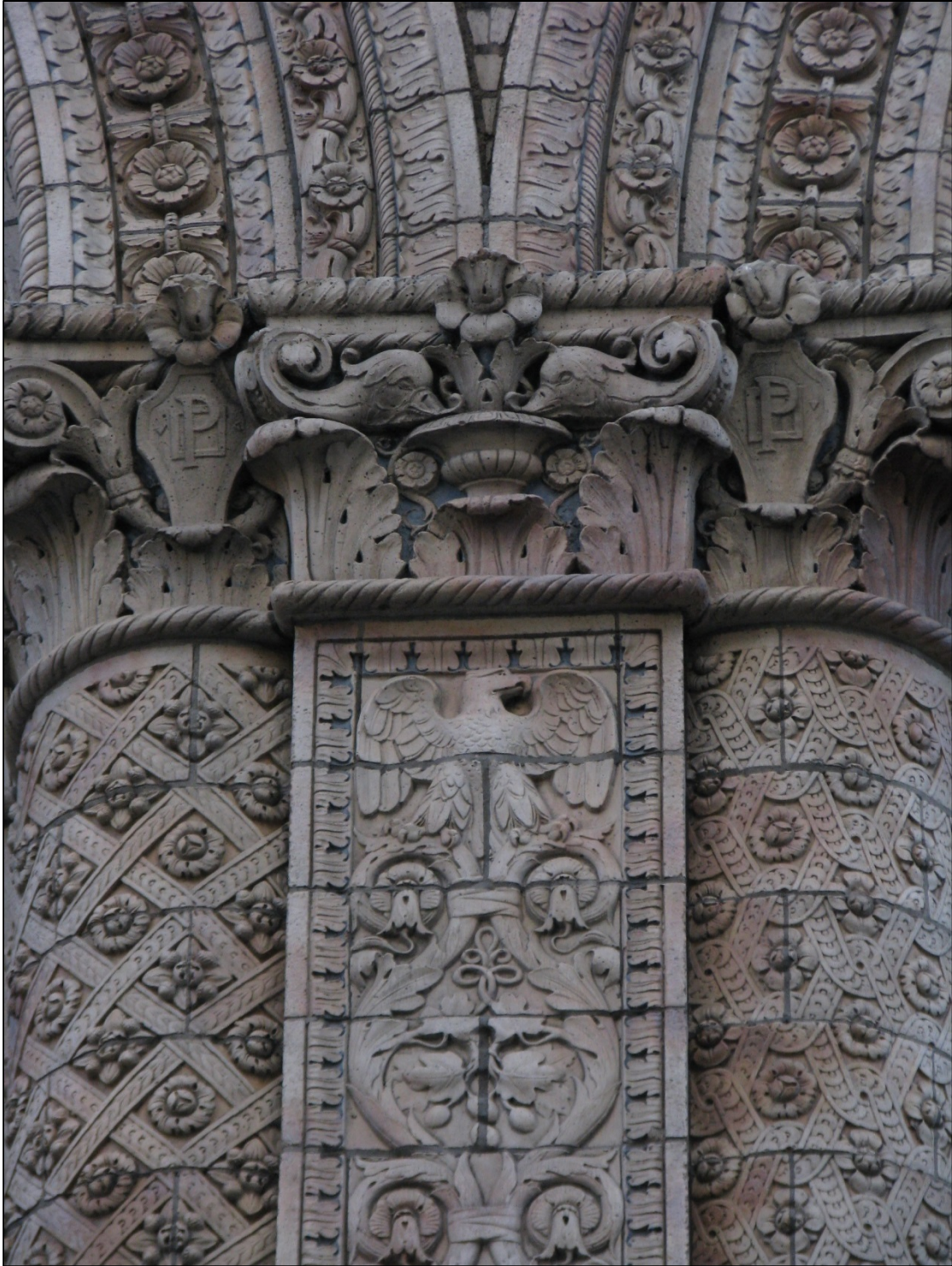
Terra-cotta details Park Avenue facade Photo: Gale Harris, April 2015