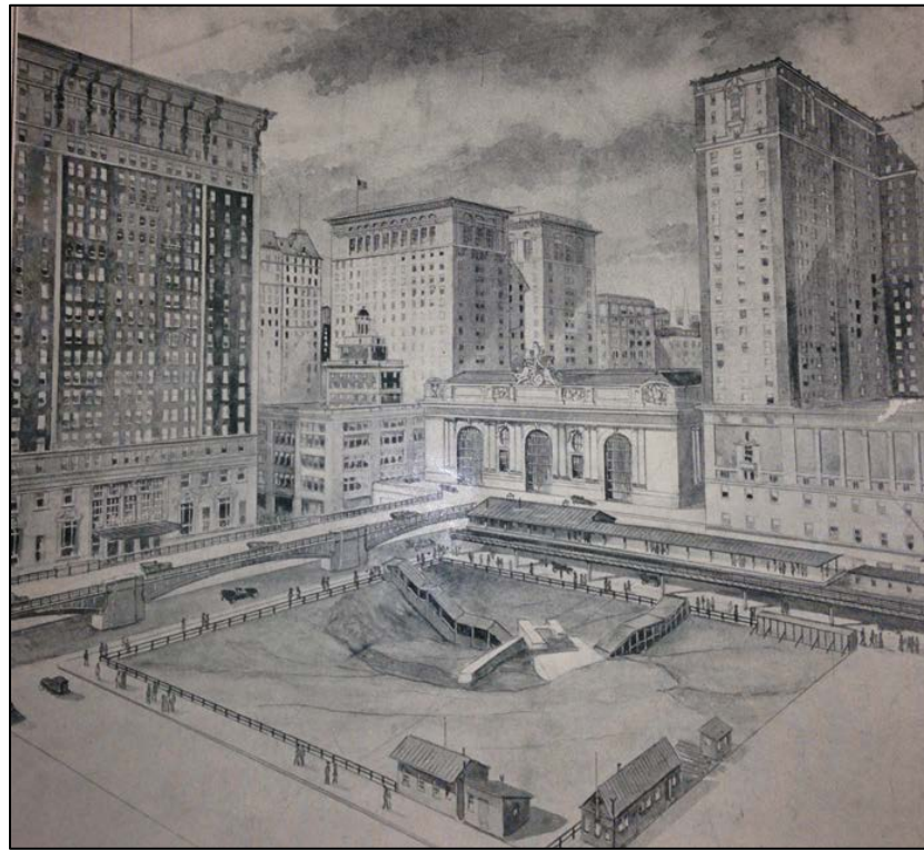
Top: Map showing the transit lines running below and adjacent to the Pershing Square Building site