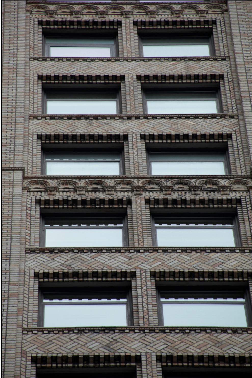
Decorative brickwork 42 nd Street façade Photo: Sarah Moses, June 2016