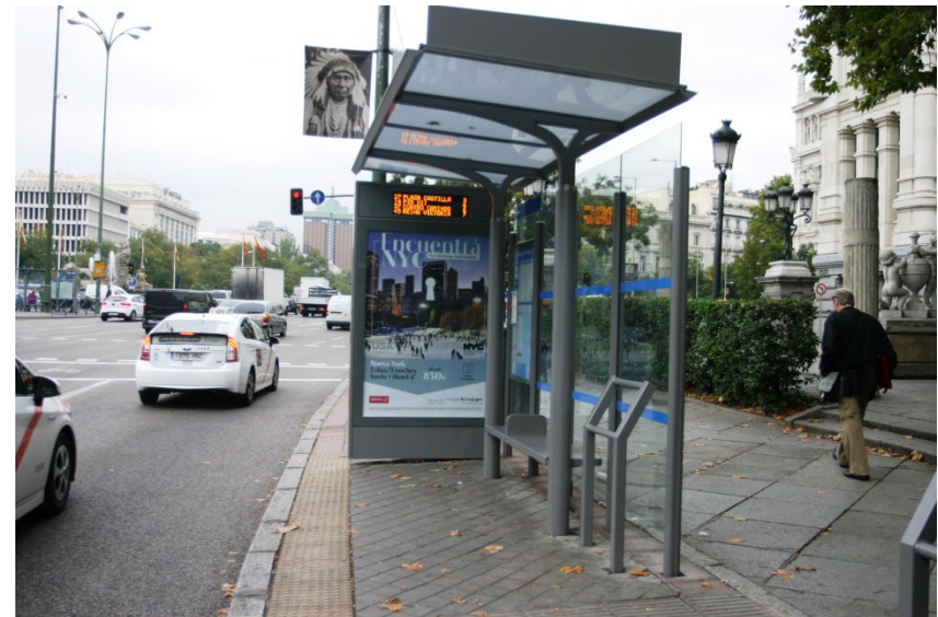
Tourism campaign in Madrid