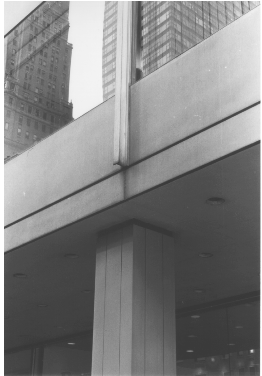
Fig. 4: detail of mullion, soffit, and column (DMB)