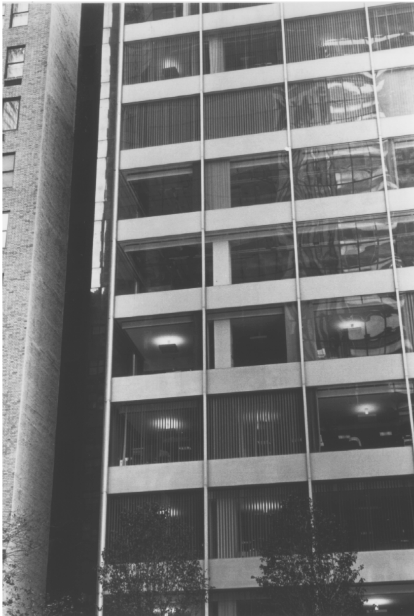
Fig. 3: detail of curtain wall (DMB)