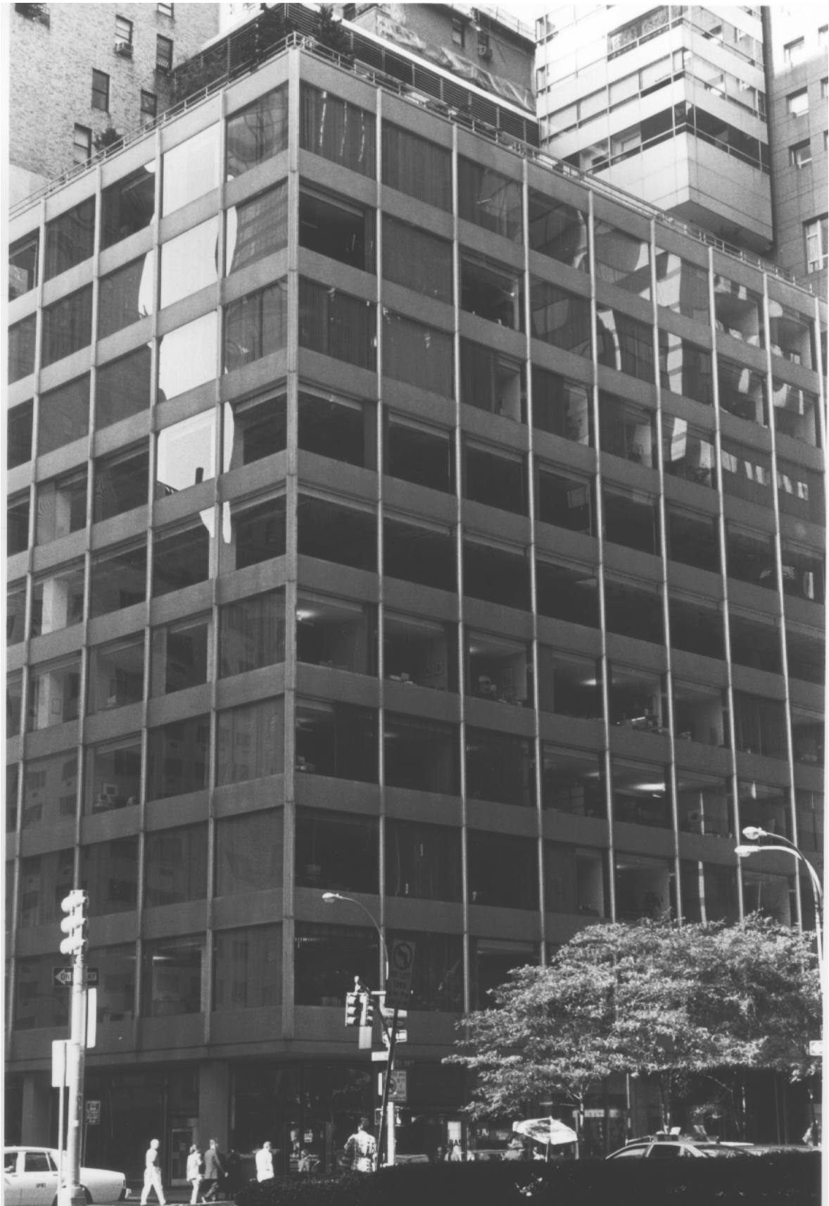
Fig. 2: (Former) Pepsi-Cola Building, photo of exterior