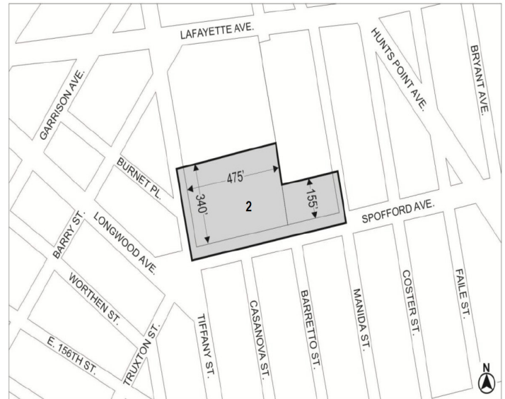
Map 2 - [date of adoption]

Mandatory Inclusionary Housing Program Area see Section 23-154(d)(3)