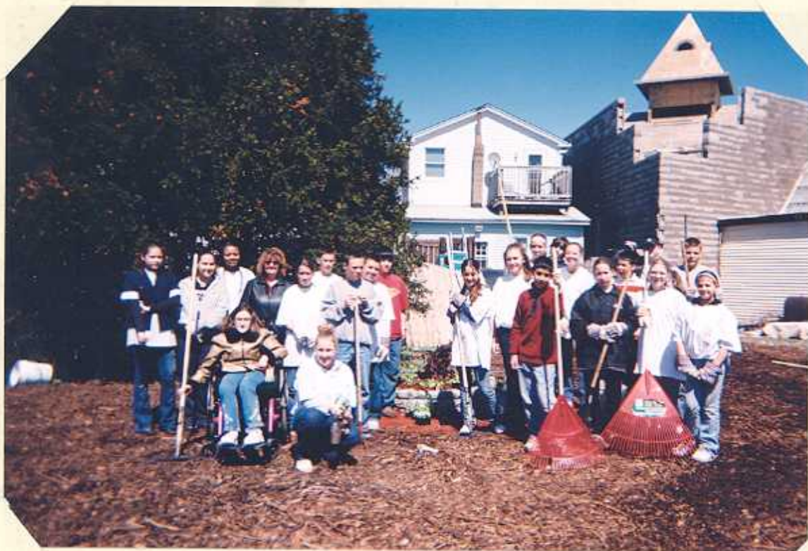
Our Team UP to Clean Up members