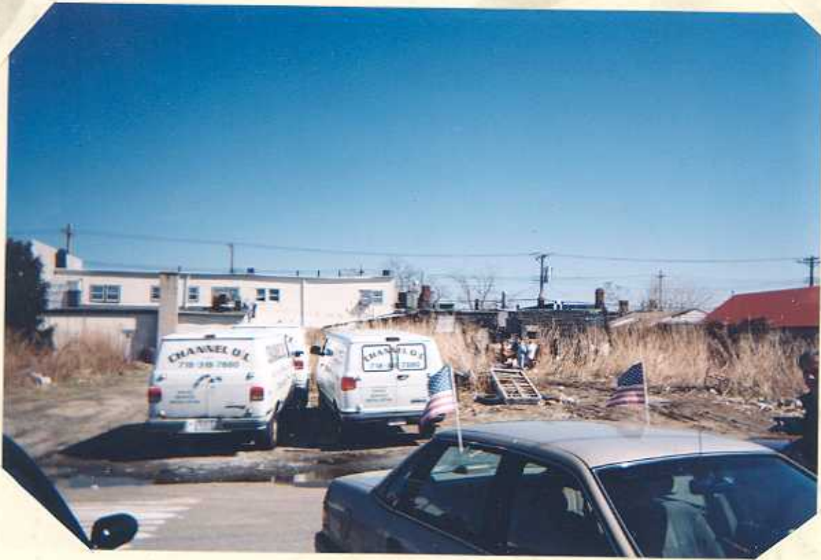
View from school front entrance