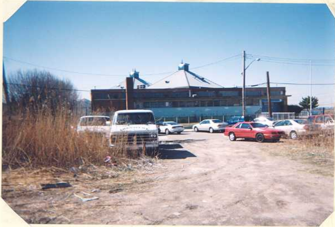
View of the school from the lot