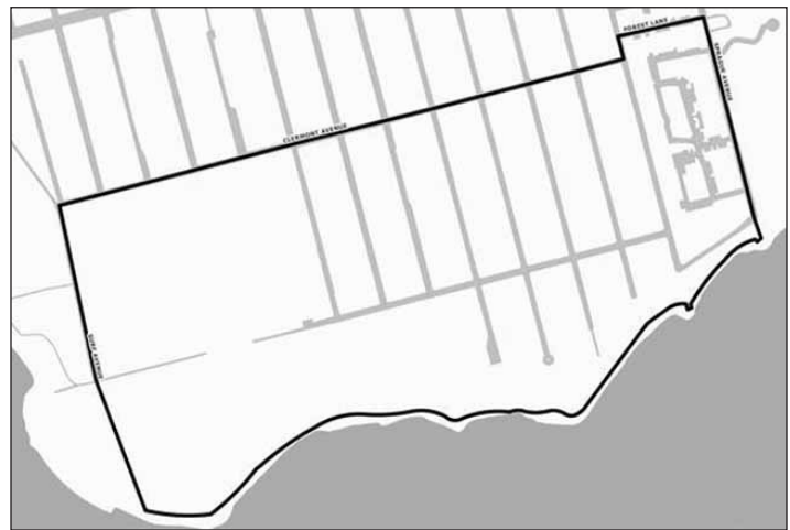
Map 9 Neighborhood Recovery Areas in Staten Island Community District 3 (2 of 2)

YVETTE V. GRUEL, Calendar Officer City Planning Commission 22 Reade Street, Room 2E, New York, NY 10007 Telephone (212) 720-3370