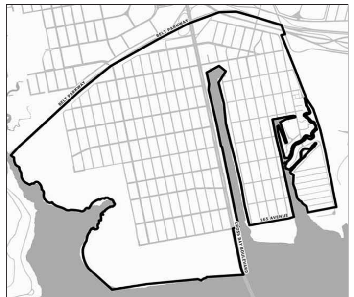
Map 4 Neighborhood Recovery Area in Queens Community District 10