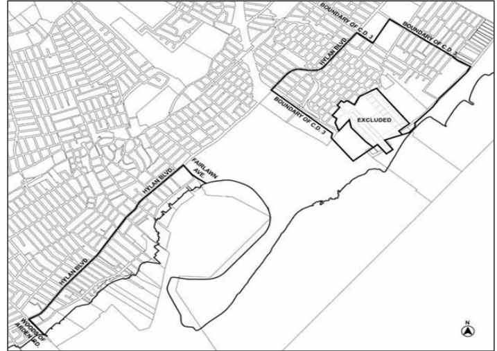
Map 8 Neighborhood Recovery Area in Staten Island Community District 3 (1 of 2)

Areas designated by New York State as part of the NYS Enhanced Buyout Area Program are excluded from the neighborhood recovery areas and are designated on this map as "Excluded"