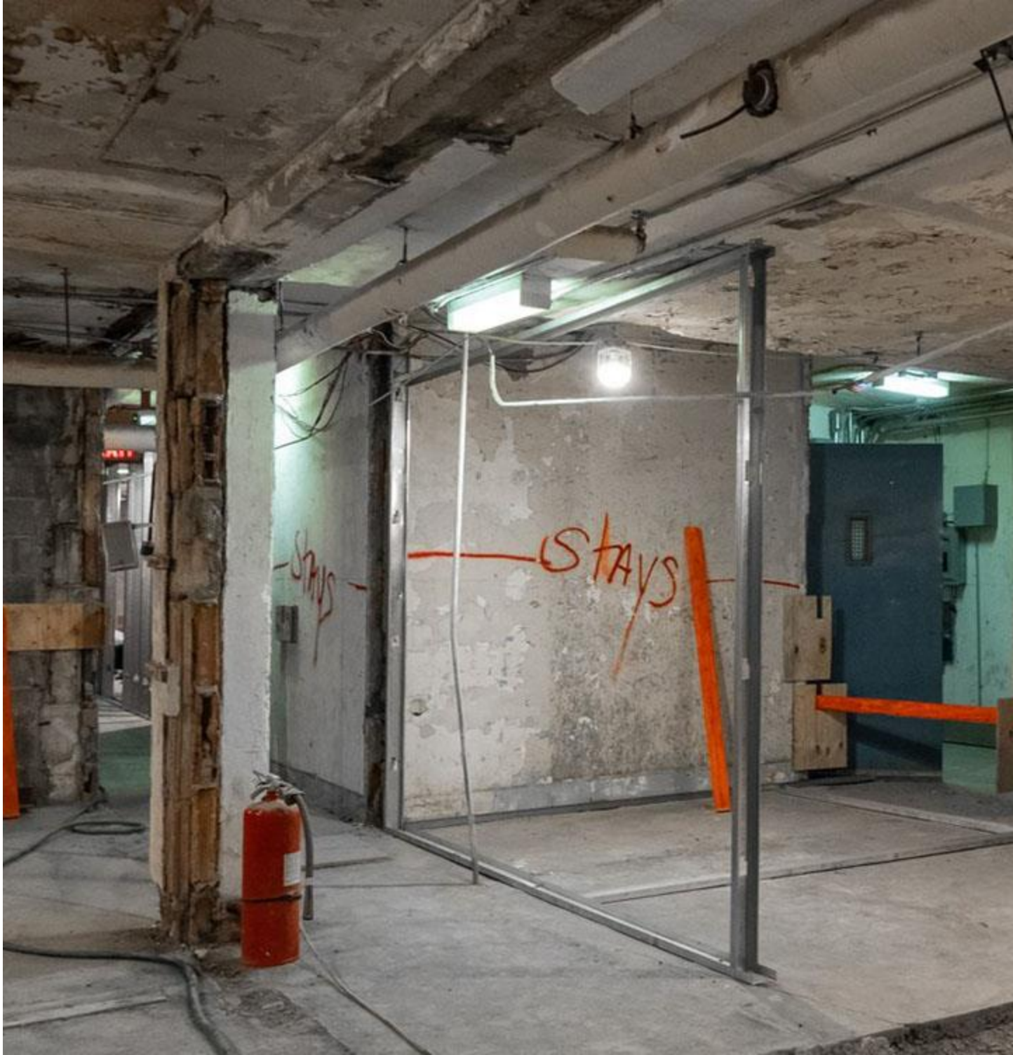
Ten single room occupancy units are being built at the site