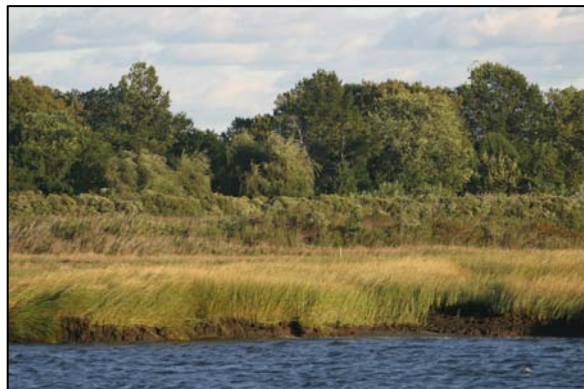
The wetlands and adjacent protective vegetated buffers of Jamaica Bay serve invaluable natural functions including habitat, flood control and protection, natural pollutant attenuation and local marine research.

The results of this current review, or NYCDEP's initial responses to the recommendations, are described in