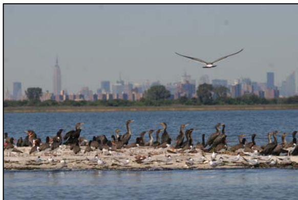
Water quality improvements, as one of the goals of the JBWPP, would help to support a healthy and self-sustaining ecosystem for natural wildlife communities and enhance recreational uses for New York City’s residents and visitors.

While the direct cause(s) of this accelerated rate of wetland loss remains unknown, the primary mechanisms of transformation in the Bay and its watershed have been directly or indirectly related to human disturbance. Urban development—including residential, commercial, industrial, public facilities, and transportation infrastructure—and the near complete loss of upland natural features had a direct impact on the ecological integrity of perimeter areas and water quality in the receiving waters of the Jamaica Bay estuary. The