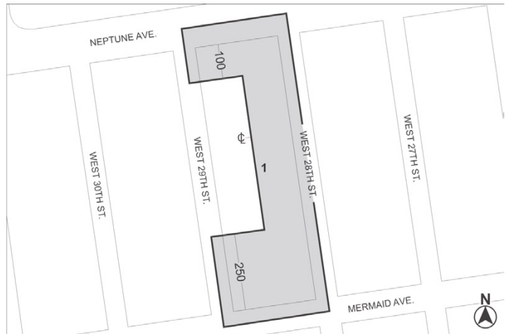
█ Mandatory Inclusionary Housing Area (see Section 23-154(d)(3))