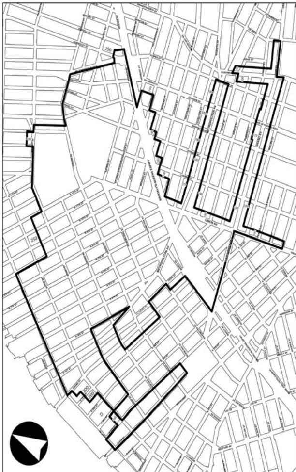
EXISTING Portion of Community District 1, Brooklyn