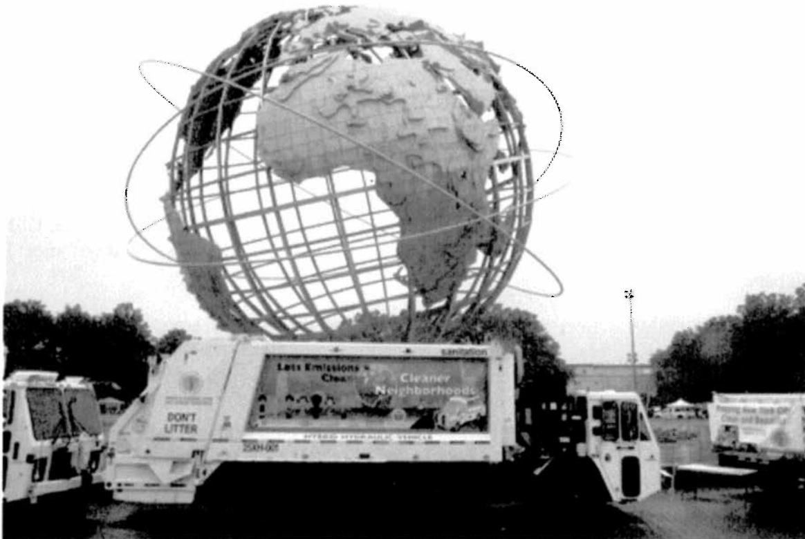
2009: First Hybrid Hydraulic Collection Truck in North America