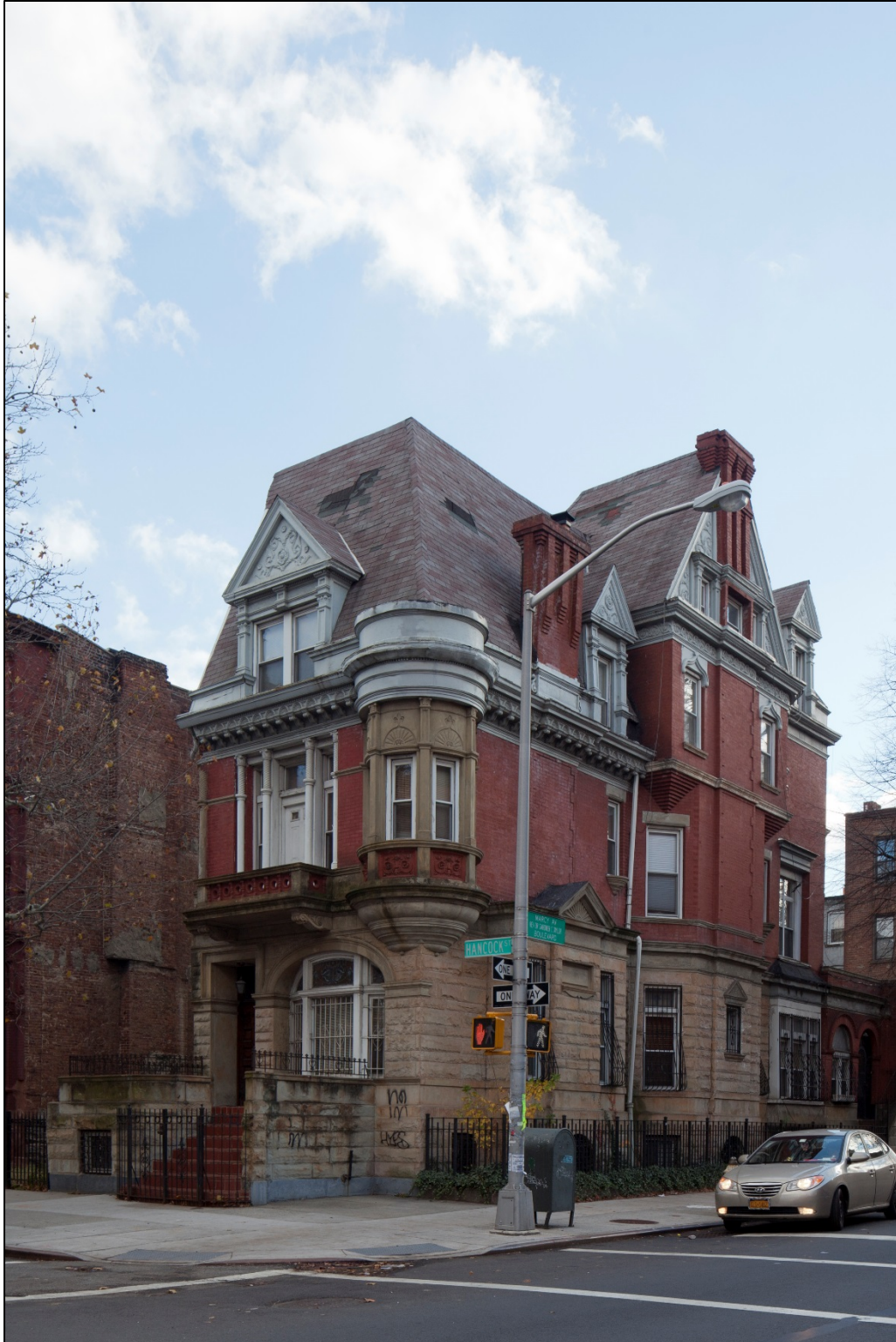
Figure 22 232 Hancock Street (Montrose W. Morris, c. 1888) Photo: Christopher D. Brazee, 2015