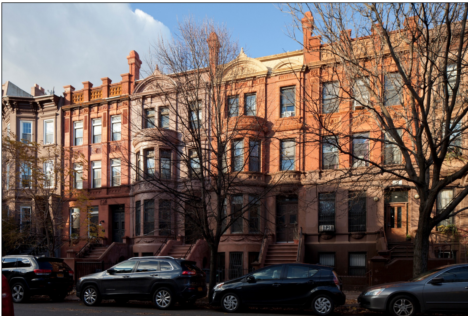
Figure 16 159 to 165 Hancock Street (John G. Prague, c. 1887)