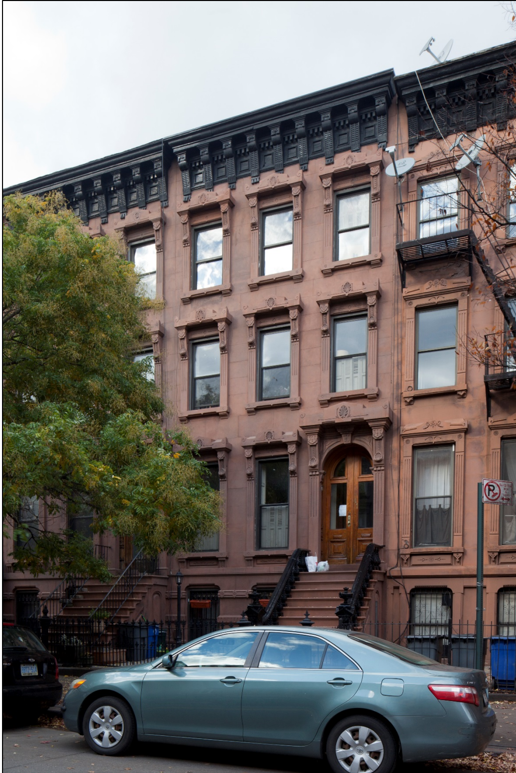
Figure 5 41 Halsey Street (Thomas B. Jackson, c. 1878-82)