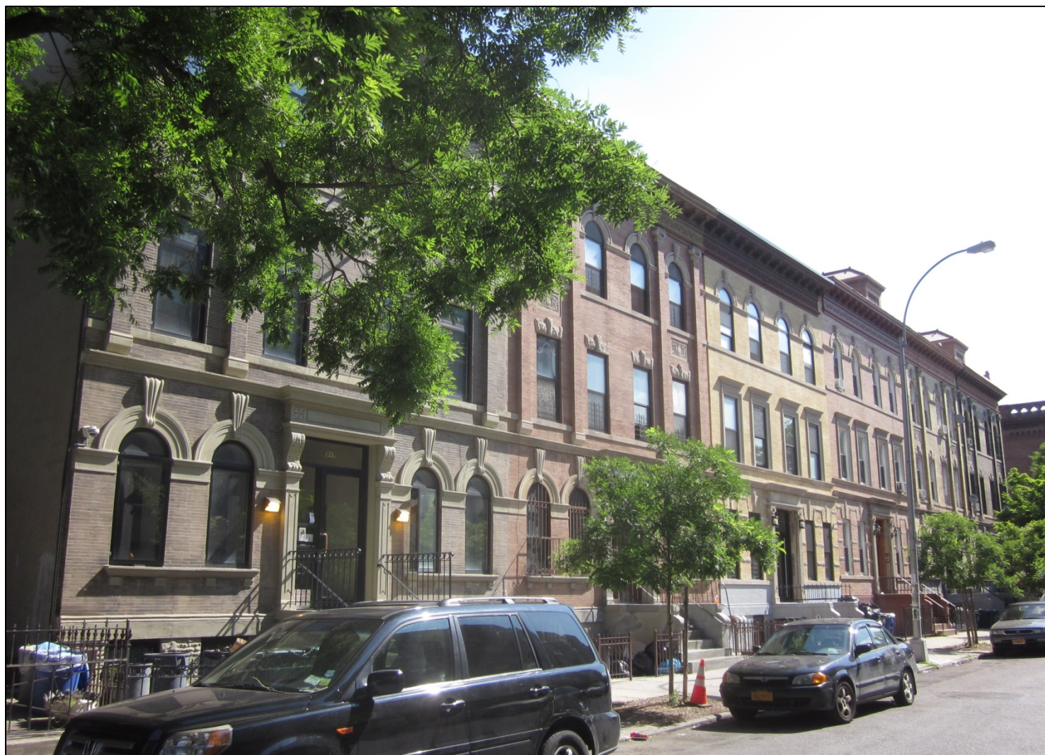
Figure 41 317 to 327 Putnam Avenue (Max J. Smallheiser, c. 1899) Photo: Michael Caratzas, 2015