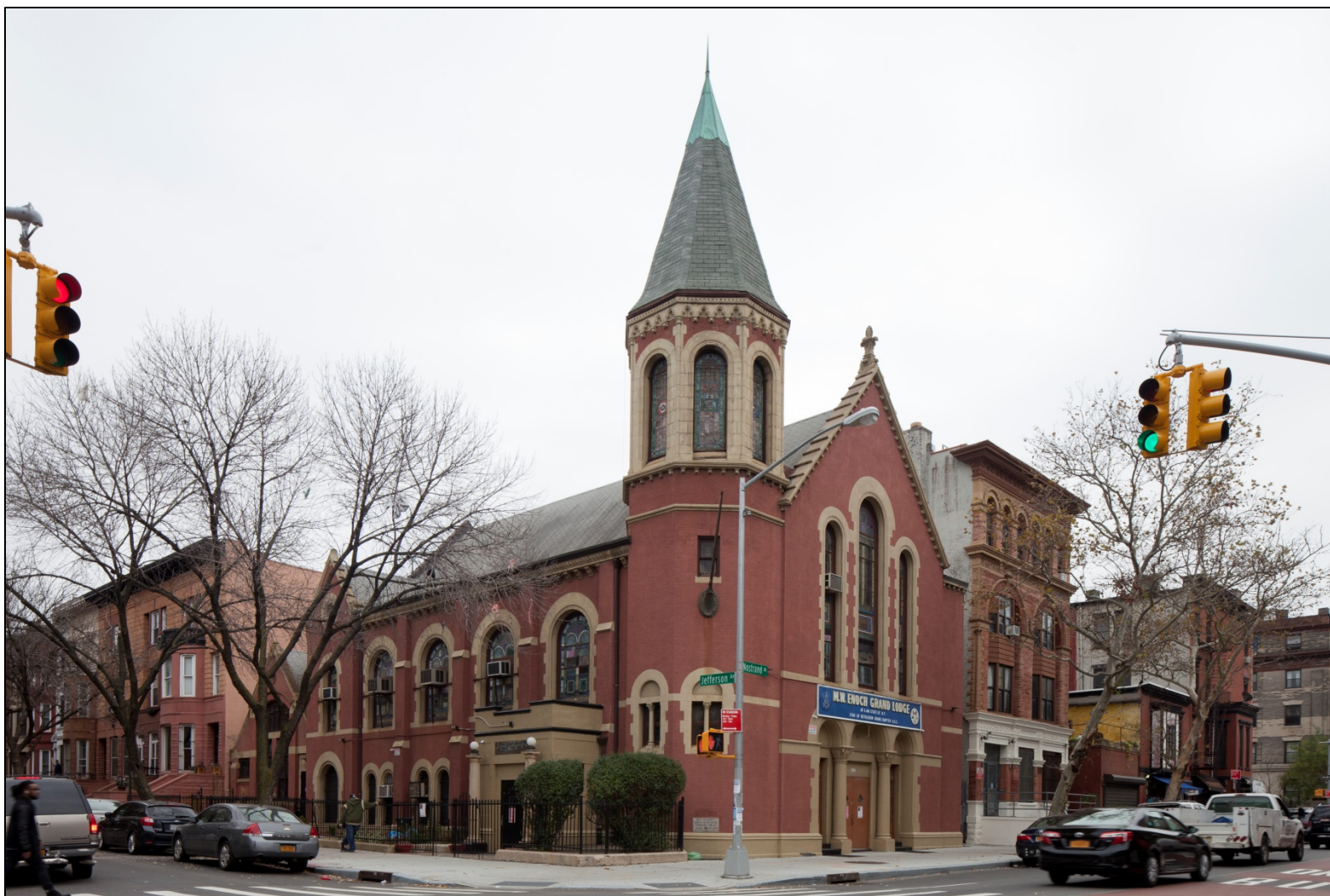
Figure 50 Reformed Episcopal Church of the Reconciliation (originally)/Most Worshipful Enoch Grand Lodge (since 1944) 423 Nostrand Avenue (Heins & LaFarge, c. 1890)