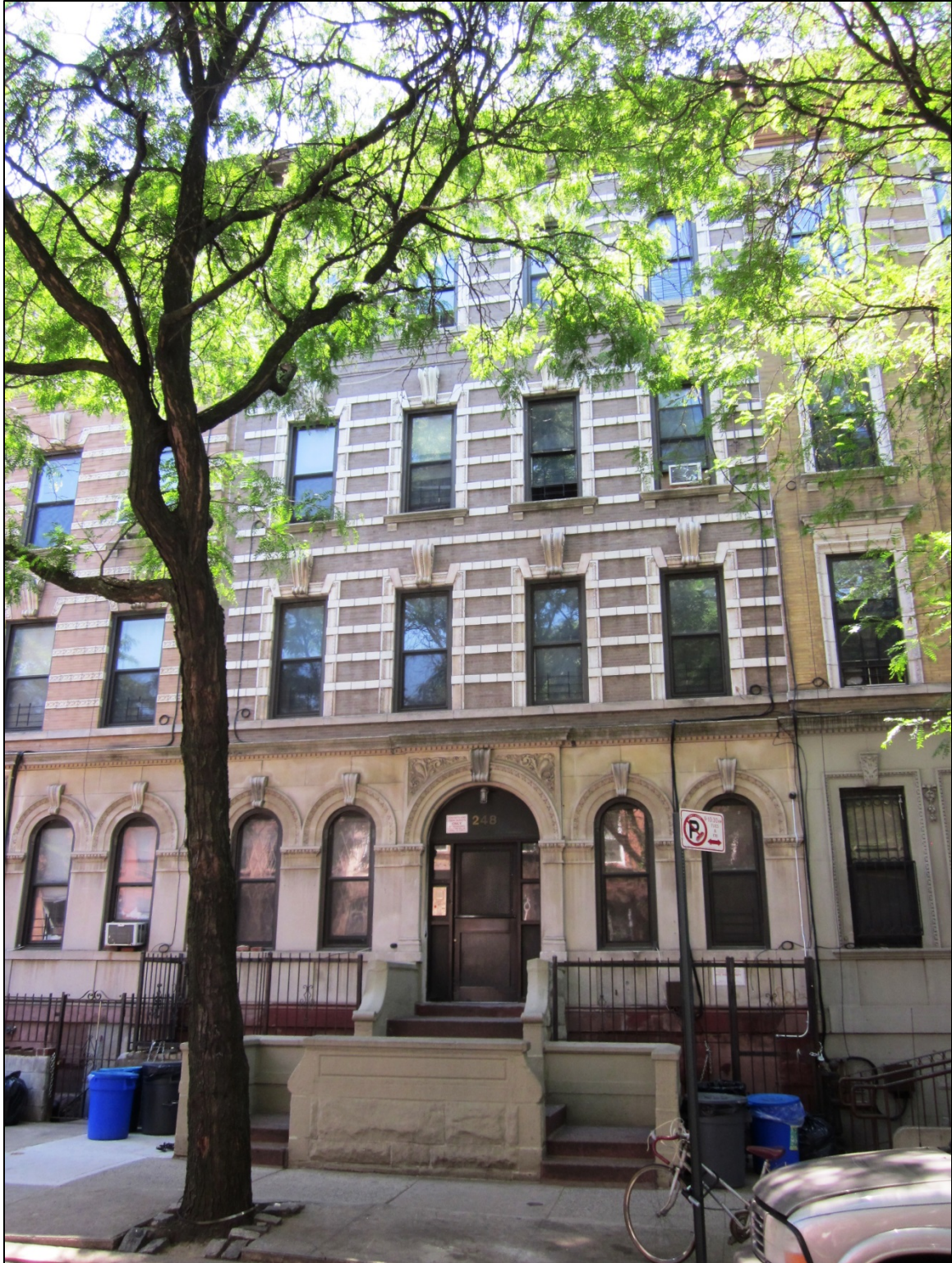
Figure 42 248 Madison Street (Max J. Smallheiser, c. 1899) Photo: Michael Caratzas, 2015