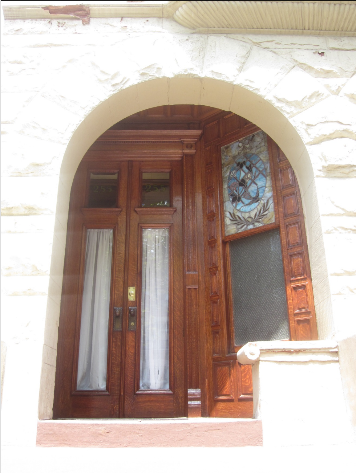
Figure 25 255 Hancock Street (main entrance) (Montrose W. Morris, c. 1889)