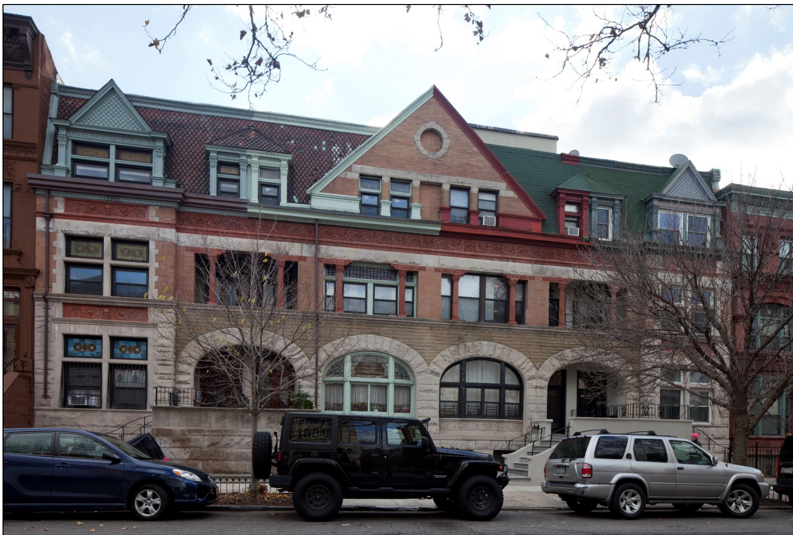
Figure 23 246 to 252 Hancock Street (Montrose W. Morris, c. 1889) Photo: Christopher D. Brazee, 2015