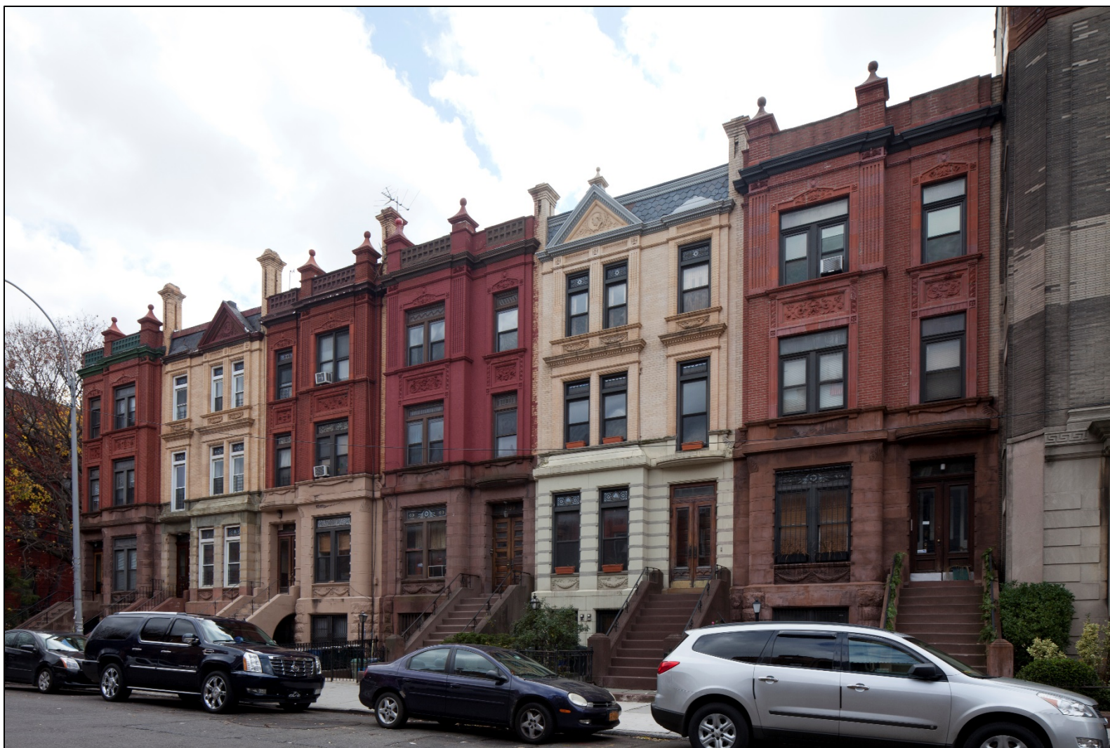
Figure 15 150 to 160 Hancock Street (John G. Prague, c. 1886-87)