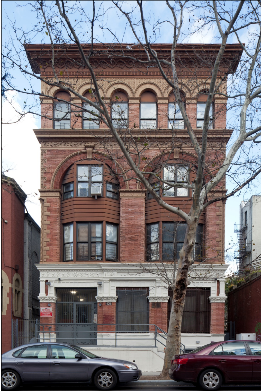
Figure 43 The Clinton 425 Nostrand Avenue (Montrose W. Morris, c. 1888)