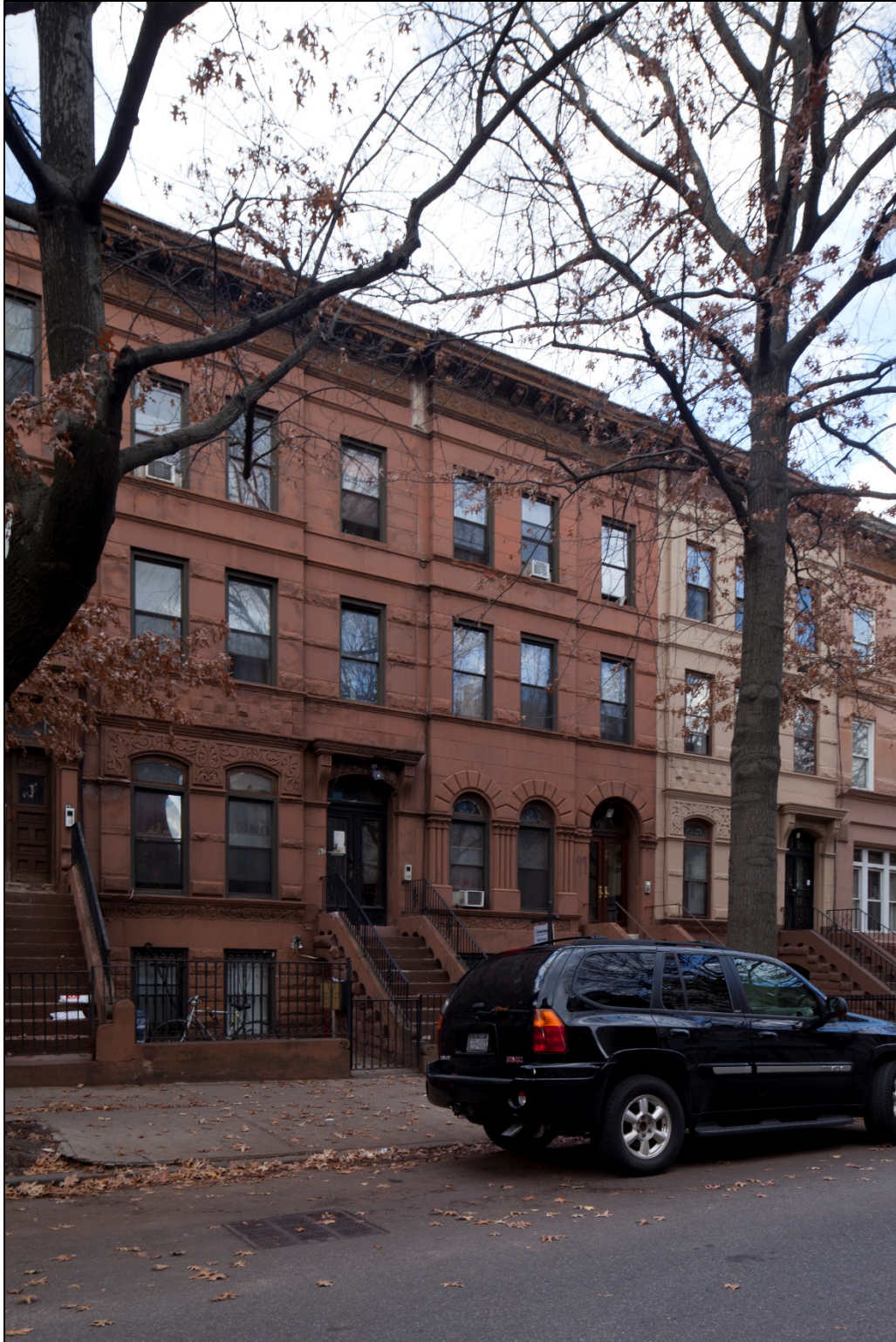
Figure 34 97 to 101 Macon Street (Robert Dixon, c. 1892) Photo: Christopher D. Brazee, 2015