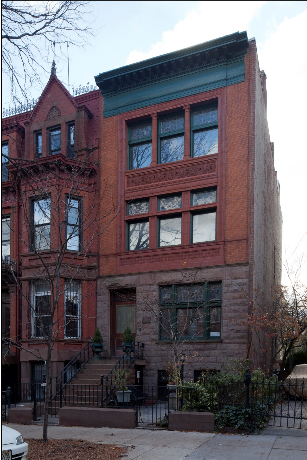
Figure 18 194 Hancock Street (George P. Chappell, c. 1886) Photo: Christopher D. Brazee, 2015