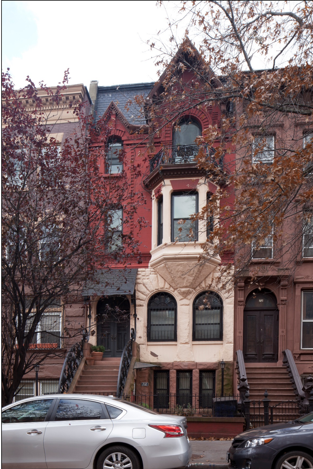
Figure 19 74 Halsey Street (Rudolph L. Daus, c. 1886) Photo: Christopher D. Brazee, 2015