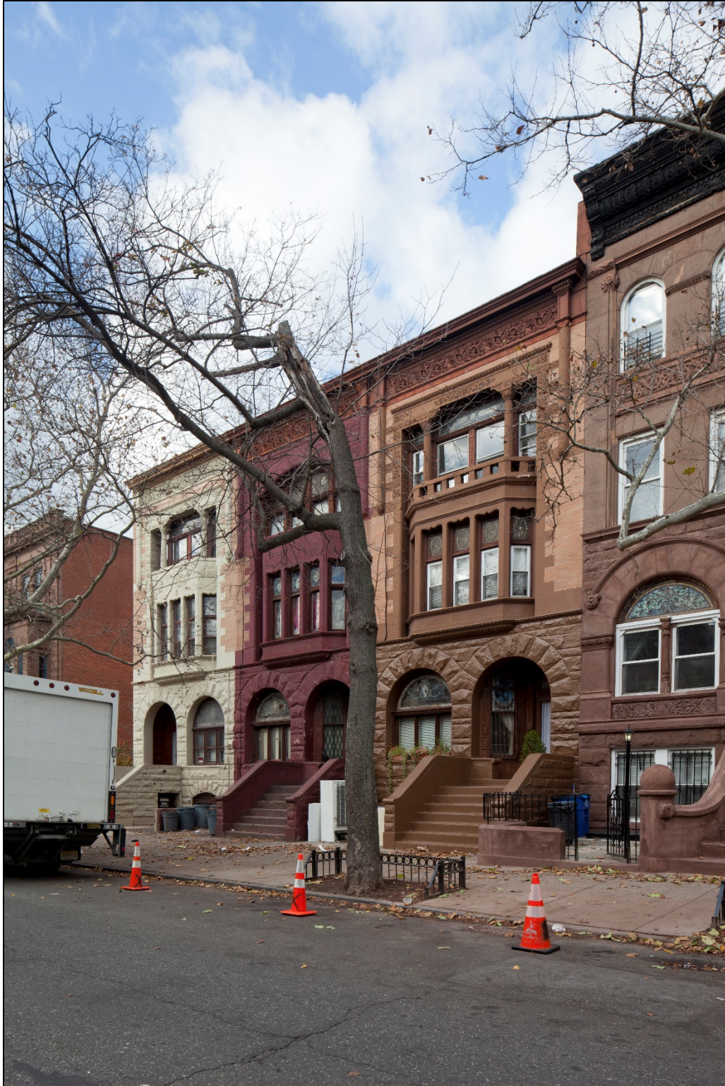
Figure 24 255 to 259 Hancock Street (Montrose W. Morris, c. 1889)