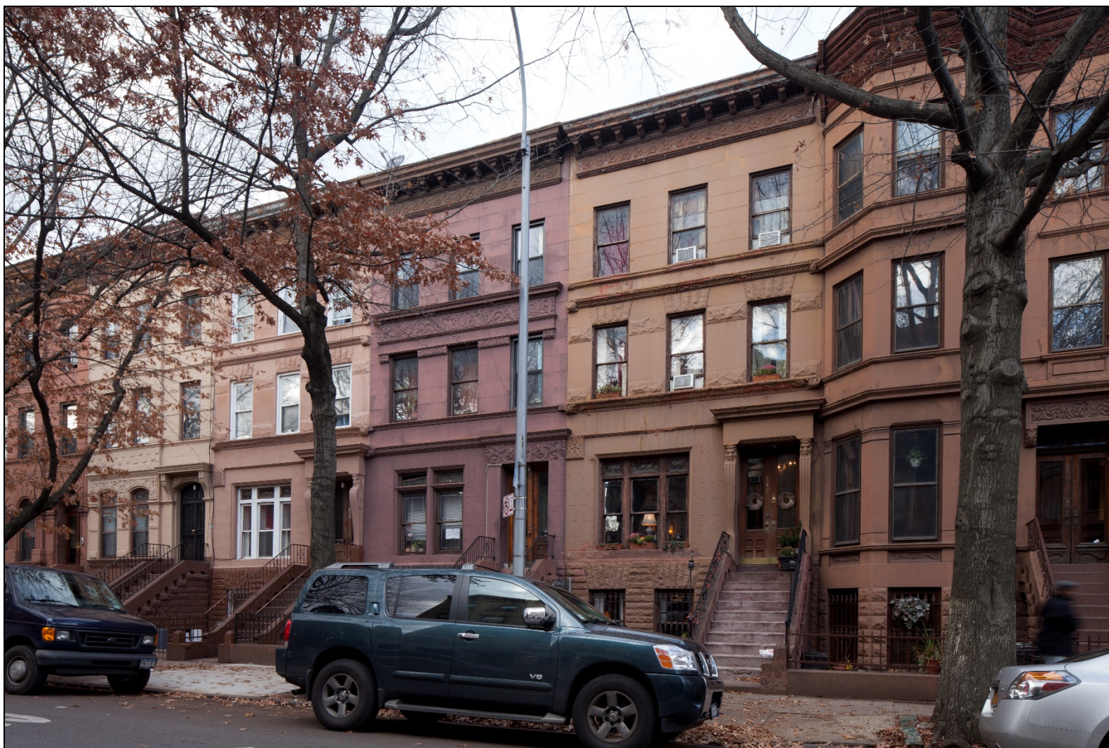
Figure 35 103 to 107 Macon Street (Robert Dixon, c. 1892) Photo: Christopher D. Brazee, 2015