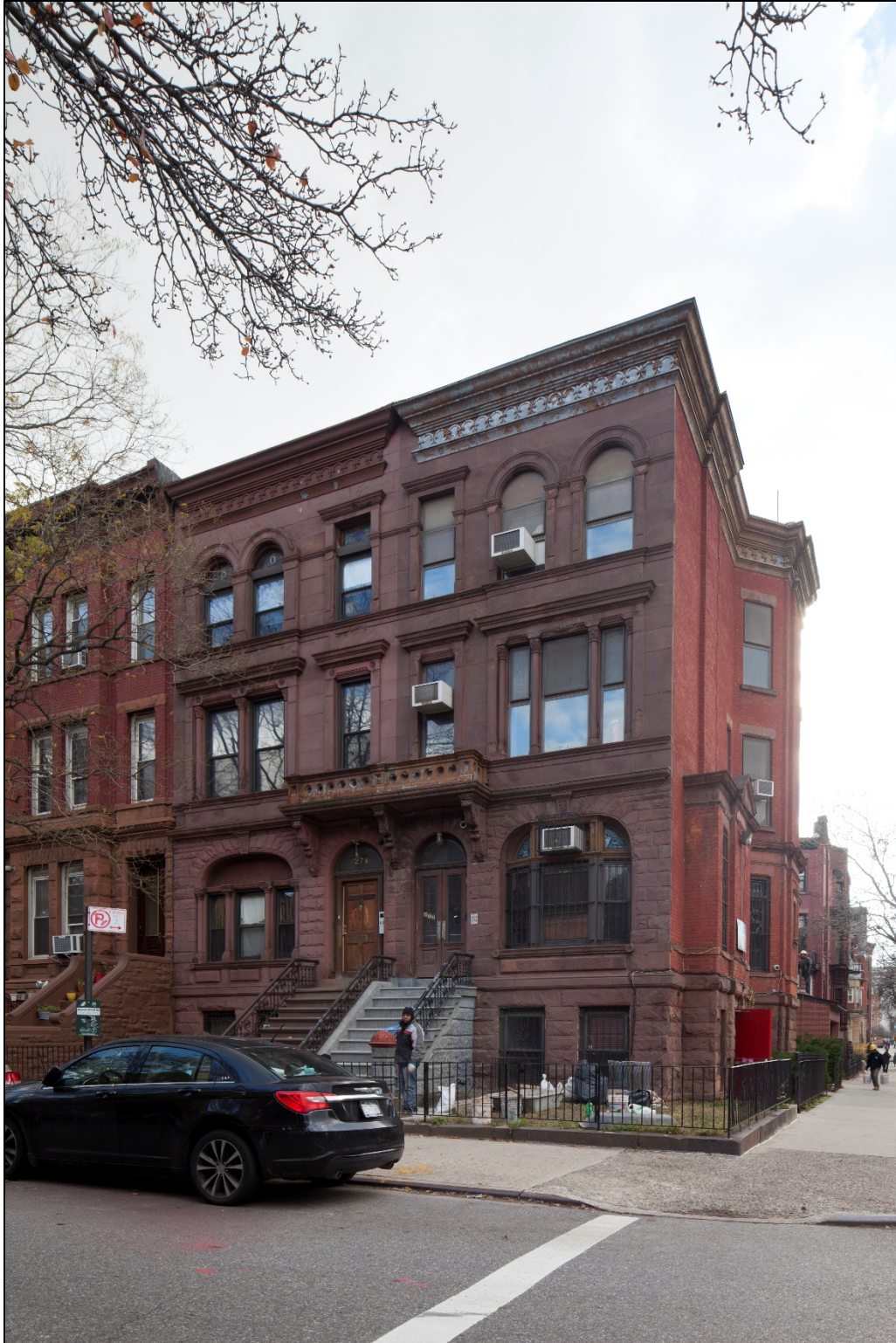
Figure 32 272 and 274 Jefferson Avenue (W. R. Bell & Company, c. 1889)