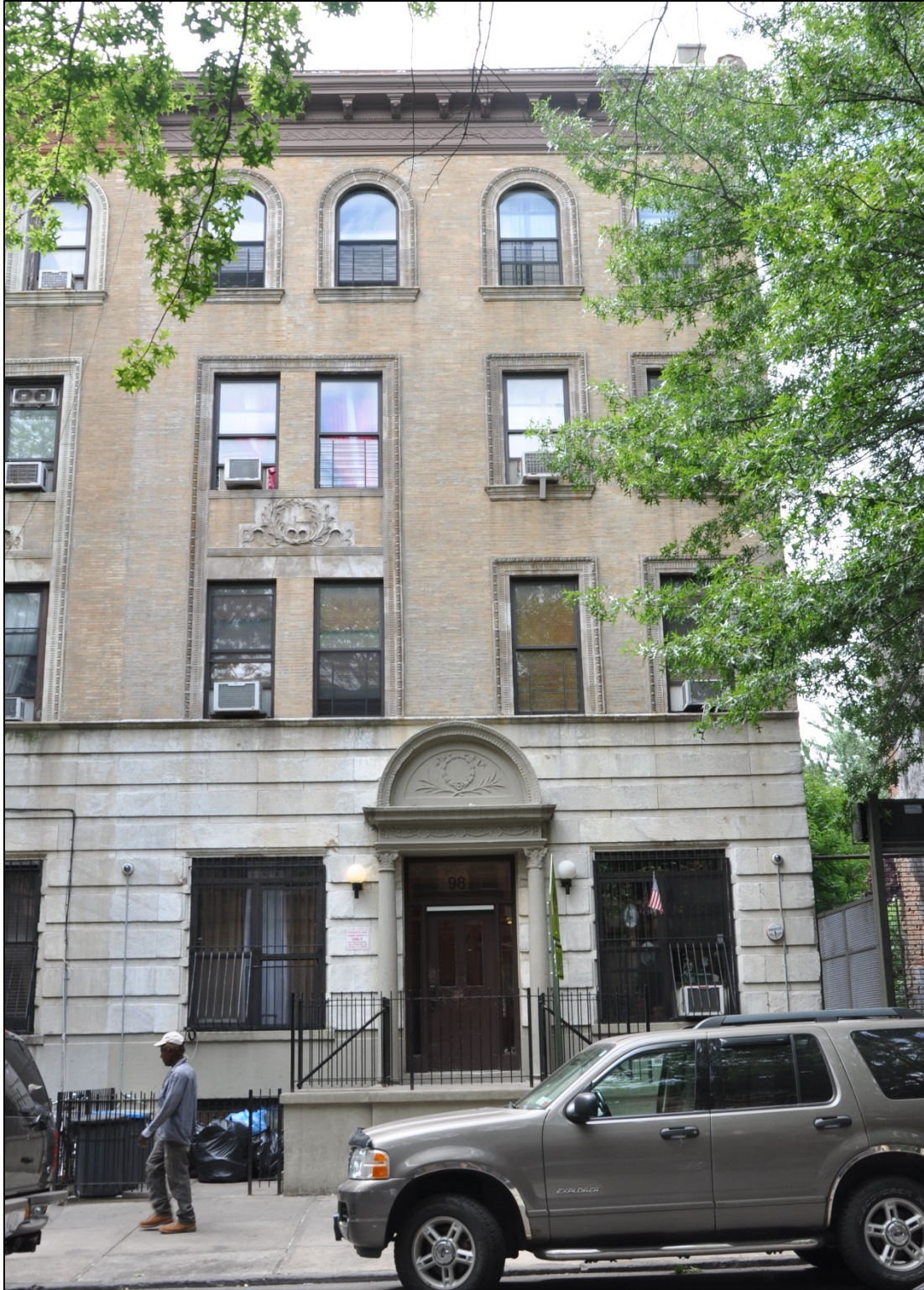
Figure 39 98 Macon Street (Frank S. Lowe, c. 1896) Photo: Corinne Engelbert, 2015