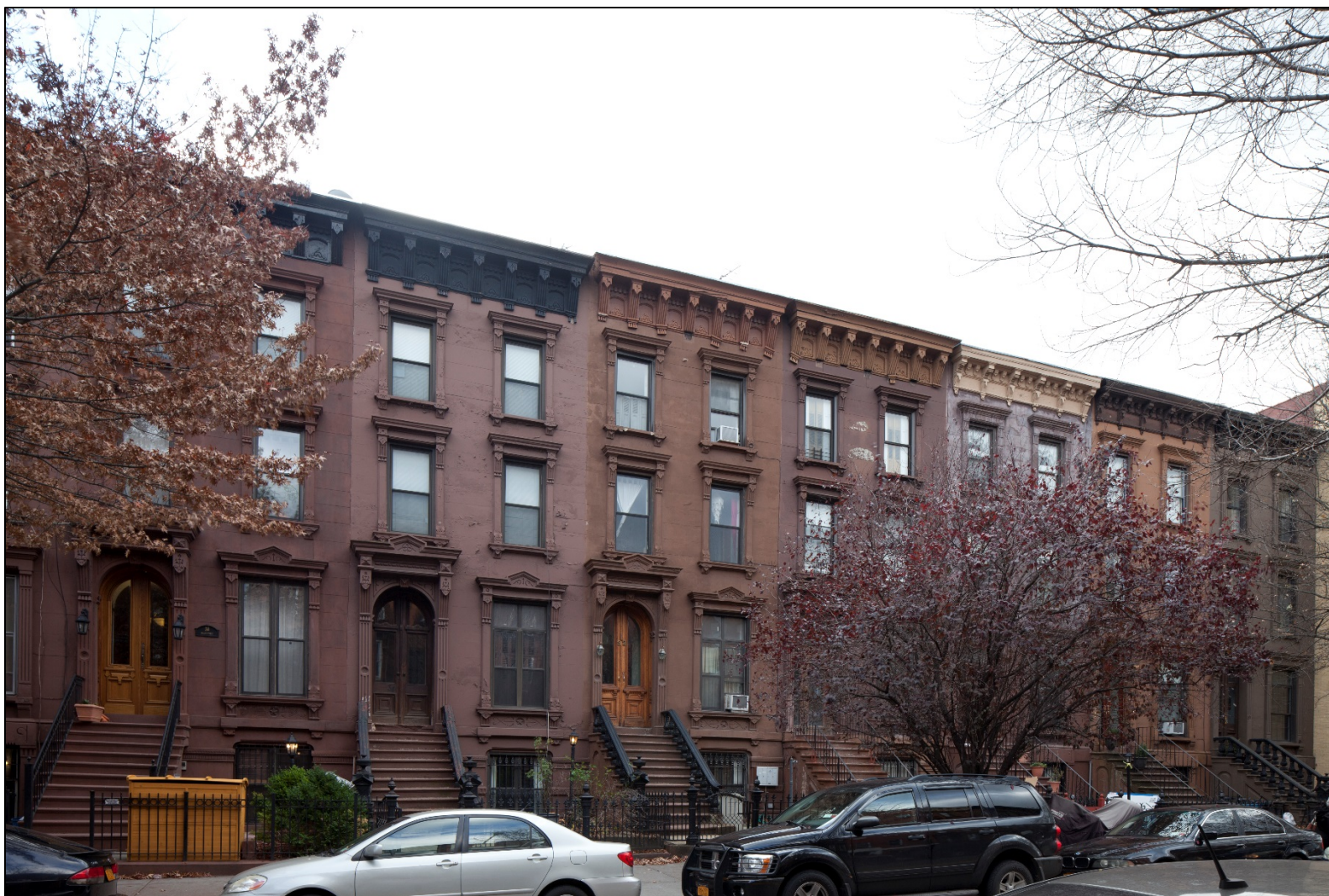
Figure 8 30 to 38 Halsey Street (Thomas B. Jackson, c. 1880) Photo: Christopher D. Brazee, 2015