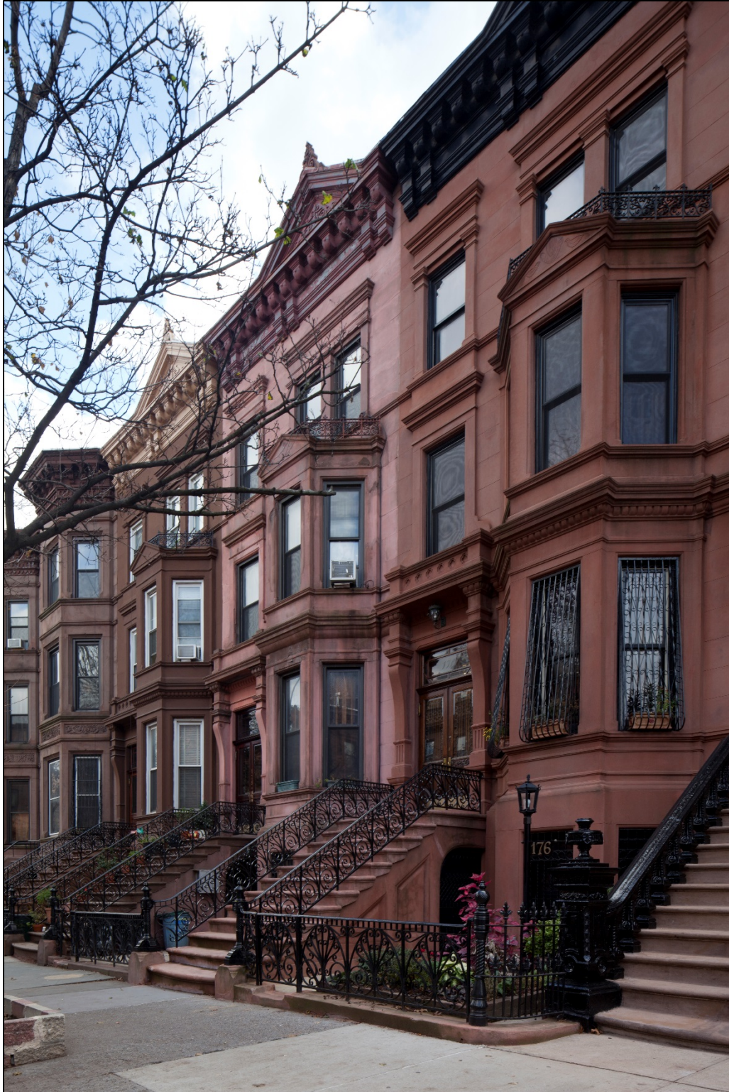
Figure 17 176 to 180 Hancock Street (John B. Snook, c. 1885) Photo: Christopher D. Brazee, 2015