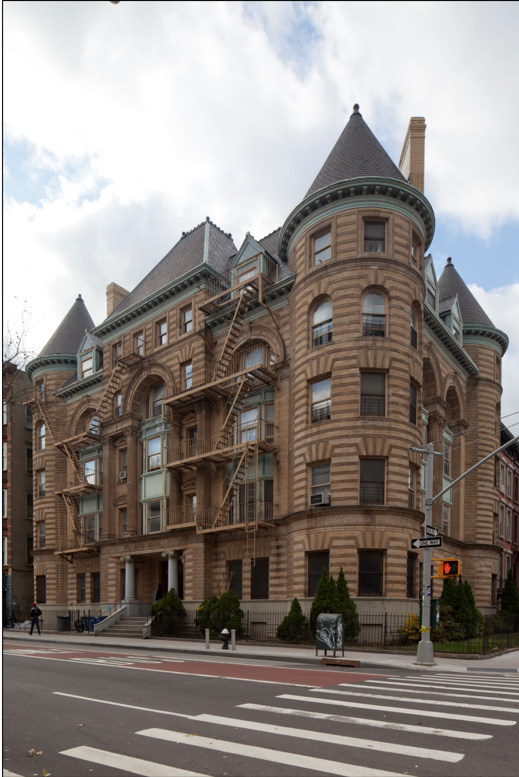
Figure 45 The Renaissance 480-482 Nostrand Avenue (Montrose W. Morris, 1892)