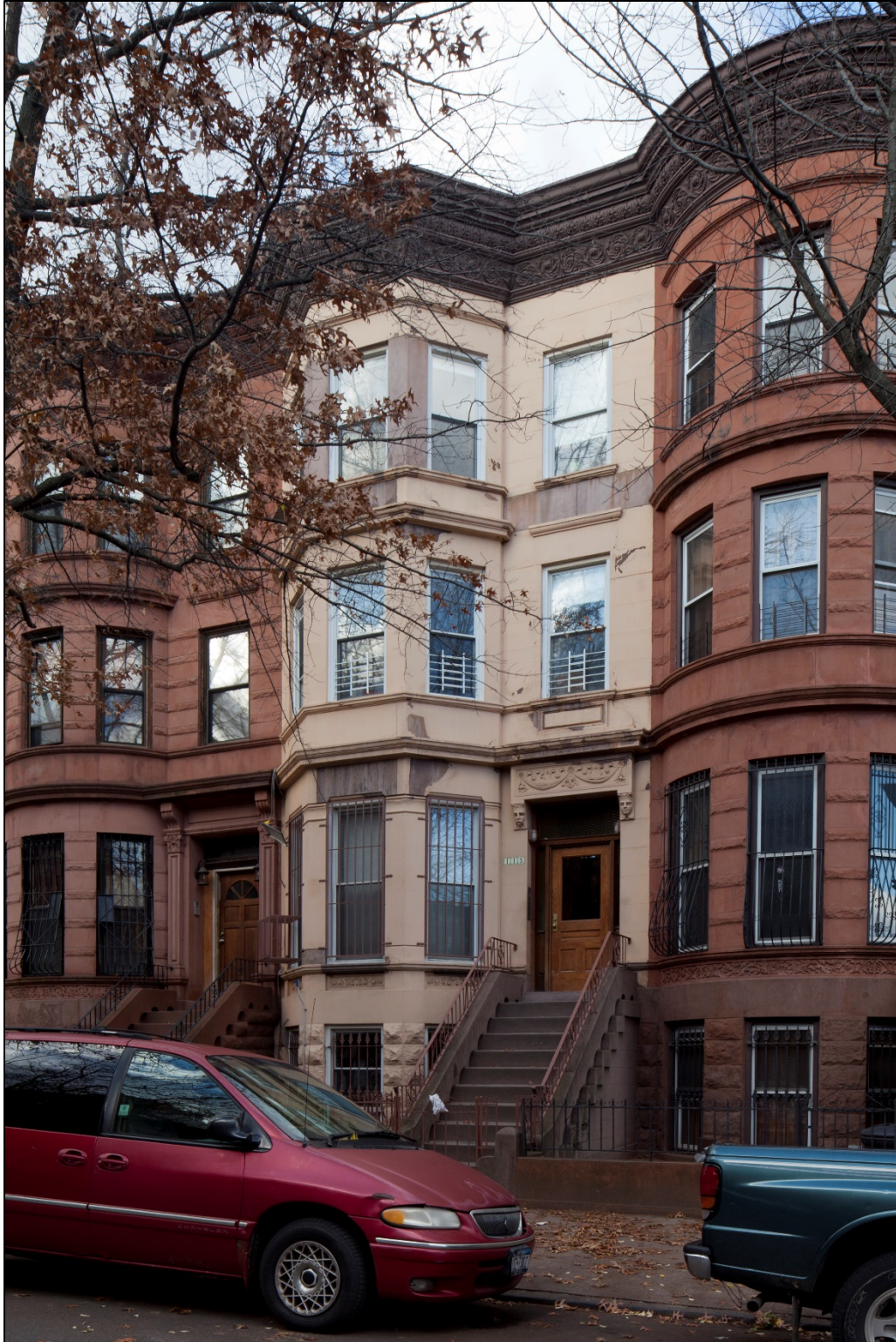
Figure 36 113 Macon Street (Robert Dixon, c. 1893)