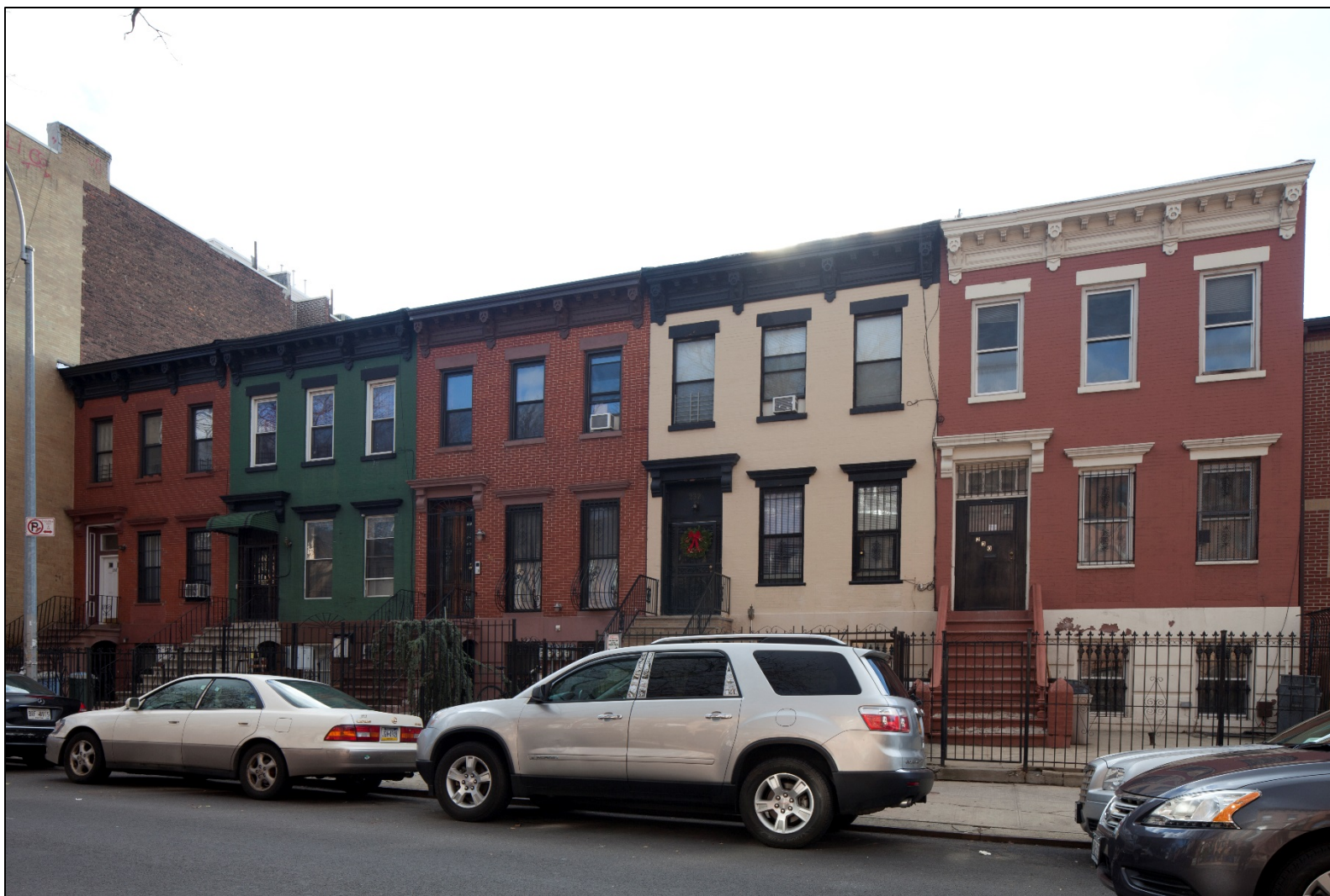
Figure 2 230 to 238 Madison Street (Attributed to Francis Wood, c. 1874-75)