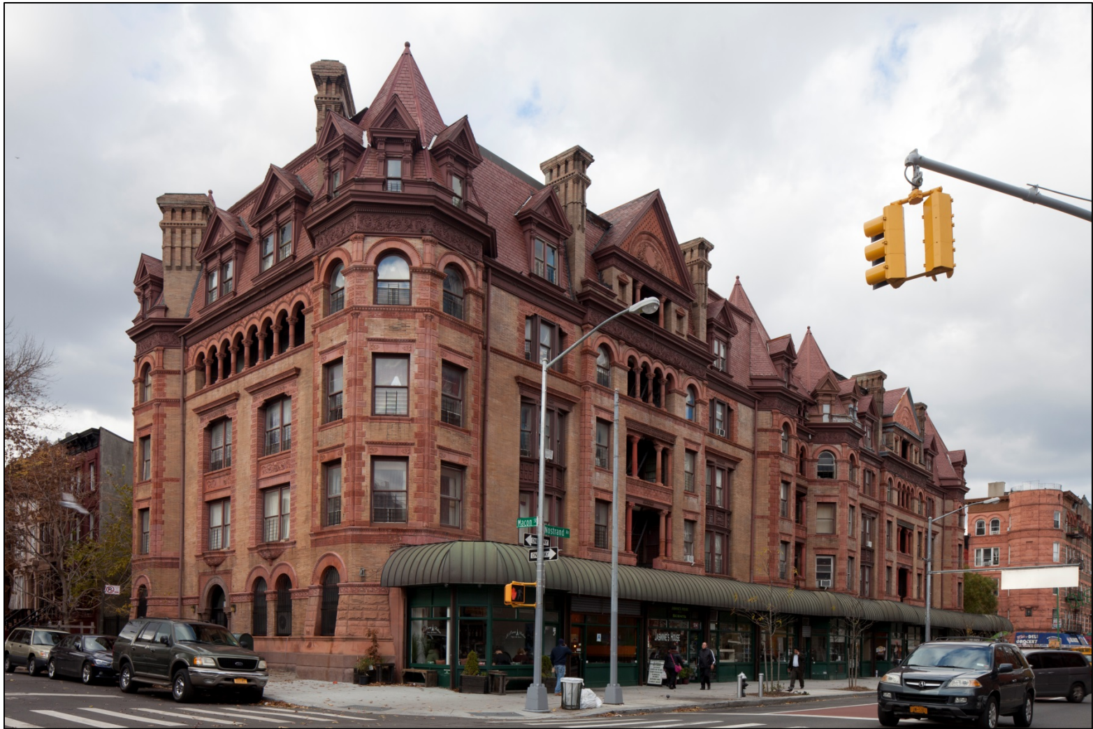
Figure 44 The Alhambra 500 Nostrand Avenue (Montrose W. Morris, 1889-90)