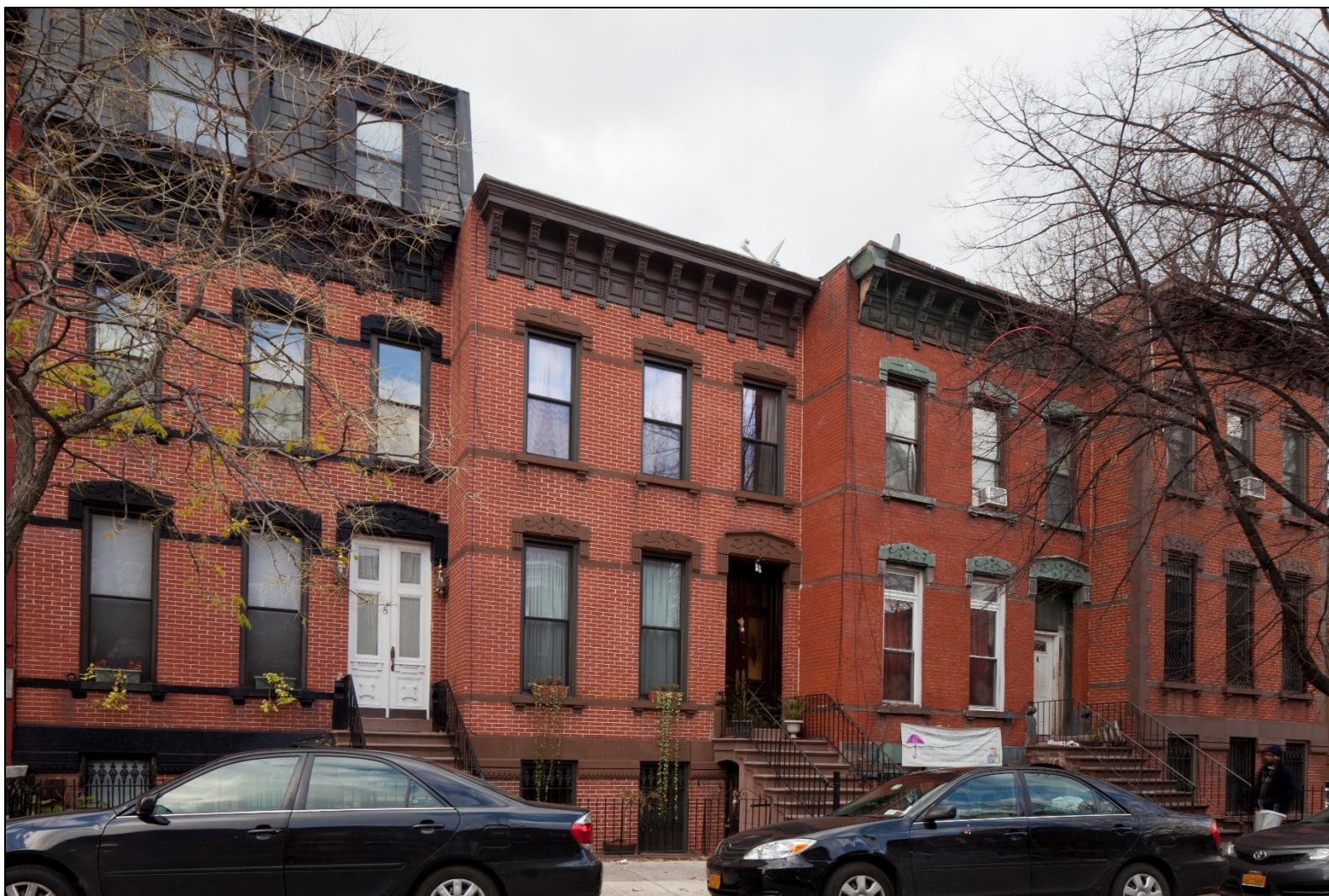
Figure 9 2 to 8 Verona Place (Parfitt Brothers, c. 1880) Photo: Christopher D. Brazee, 2015