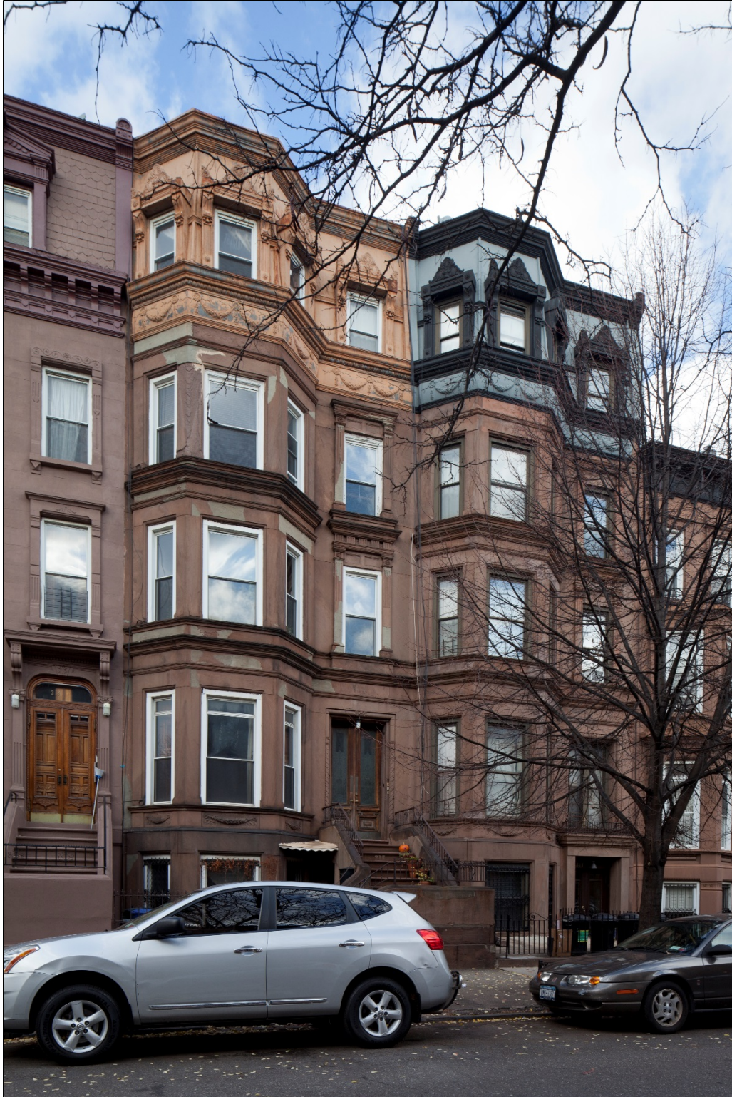
Figure 29 215 and 217 Hancock Street (Frederick B. Langston, c. 1890)