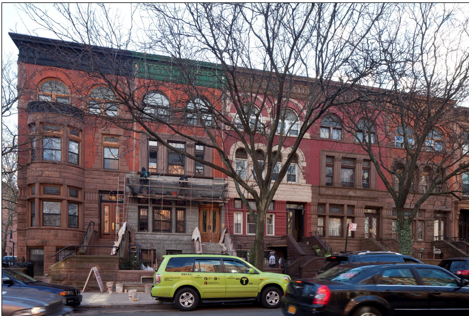
Figure 26 222 to 230 Hancock Street (John L. Young, c. 1889)