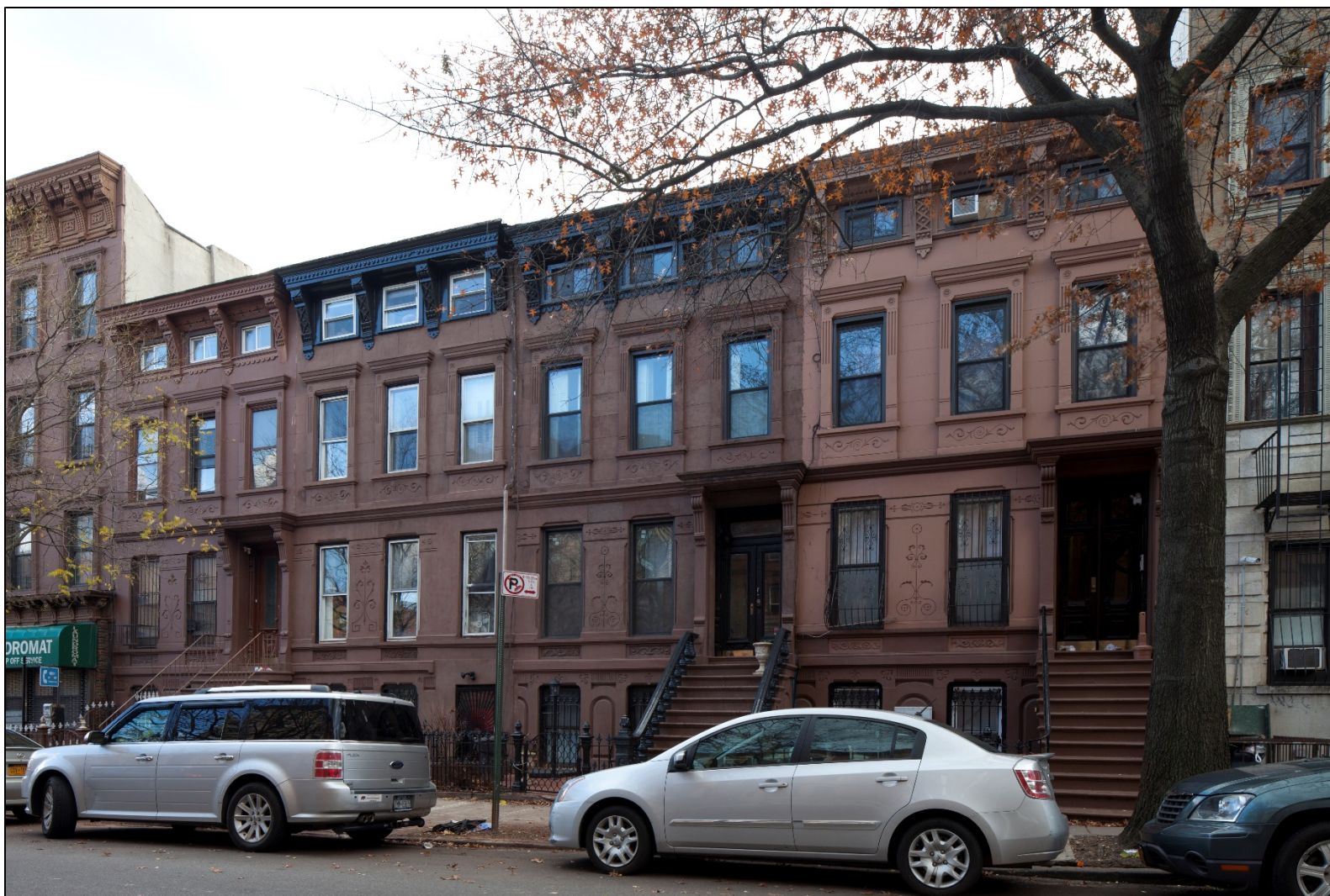
Figure 10 104 to 106 and 108 to 110 Macon Street (Amzi Hill, c. 1886)