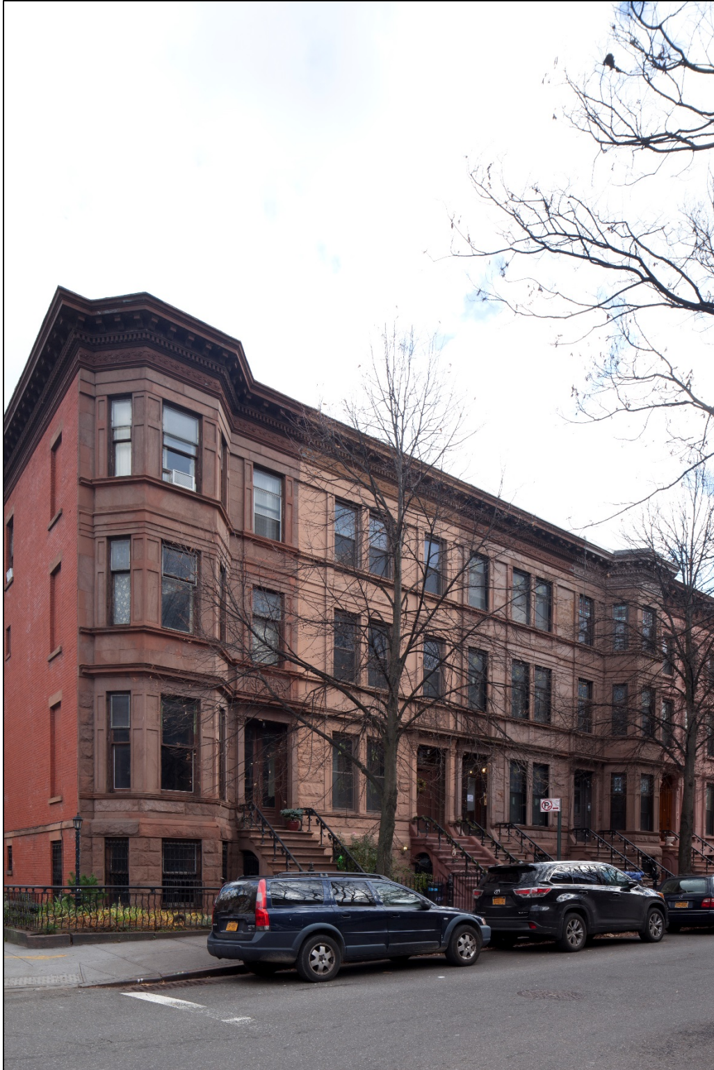
Figure 28 1 to 7 Arlington Place (George P. Chappell, c. 1887)