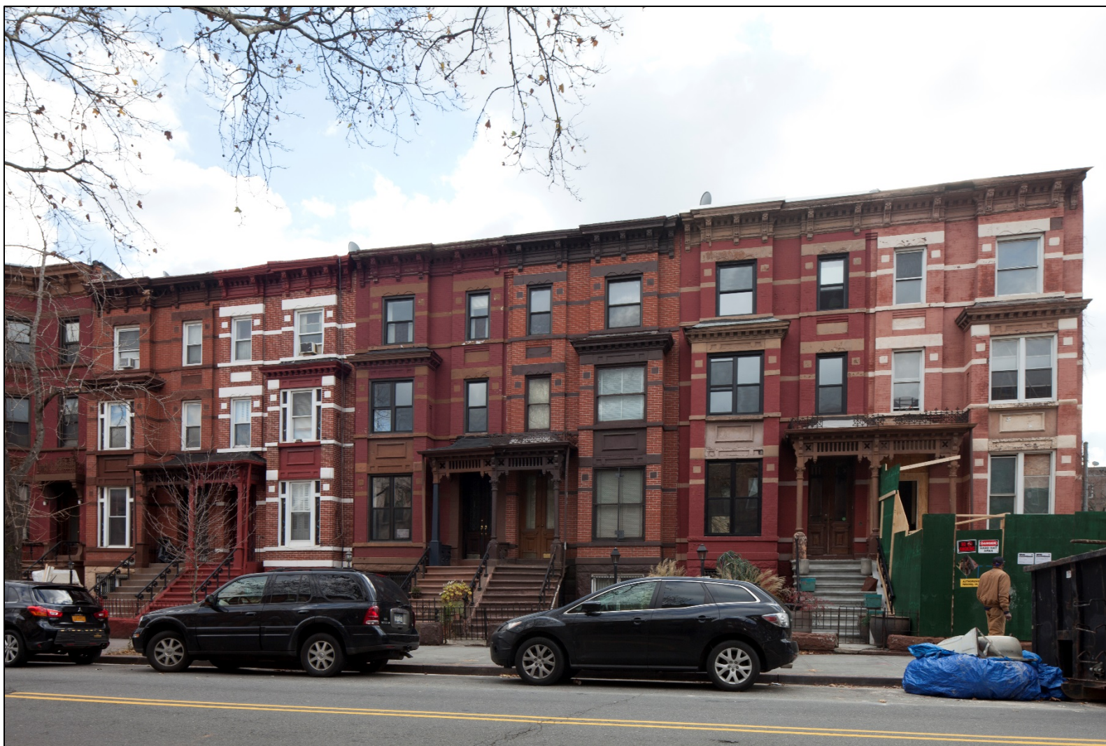
Figure 14 122 to 132 Halsey Street (Amzi Hill, c. 1886) Photo: Christopher D. Brazee, 2015