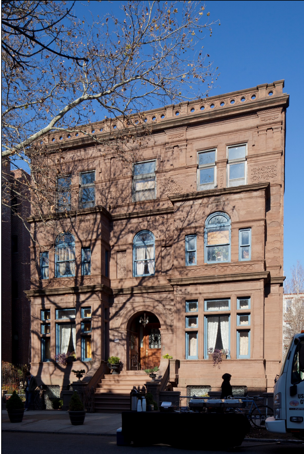
Figure 31 247 Hancock Street (Montrose W. Morris, c. 1887) Photo: Christopher D. Brazee, 2015