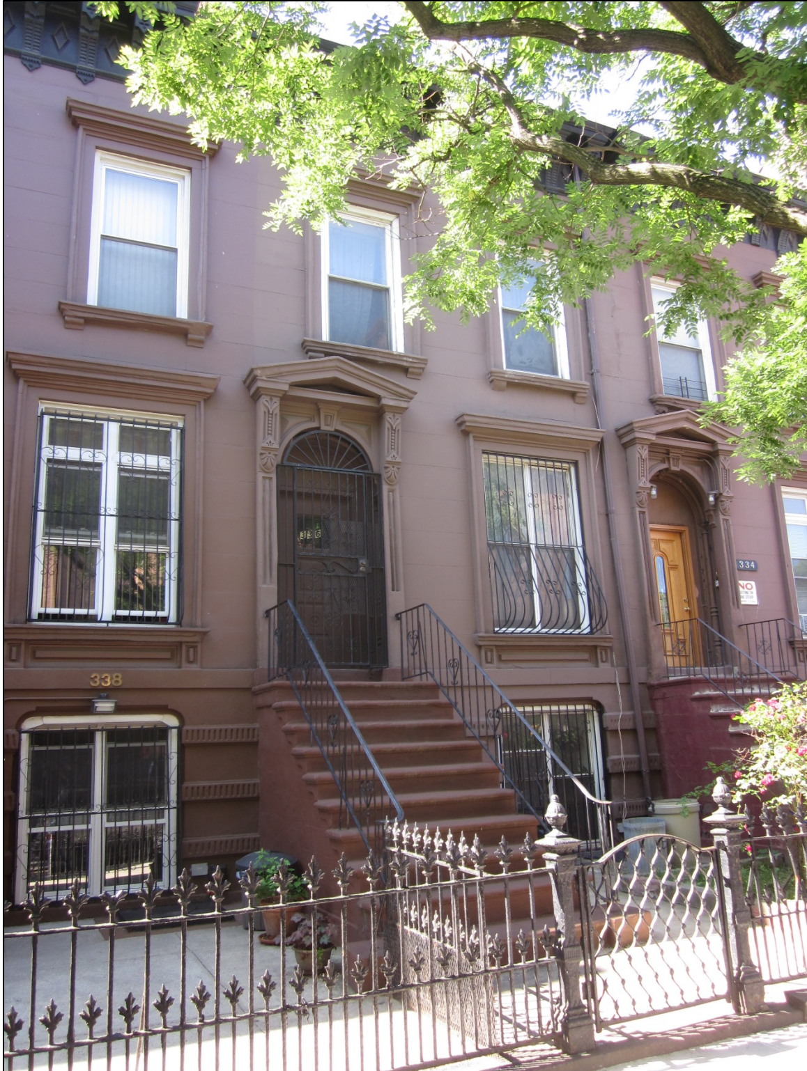
Figure 3 336 Putnam Avenue (Theodore Swimm, c. 1878)