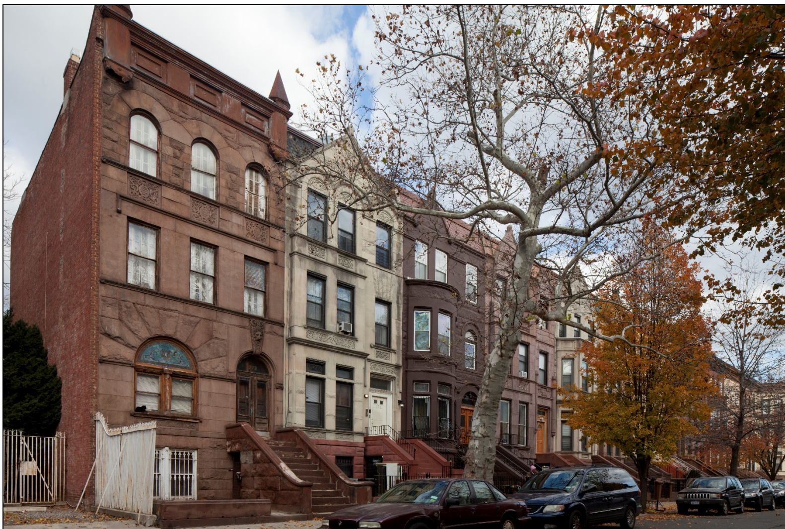
Figure 27 273 to 285 Hancock Street (Isaac D. Reynolds & Son, c. 1890)