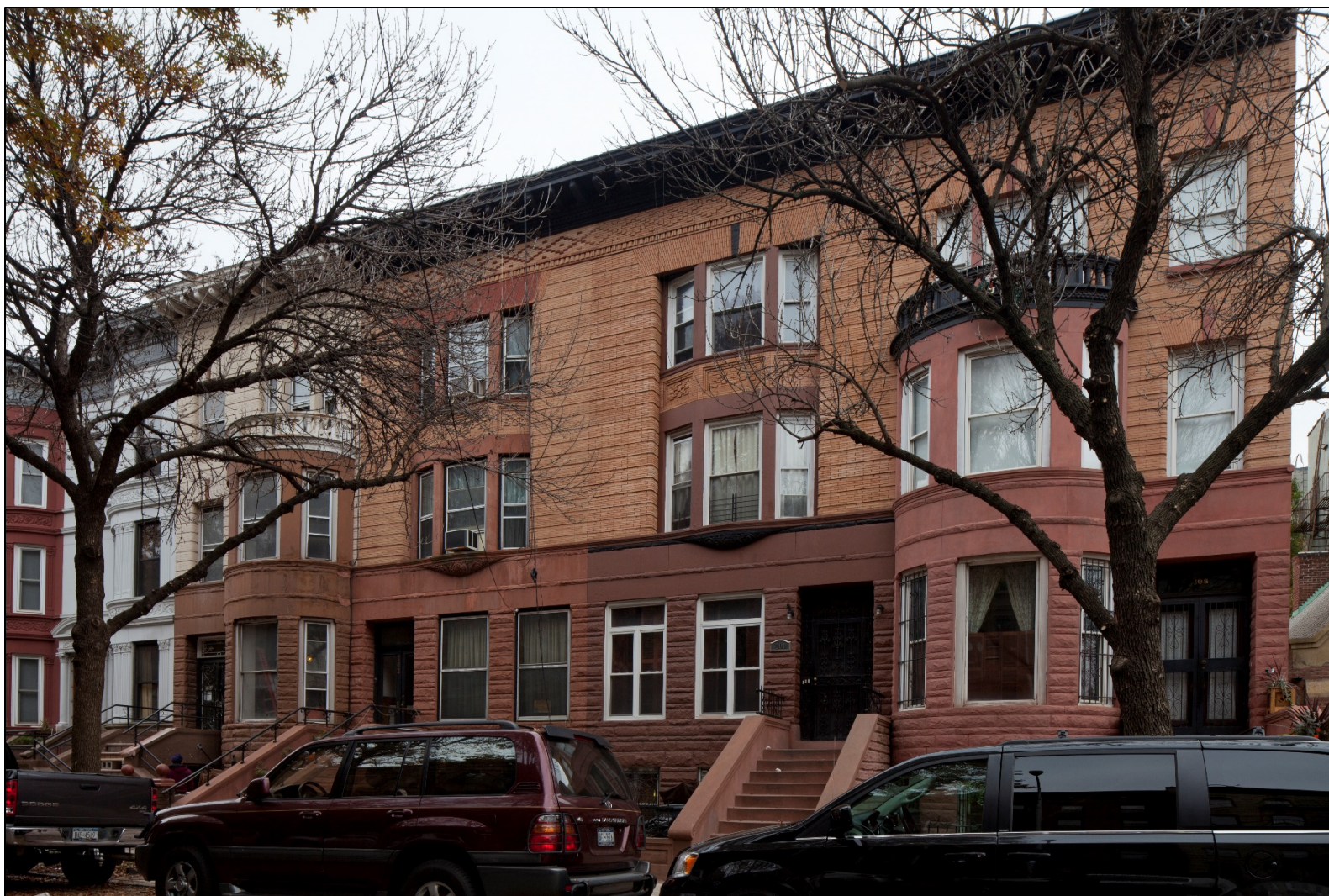
Figure 33 198 to 204 Jefferson Avenue (Montrose W. Morris, c. 1891)