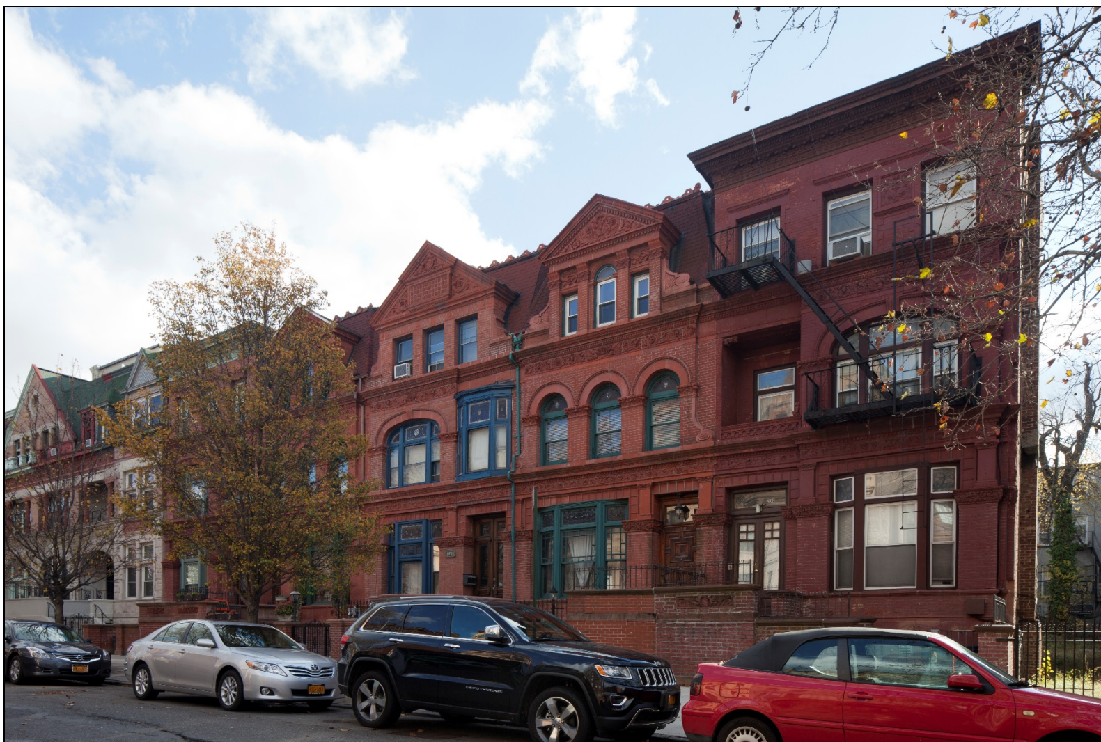
Figure 21 236 to 244 Hancock Street (Montrose W. Morris, c. 1885-86) Photo: Christopher D. Brazee, 2015