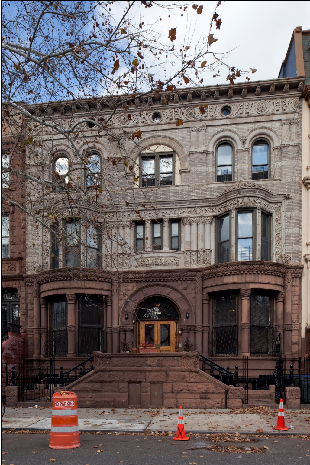
Figure 37 237 Hancock Street (Peter J. Lauritzen, c. 1890) Photo: Christopher D. Brazee, 2015