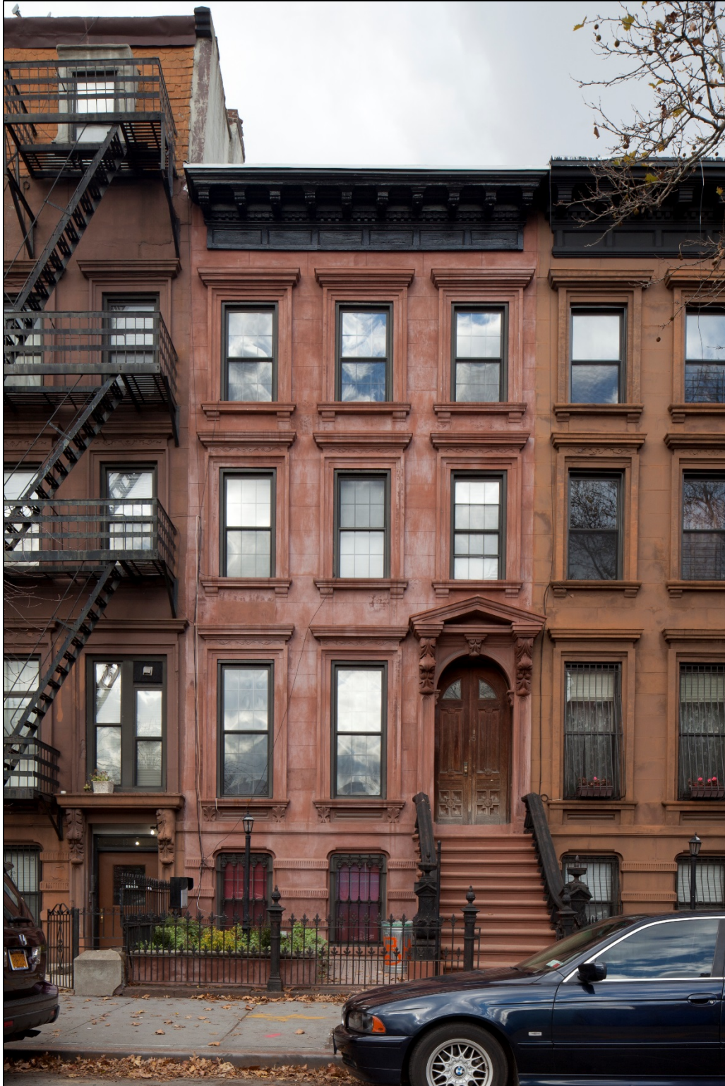
Figure 4 15 Halsey Street (Thomas B. Jackson, c. 1878-79) Photo: Christopher D. Brazee, 2015