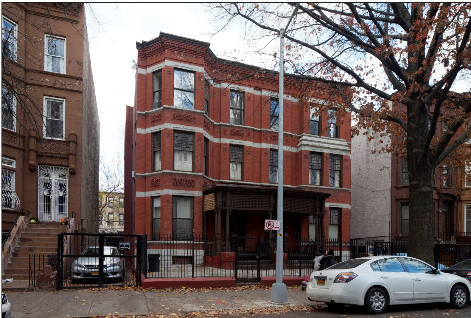
Figure 13 73 and 75 Macon Street (Amzi Hill, c. 1884)