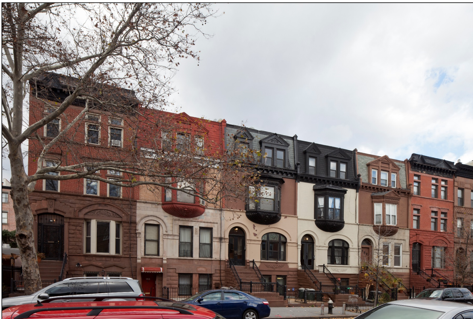
Figure 20 141 to 151 Halsey Street (William H. Burhans, c. 1892) Photo: Christopher D. Brazee, 2015