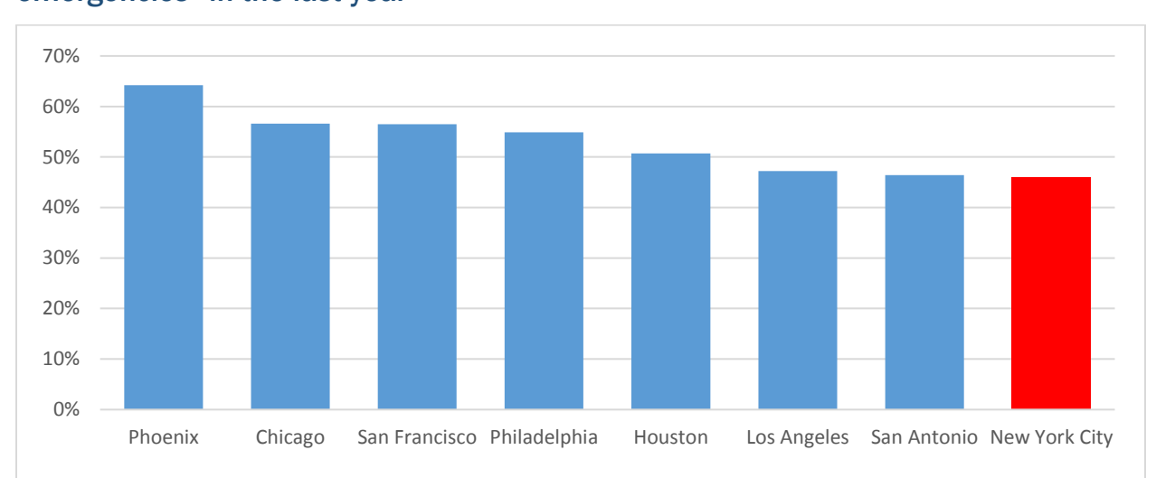
Chart 2: Percentage of residents who saved for "unexpected expenses or emergencies" in the last year

FDIC. "2015 FDIC National Survey of Unbanked and Underbanked Households." October 2016.