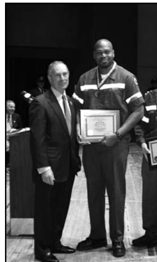
Mayor Bloomberg presents Gold and Silver Medals of Honor.