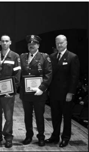
Mayor Bloomberg thanks Bronx 6 Medal recipients.