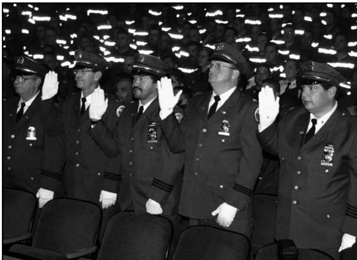
New General Superintendents take official oath of office.