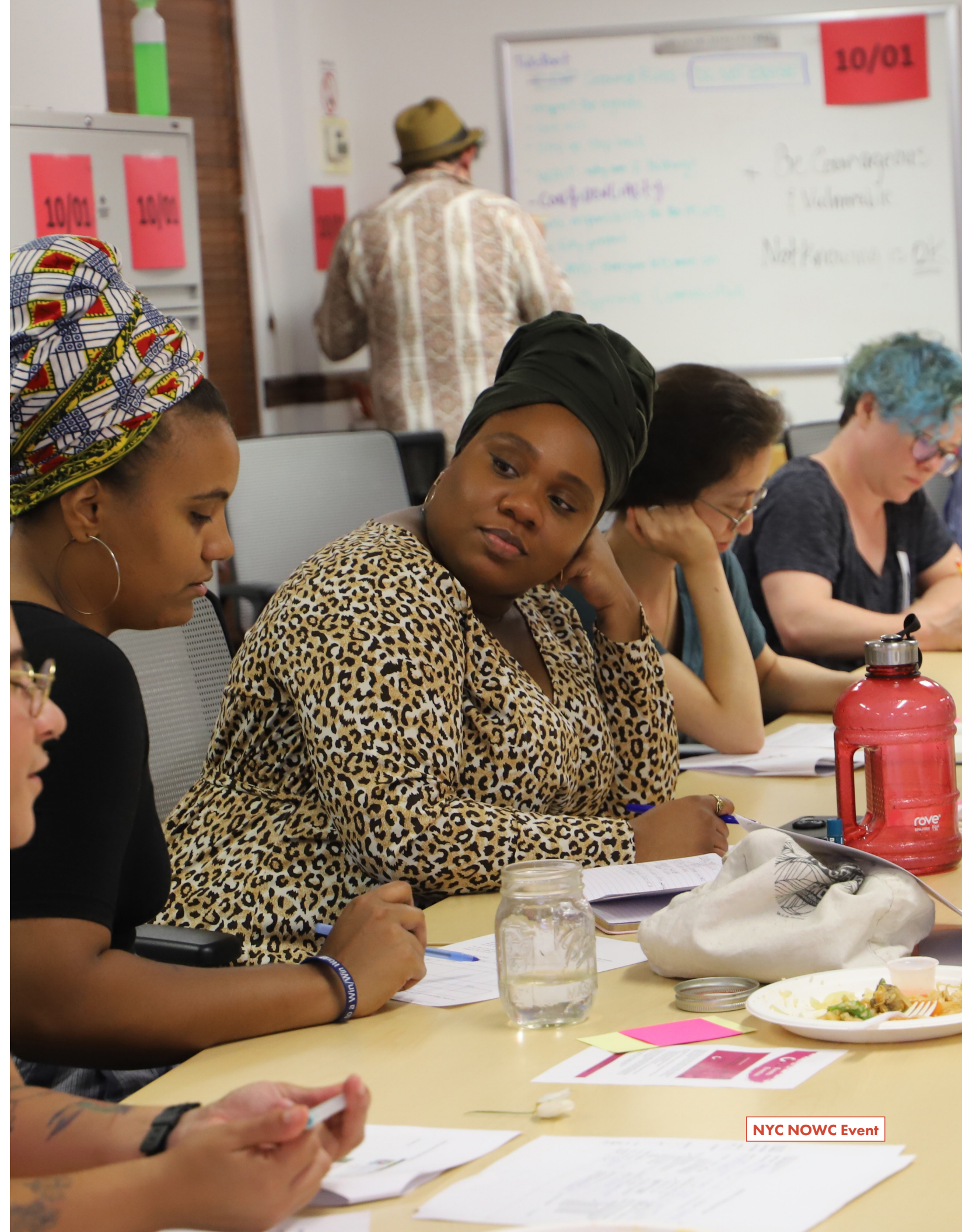
NYC NOWC Event

This is the seventh annual report in the “Working Together” series, which highlights the achievements of this initiative. SBS is committed to helping worker cooperatives thrive in New York City and proud to showcase the work of WCBDI throughout the past fiscal year.