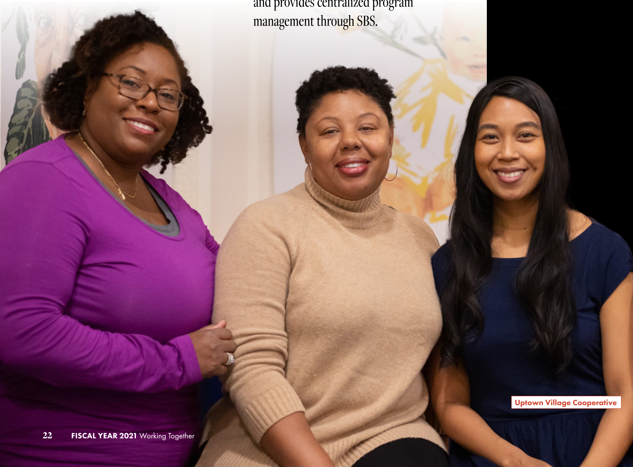
Uptown Village Cooperative

The NYC Council awarded $3.8 million to WCBDI in FY2022 to support worker cooperatives and to invest in worker ownership as a strategy for equitable recovery from COVID-19. This funding supports 13 partner organizations and provides centralized program management through SBS.