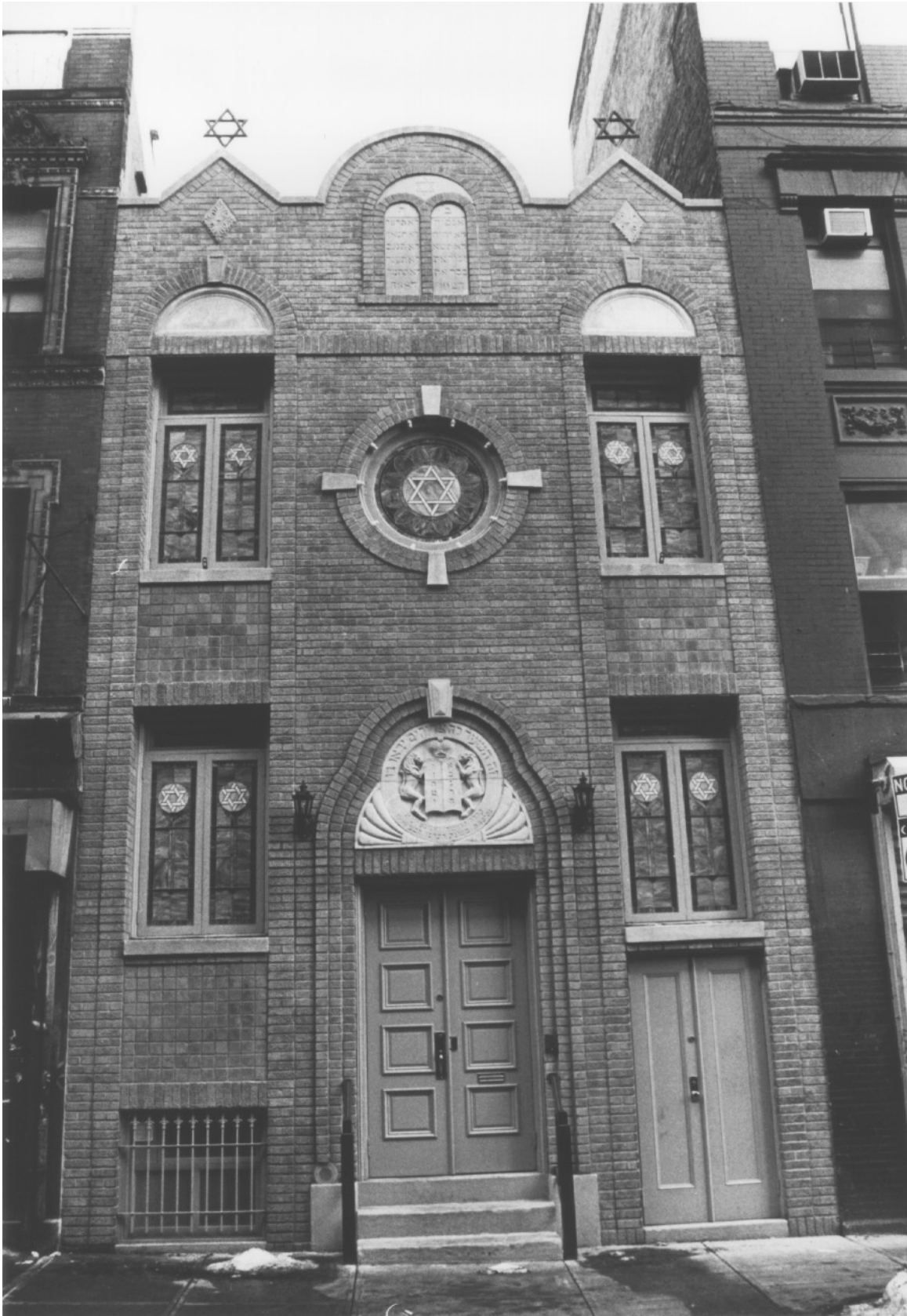
Kehila Kadosha Jaina Synagogue 280 Broome Street Manhattan