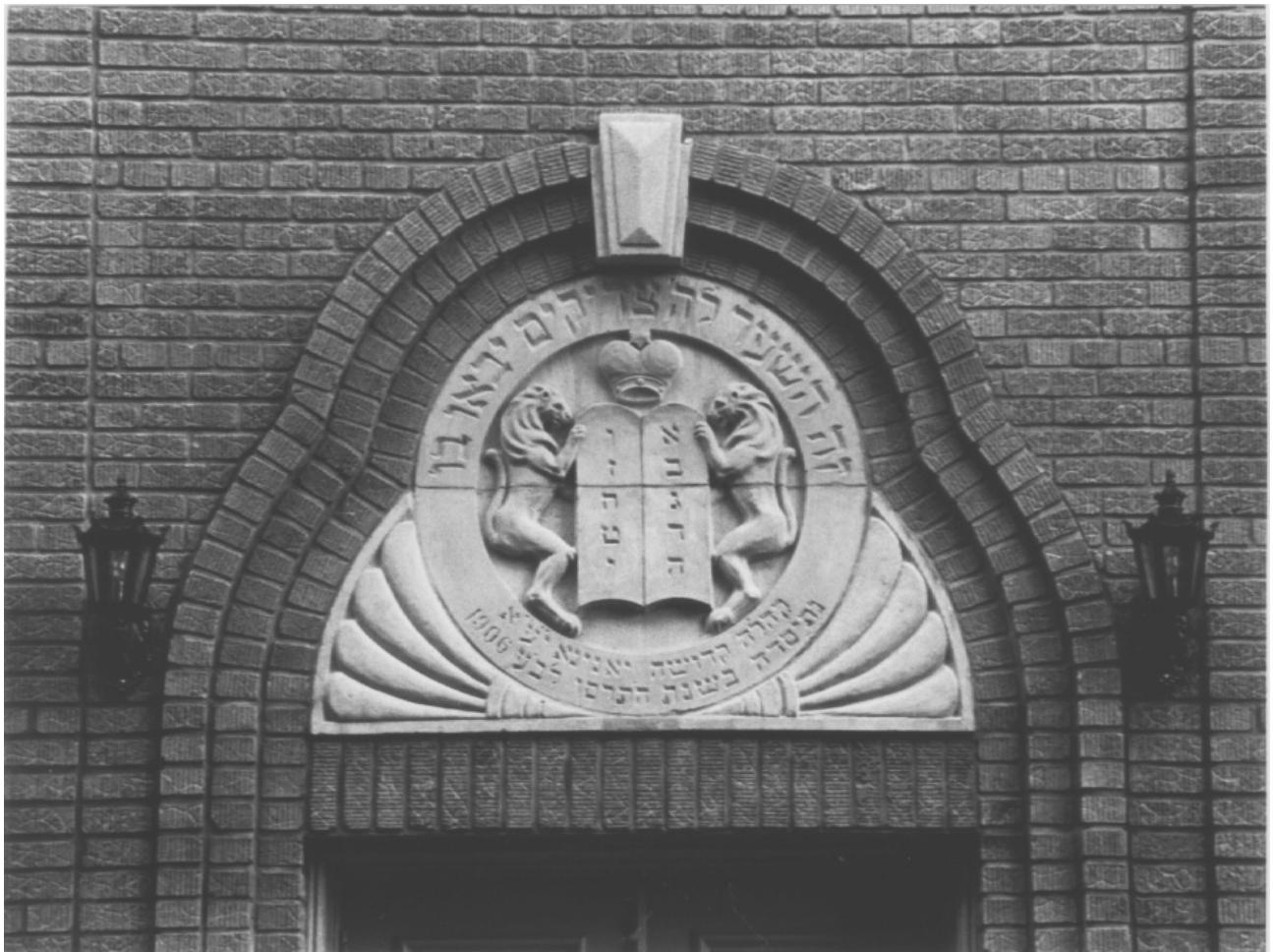
Kehila Kadosha Janina Congregation Decorative Details