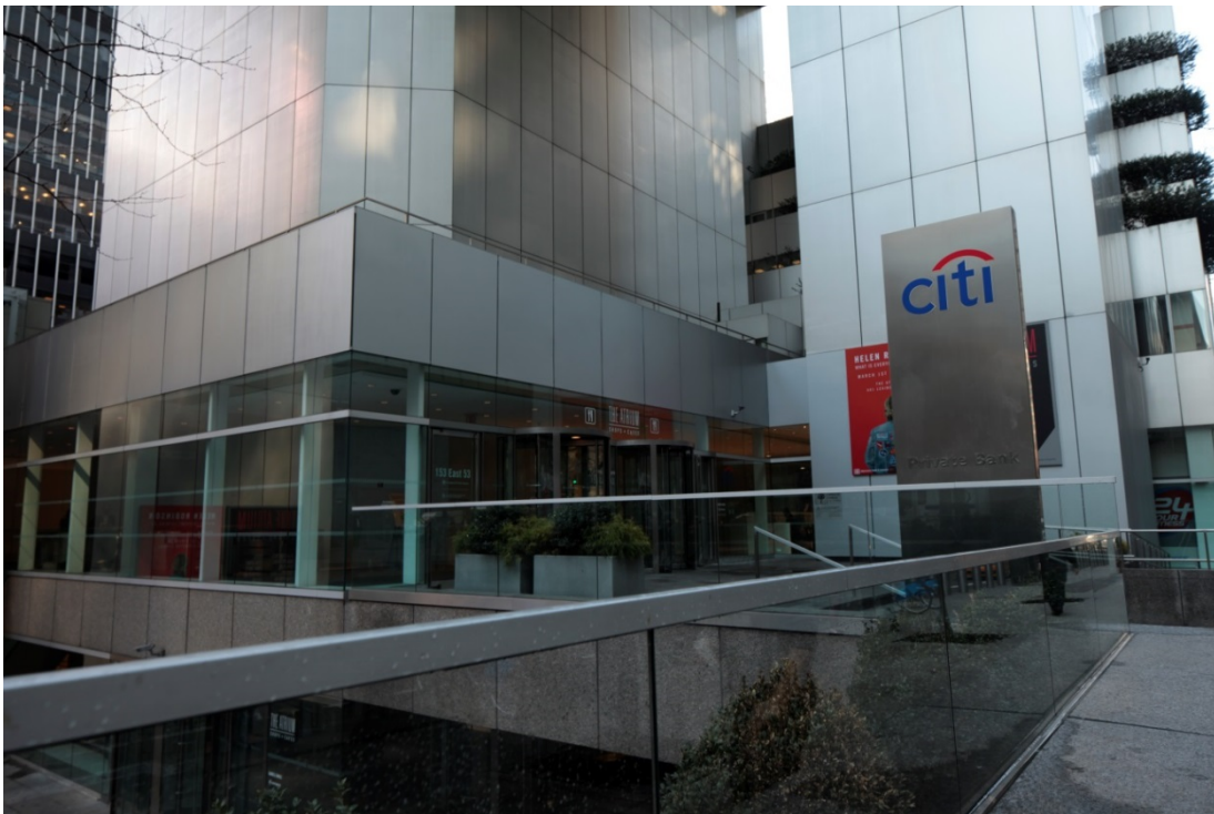
Citicorp Center Sunken plaza and Lexington Avenue entrance pavilion 53 rd Street entrance to office tower Photos: Jenna Adams, 2016