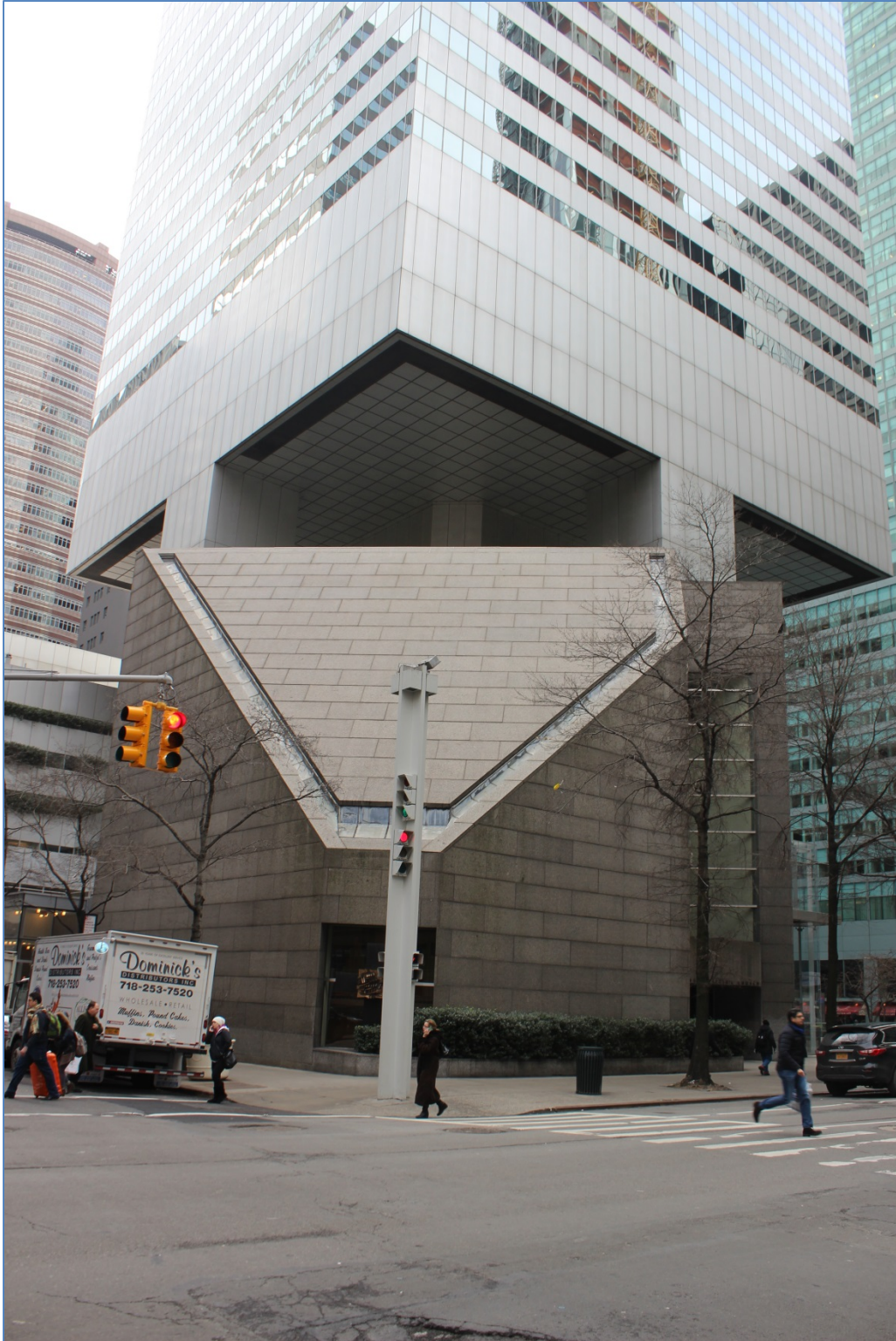
Citicorp Center and Saint Peter's Church Corner of Lexington Avenue and 54 th Street Photo: Matthew A. Postal, 2016