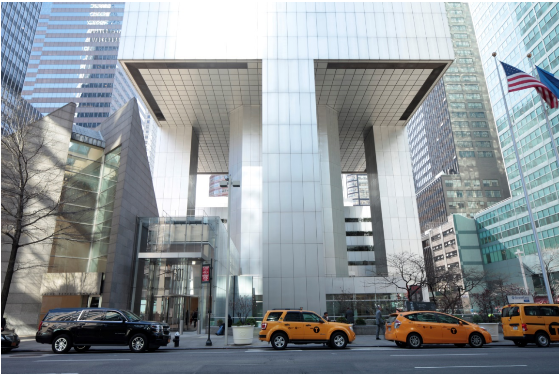
West part of 54 th Street, including Saint Peter's Church Lexington Avenue block front