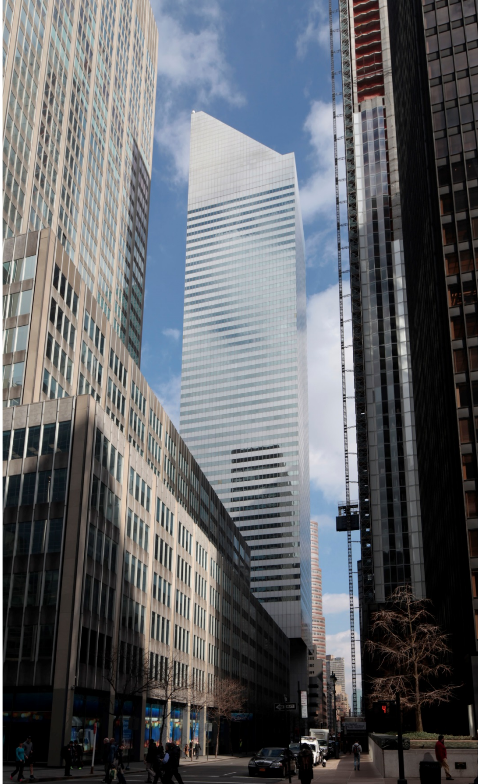
Citicorp Center (now 601 Lexington Avenue), including Saint Peter's Church Borough of Manhattan Tax Map Block 1308, Lot 7501 (1001, 1002, 1005) Office tower, west facade, viewed from Park Avenue and 53 rd Street