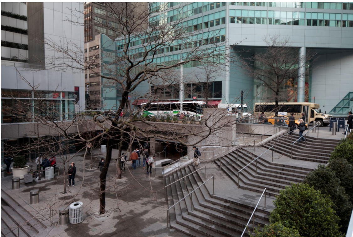
Citicorp Center West facade of office tower Sunken plaza and entrance to subway