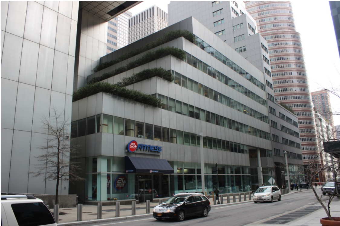
Citicorp Center View north from 53 rd Street towards Saint Peter's Church Market Building, East 53 rd Street, view east