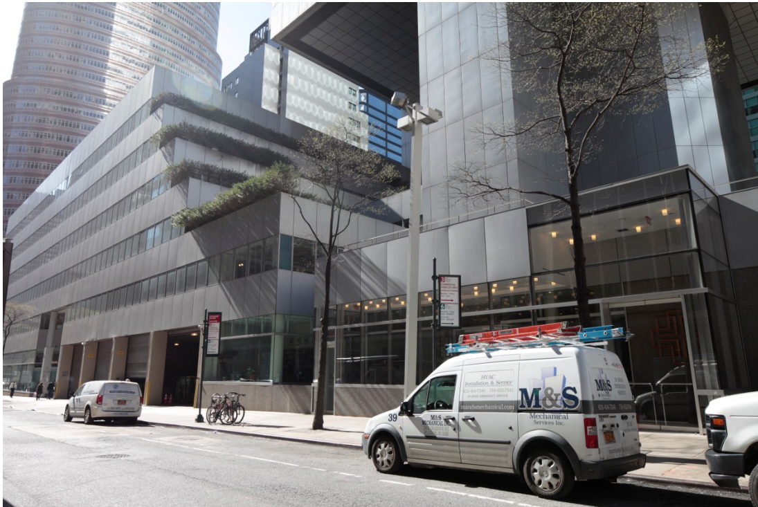
Citicorp Center Third Avenue facade at corner of 54 th Street Market Building and entrance to Saint Peter's Church, 54 th Street