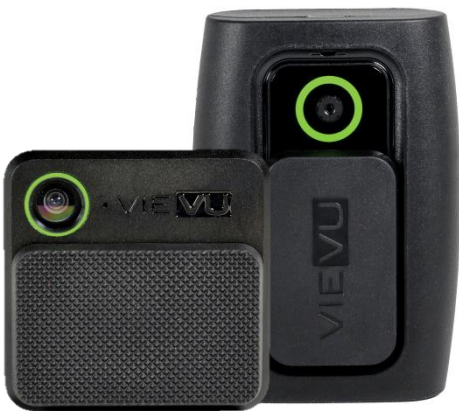
Body Worn Video Cameras