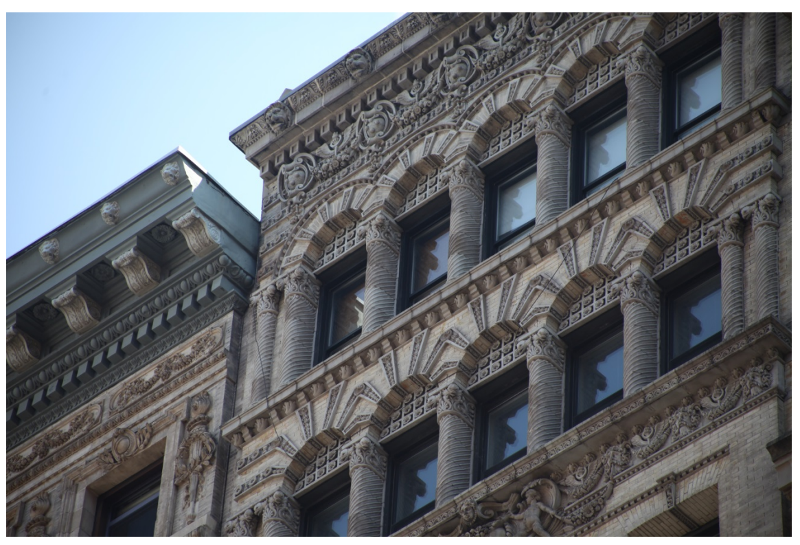
830 Broadway Building, details at upper stories and cornice Jessica Baldwin, August 2018