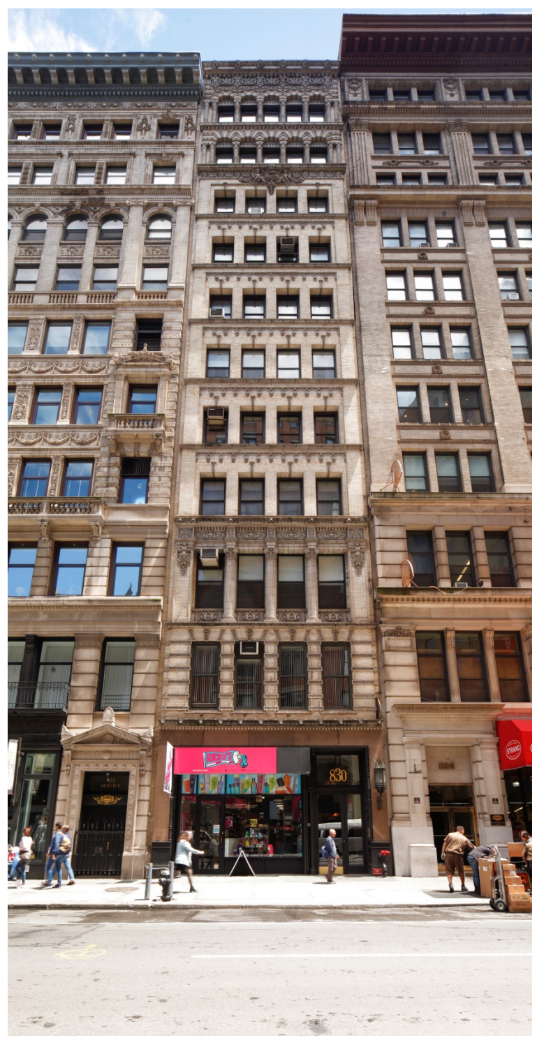
830 Broadway Building, 830 Broadway Sarah Moses, June 2019