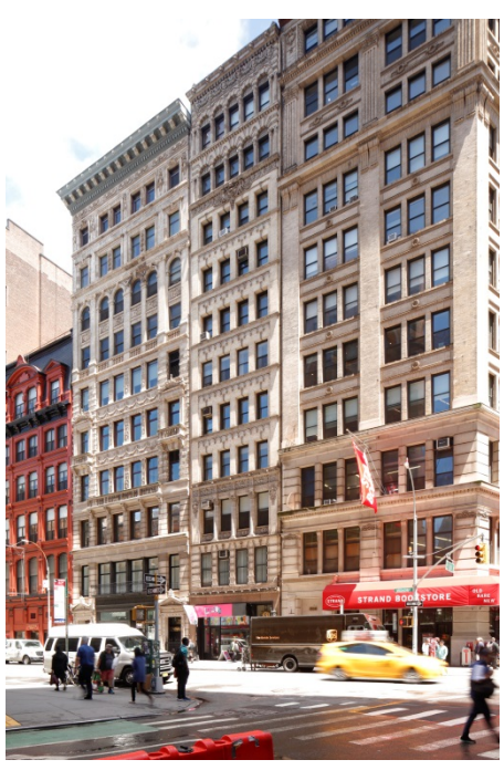
830 Broadway Building Sarah Moses, June 2019