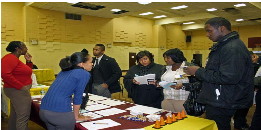
NYCHA residents learn about job training and placement services at a NYCHA Jobs-Plus site

The City sponsored two additional Jobs Plus sites: the first is located at Jefferson Houses (Manhattan); and the second, soon to be open, will serve a cluster of public housing developments located in the Mott Haven neighborhood of the Bronx.