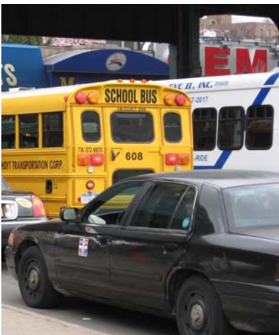
Livery cab waits for passengers at Hugh Grant Circle in the Bronx

The Administration looks forward to working closely with the New York City Council to see this plan implemented, so that New Yorkers -- ALL New Yorkers -- can get where they are going safely and conveniently!