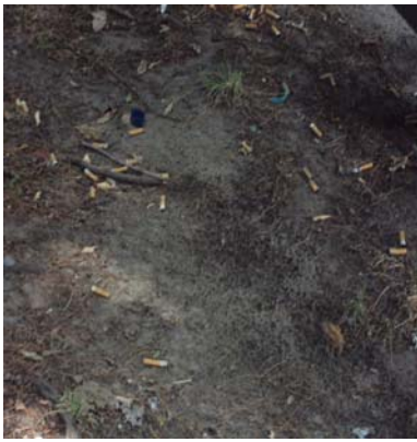
Cigarette butts found during survey of Parks litter