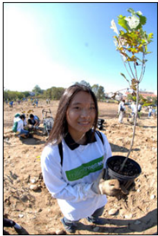
A volunteer plants a tree on It's My Park! Day.

The Mayor's Fund and NYRP are also seeking critical financial and in-kind support from individuals, corporations and foundations for tree planting, stewardship and education programs. To donate to this significant greening effort, visit the MillionTreesNYC website or contact the Mayor's Fund.