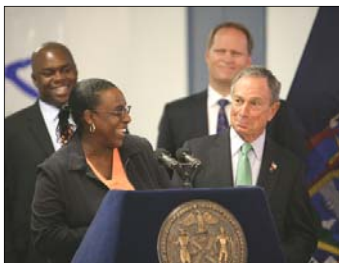
Mayor Bloomberg and community partners welcome newly enrolled Opportunity NYC participants.