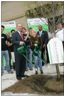
Mayor Bloomberg and Bette Midler plant the first of one million trees.

We would like to thank everyone who contributed and attended this special event for a great cause, helping to provide critical support services for victims of domestic violence. For more information on Fete de Swifty or the Family Justice Initiative, please visit www.nyc.gov/fund .