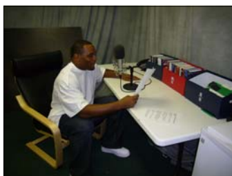
Victor Hobson of the New York Jets encourages New Yorkers to take advantage of the City's free after-school programs.

For general NYC information call 311 or visit www.nyc.gov