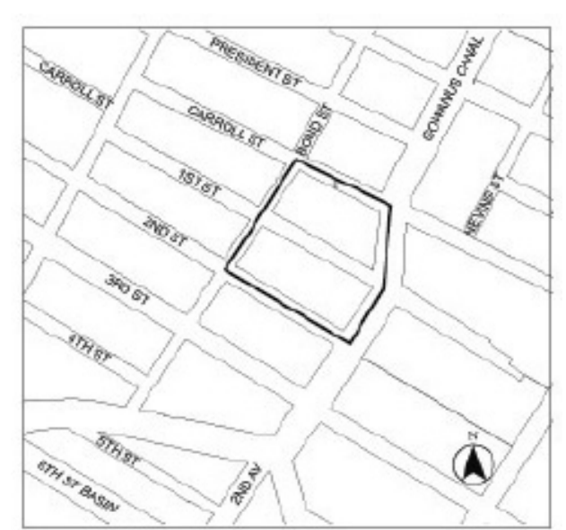
Map 14. Portion of Community District 6, Brooklyn

<u>(i)</u> In Community District 6, in the Borough of Brooklyn, in the R7-2 District within the areas shown on the following Map 14: