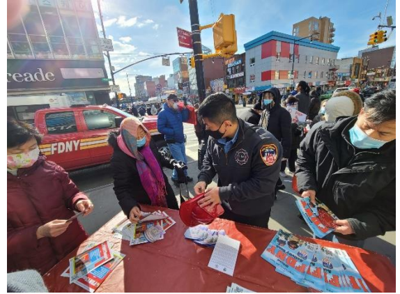
Fatal Fire Outreach in Flushing, Queens