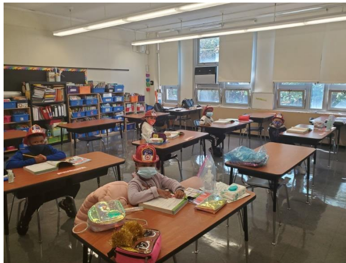
Virtual Fire Prevention Week 2020