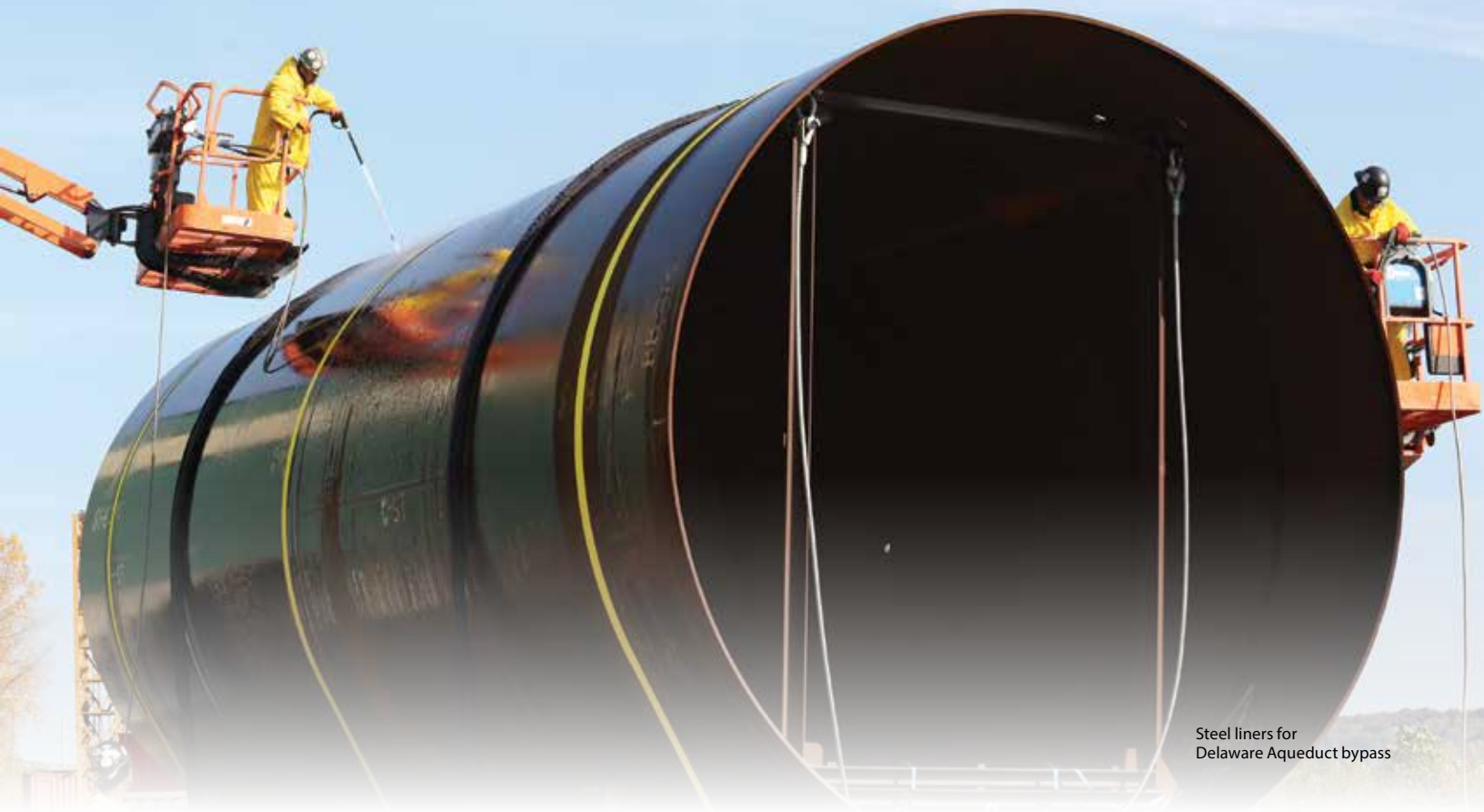
Steel liners for Delaware Aqueduct bypass