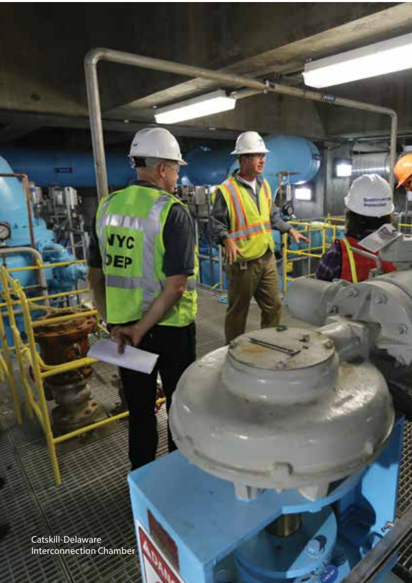
Catskill-Delaware Interconnection Chamber

Engineers envisioned a connection between the two aqueducts when they built the Delaware System in the 1940s. In fact, the east wall of the valve chamber at Delaware Aqueduct Shaft 4 was constructed with four arched openings – each temporarily closed by brick walls – that could one day allow pipes to be installed to move Delaware water into the Catskill Aqueduct. The new interconnection is one of several facilities that provide DEP with the flexibility to convey the best drinking water from different parts of its upstate reservoir system each day.