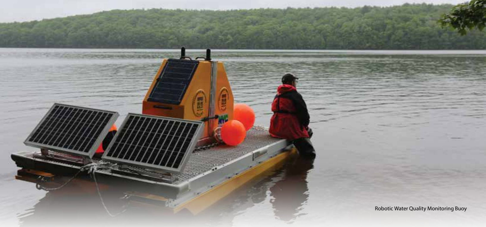
Robotic Water Quality Monitoring Buoy