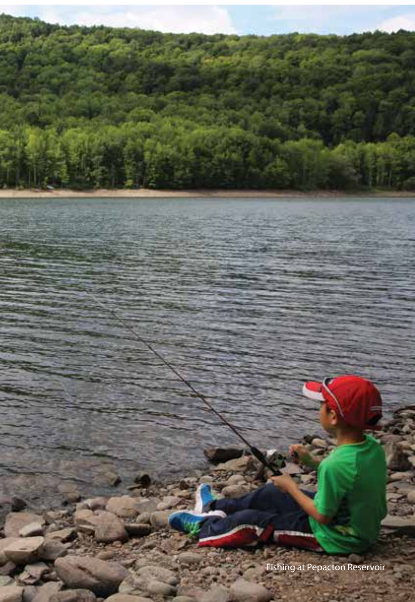
Fishing at Pepacton Reservoir

💧 Partnership Programs – Many of New York City's watershed protection programs west of the Hudson River are administered by the Catskill Watershed Corporation, a nonprofit organization. Together, DEP and the Catskill Watershed Corporation have repaired or replaced more than 5,125 failing septic systems and authorized the construction of more than 70 storm-water control measures on properties in the watershed. New York City has also made available more than $170 million for new community wastewater projects. When these projects are completed, they will be capable of treating nearly 1.6 million gallons of wastewater per day. Another DEP partnership program is the stream management program, which encourages the stewardship of streams and floodplains in the watershed west of the Hudson River. Additionally, the watershed agricultural program and watershed forestry program both represent long-term successful partnerships between DEP and the nonprofit Watershed Agricultural Council. The underlying goal of both programs is to support and maintain well-managed family farms and working forests as beneficial land uses for water quality protection and rural economic viability. Together, these partnerships work with watershed residents to identify and eliminate potential pollution sources.