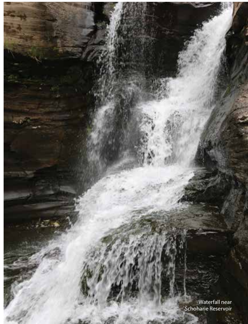
Waterfall near Schoharie Reservoir

sensitive lands around our reservoirs and their headwaters, upgraded dozens of wastewater treatment and collection systems throughout the watershed, replaced more than 5,000 residential septic systems, restored about 40 miles of streambanks and floodplains, installed thousands of best management practices to improve the quality of runoff from local farms, and reviewed thousands of building projects to ensure their plans are compatible with protecting water quality. This work has been done through a number of invaluable partnerships with locally-based organizations that have administered many of the core watershed protection programs over the past 25 years. These include the Catskill Watershed Corporation, the Watershed Agricultural Council, county Soil and Water Conservation Districts, and other partners who bring a local voice and great skill to the implementation of the programs. In December 2016, DEP submitted a new 10-year plan for source water protection to NYSDOH. The City expects to renew its FAD in 2017. More information on DEP's watershed protection programs, can be found at www.nyc.gov/html/dep/html/watershed_protection/fad.shtml .