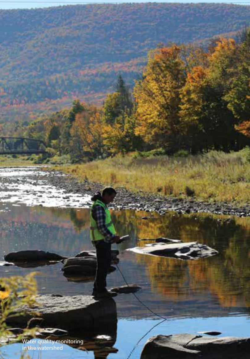
Water quality monitoring in the watershed