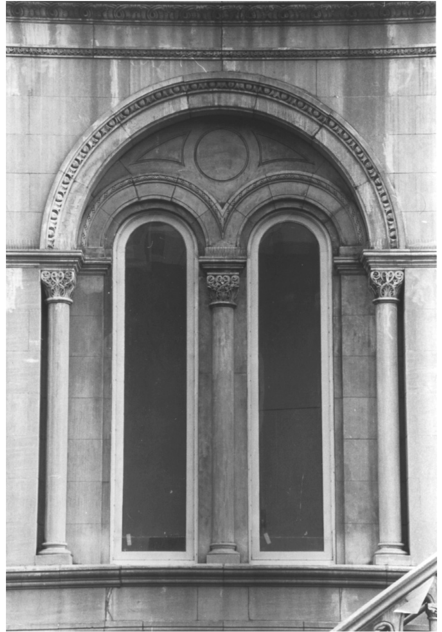
Pike Street Synagogue, window details