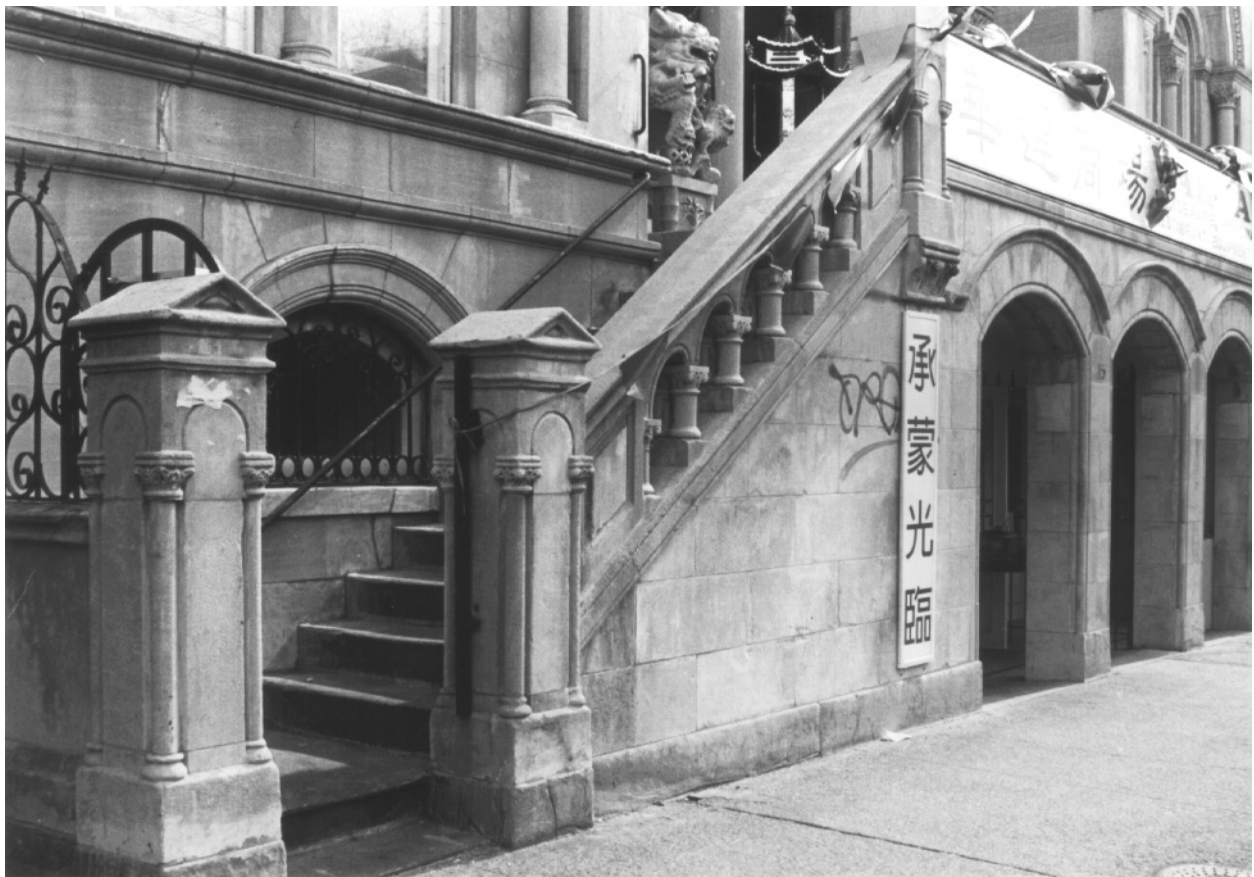
Pike Street Synagogue, stair detail