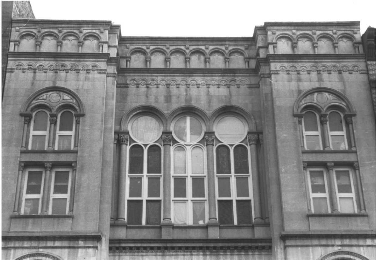
Pike Street Synagogue, upper stories