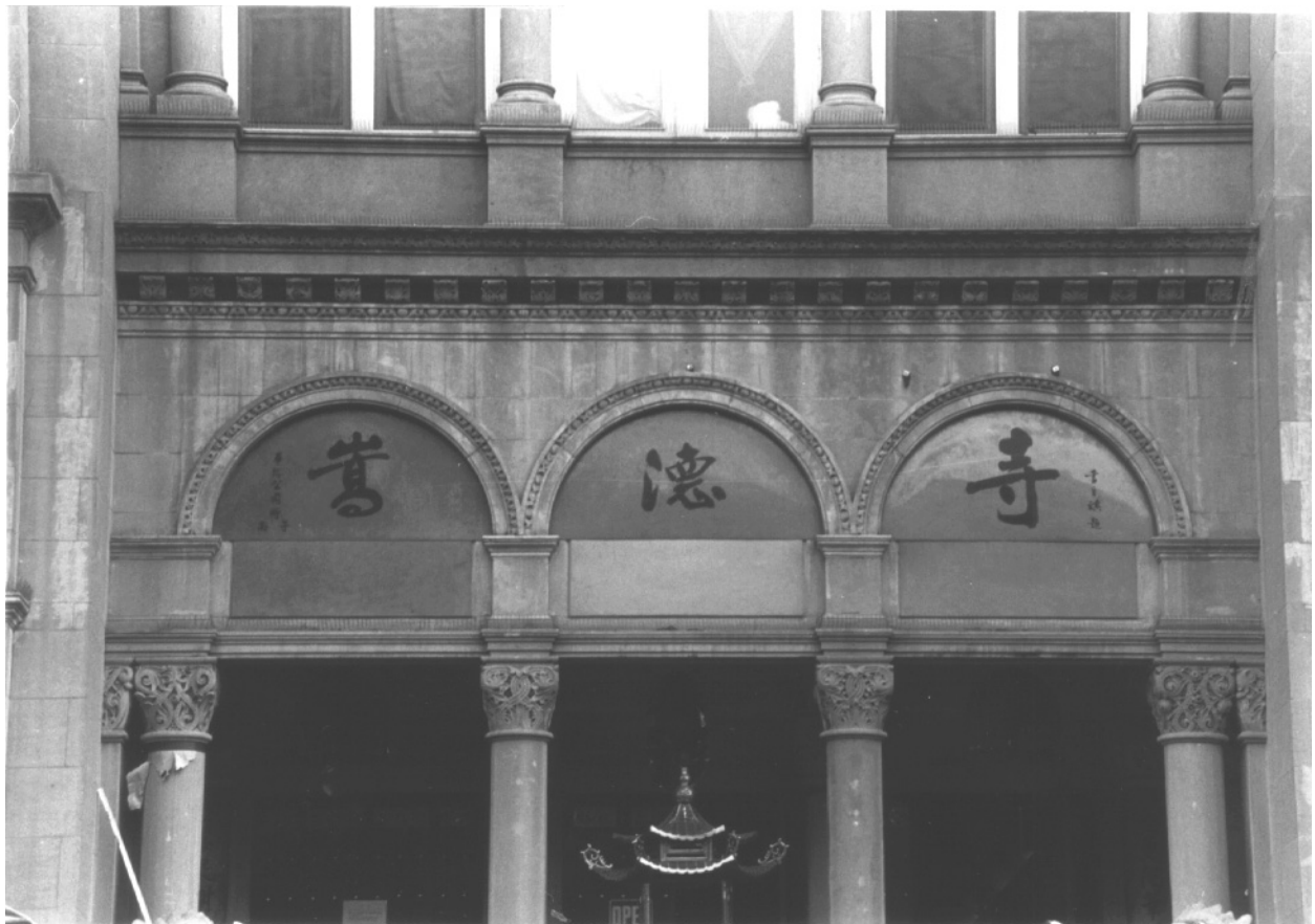
Pike Street Synagogue, entrance detail