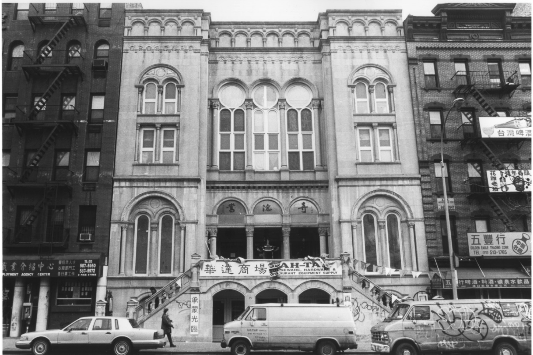
Pike Street Synagogue, 13-15 Pike Street, Manhattan