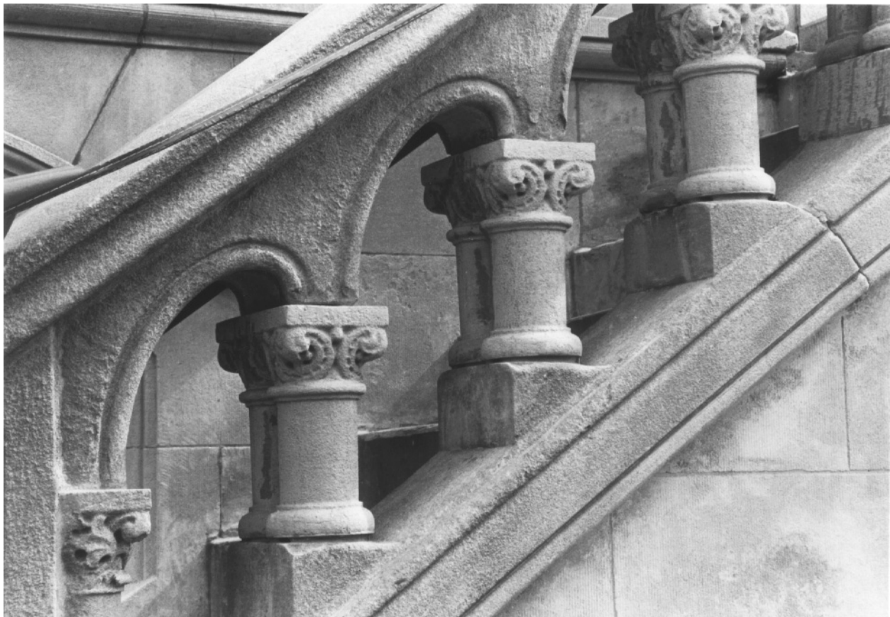
Pike Street Synagogue, stair detail