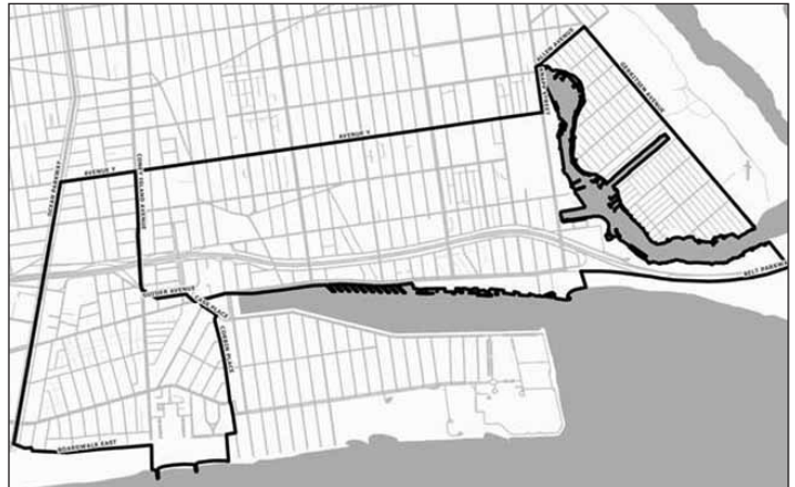
Map 2 Neighborhood Recovery Areas in Brooklyn Community Districts 13 and 15