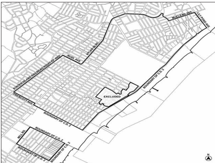
Map 7 Neighborhood Recovery Areas in Staten Island Community District 2

Areas designated by New York State as part of the NYS Enhanced Buyout Area Program are excluded from the neighborhood recovery areas and are designated on this map as "Excluded"