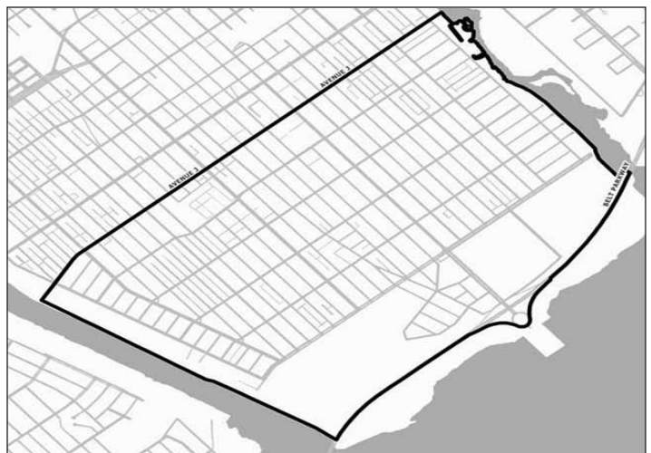
Map 3 Neighborhood Recovery Area in Brooklyn Community District 18