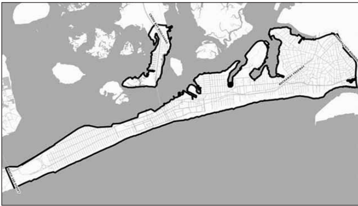
Map 6 Neighborhood Recovery Area in Queens Community District 14