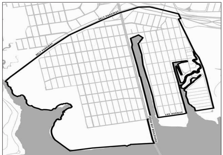
Map 4 Neighborhood Recovery Area in Queens Community District 10