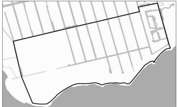
Map 9 Neighborhood Recovery Areas in Staten Island Community District 3 (2 of 2)

YVETTE V. GRUEL, Calendar Officer City Planning Commission 22 Reade Street, Room 2E, New York, NY 10007 Telephone (212) 720-3370