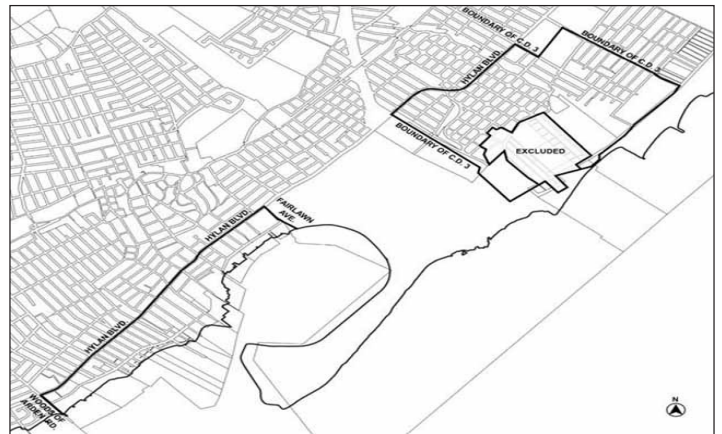
Map 8 Neighborhood Recovery Area in Staten Island Community District 3 (1 of 2)

Areas designated by New York State as part of the NYS Enhanced Buyout Area Program are excluded from the neighborhood recovery areas and are designated on this map as "Excluded"