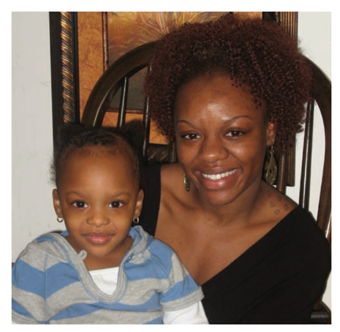
Nurse-Family Partnership mother and daughter

effects that are significant, we would expect that, at best, they will only modestly reduce child poverty. In part, this is because the noncustodial fathers of unmarried mothers tend to have poor labor market prospects and low annual earnings, so even if these parents marry they are much more likely to be poor than currently married couples. Young children and their families are the second CEO target population.