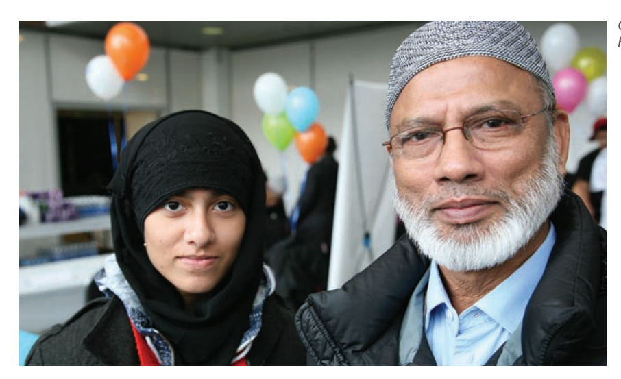
Opportunity NYC: Family Rewards participants