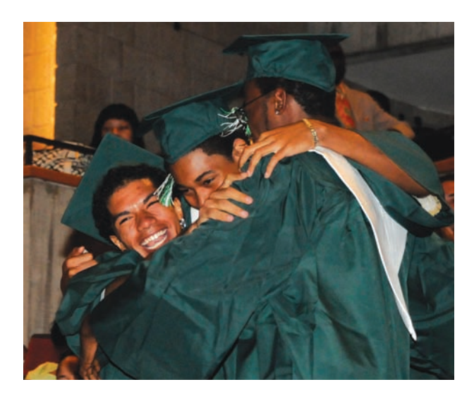
CUNY Prep students at graduation

"I now realize that I have to do what I have to do in school in order to give my girlfriend and daughter the best life that I can. I know that all I have to do is to stay in school, work towards getting my GED and find a job, so they can enjoy their life with me. The last time I was in jail, I realized how much I needed my daughter and girlfriend in my life, in fact I need them more than they need me. Staying in school will help me in the future, not jail! School will ensure a better life for me and my family. [The program] has shown me a better way to solve my problems, like thinking about my daughter before I react to stress. The first step is getting my GED."