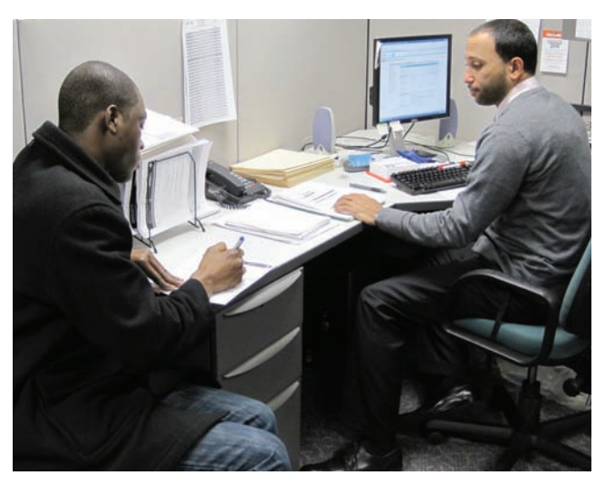
Advance at Work job coach advising program participant

Evaluation Westat conducted an outcome evaluation of several CEO/SBS programs using administrative data. The research looked specifically at three programs – Advance at Work, Community Partners, and the Workforce1 Transportation Center – and compared the programs to