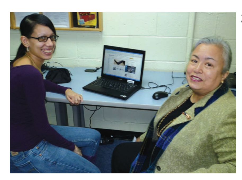
Residents of Thomas Jefferson Houses at the Jobs-Plus office

In New York City, the new measure is being used in the strategic planning of the many City agencies whose work addresses the needs of low-income New Yorkers. For example, the new measure revealed a much higher elderly poverty rate than previously known, so the Center is now working with the Department for the Aging and the Human Resources Administration to find opportunities to reduce senior poverty.