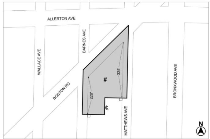
Mandatory Inclusionary Housing Program Area see Section 23-154(d)(3) Area # - [date of adoption] MIH Program Option 1 and Option 2

Portion of Community District 11, The Bronx