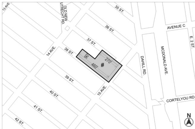
Mandatory Inclusionary Housing Area see Section 23-154(d)(3) Area # – [date of adoption] — MIH Program Option 1 and Option 2

Portion of Community District 12, Brooklyn