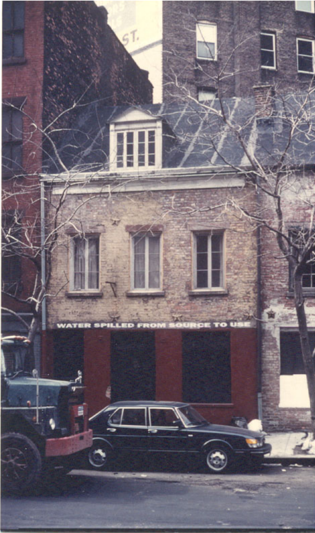
486 Greenwich Street House, Manhattan