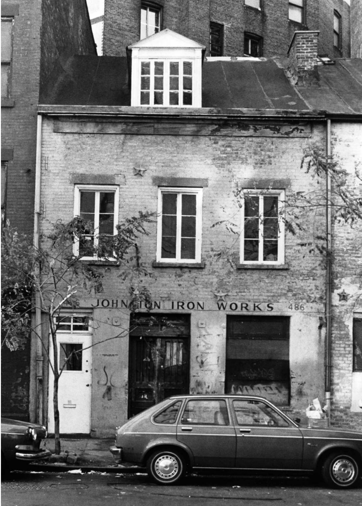
486 Greenwich Street House, Manhattan (c. 1981)