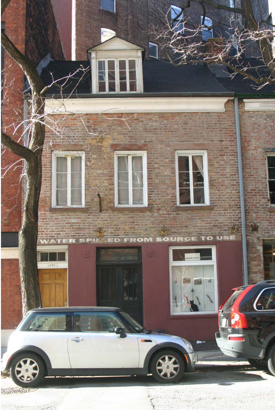
486 Greenwich Street House, Manhattan