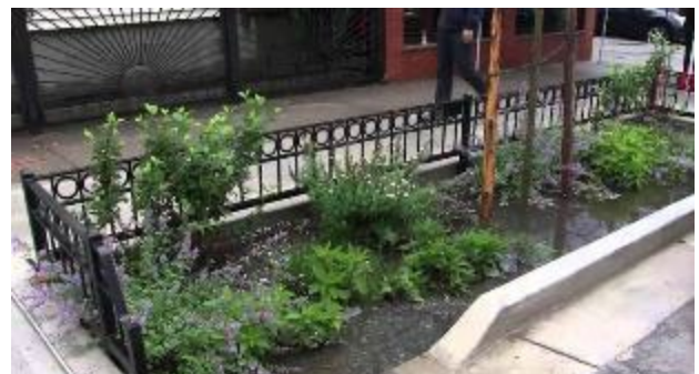
Curbside Rain Garden (Bioswale)

DEP has initially focused primarily on the Area-wide right-of-way contracts building curbside rain gardens, infiltration basins, Stormwater Greenstreets, and porous paving. DEP's standardized designs and procedures have been critical to supporting the systematic implementation of green infrastructure at a wide scale. DEP expects to continue green infrastructure implementation using an expanded array of tools. While right-of-way implementation has been the greatest focus of the first decade of the Program, DEP is making significant advancements into other implementation areas as well,