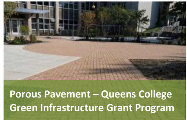
Porous Pavement – Queens College Green Infrastructure Grant Program