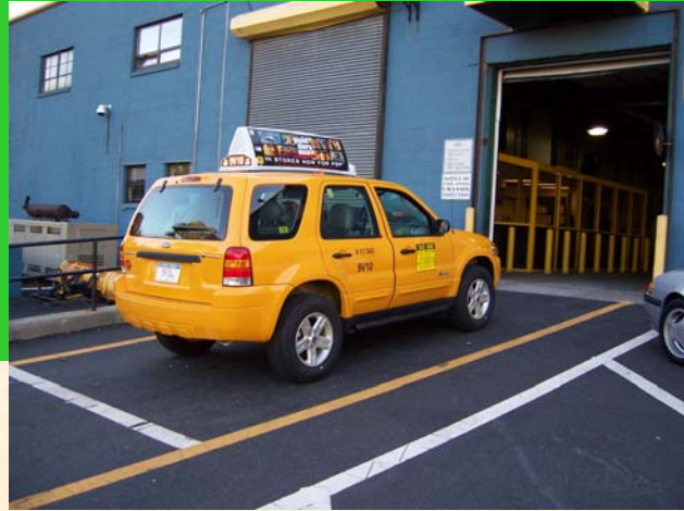
A Ford Escape hybrid-electric taxicab is ready for inspection at the TLC's state-of-the art facility in Woodside, Queens.