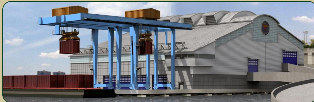
Land Side View

*Translation services may be available upon request. Please call the NYC SWMP Hotline for more information.