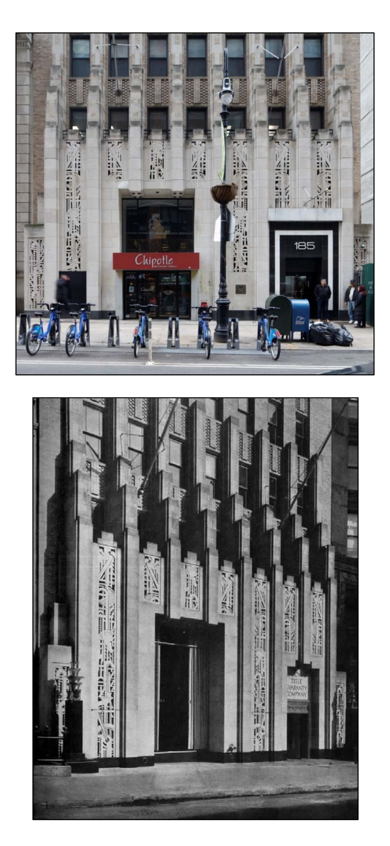
National Title Guaranty Company Building detail Photos: Sarah Moses, 2017 (top); The American Architect (May 1930) (bottom)