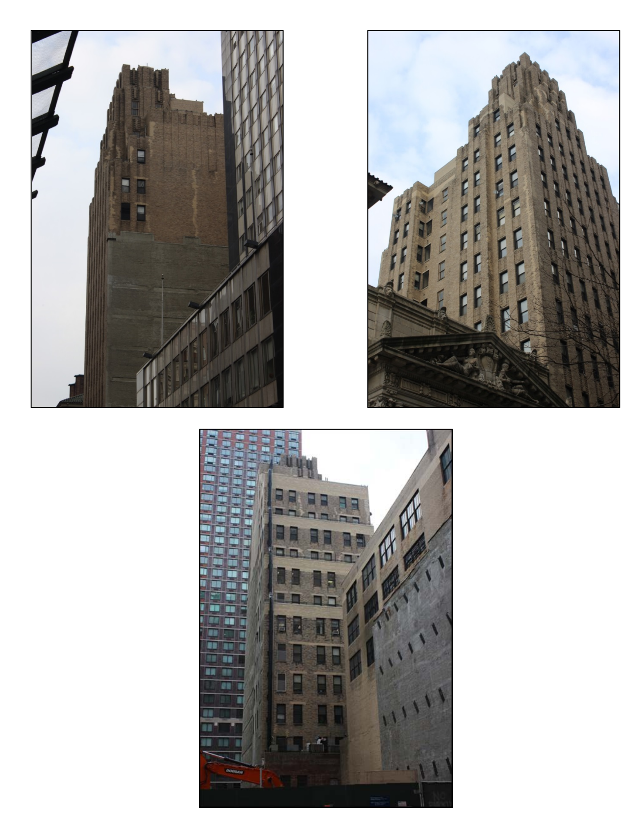
National Title Guaranty Company Building east (left), west (right), and north (bottom) facades