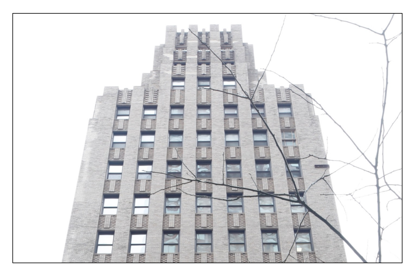
National Title Guaranty Company Building upper façade detail