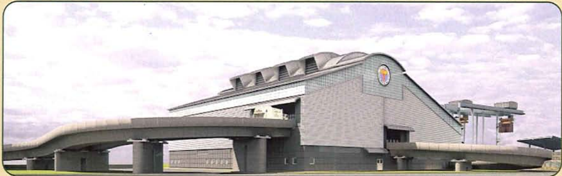
Land Side View

Copies of the Public Participation Plan, State permit applications, SWMP, FEIS, and other project-related materials can be found at: